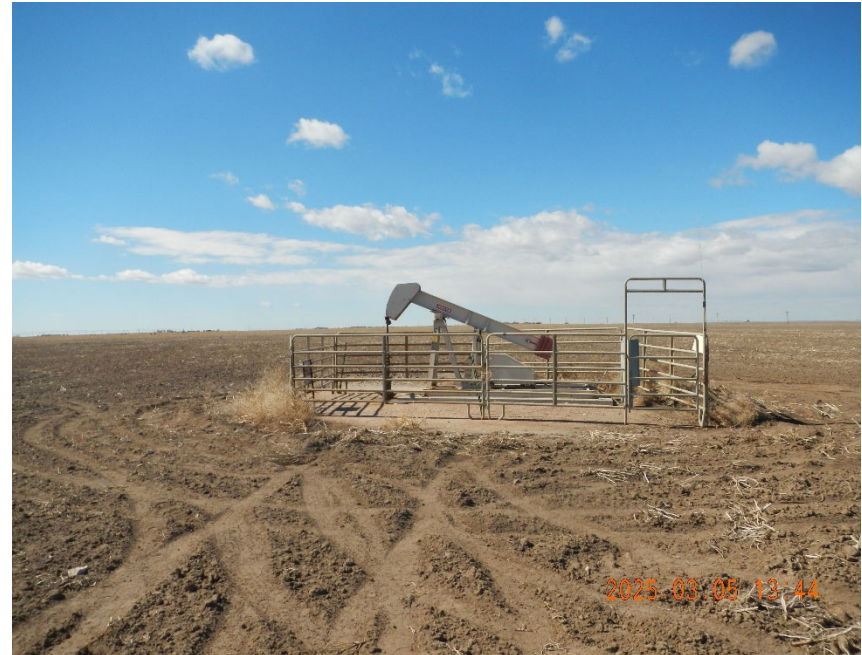
4. Well location overview.