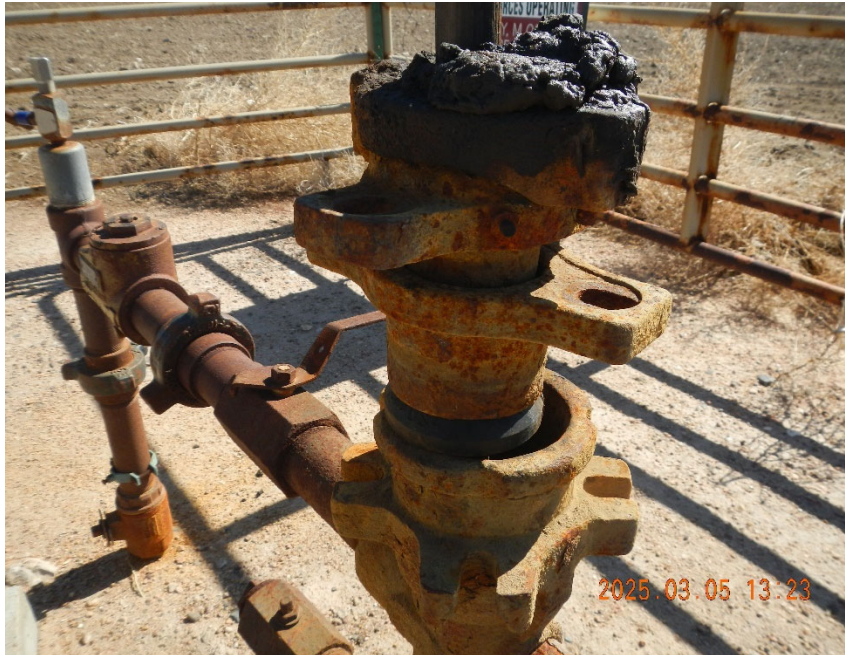
3. View of unseated stuffing box.