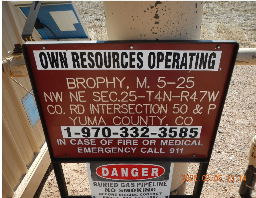
5. Lease sign at gathering location.