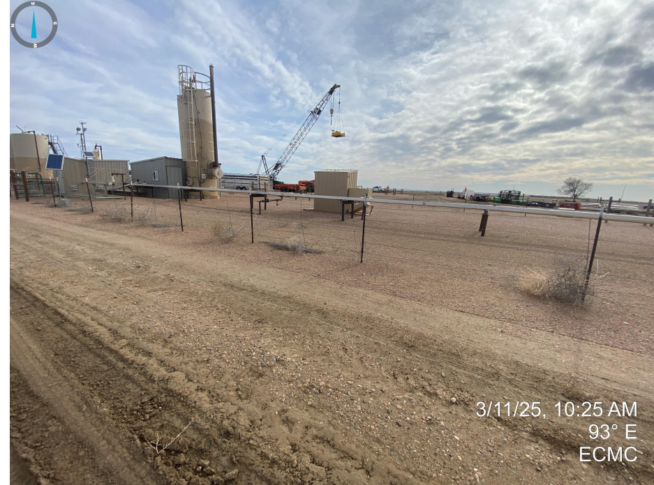
Photos 11 & 12. Tumbleweed debris observed throughout the location and within equipment.