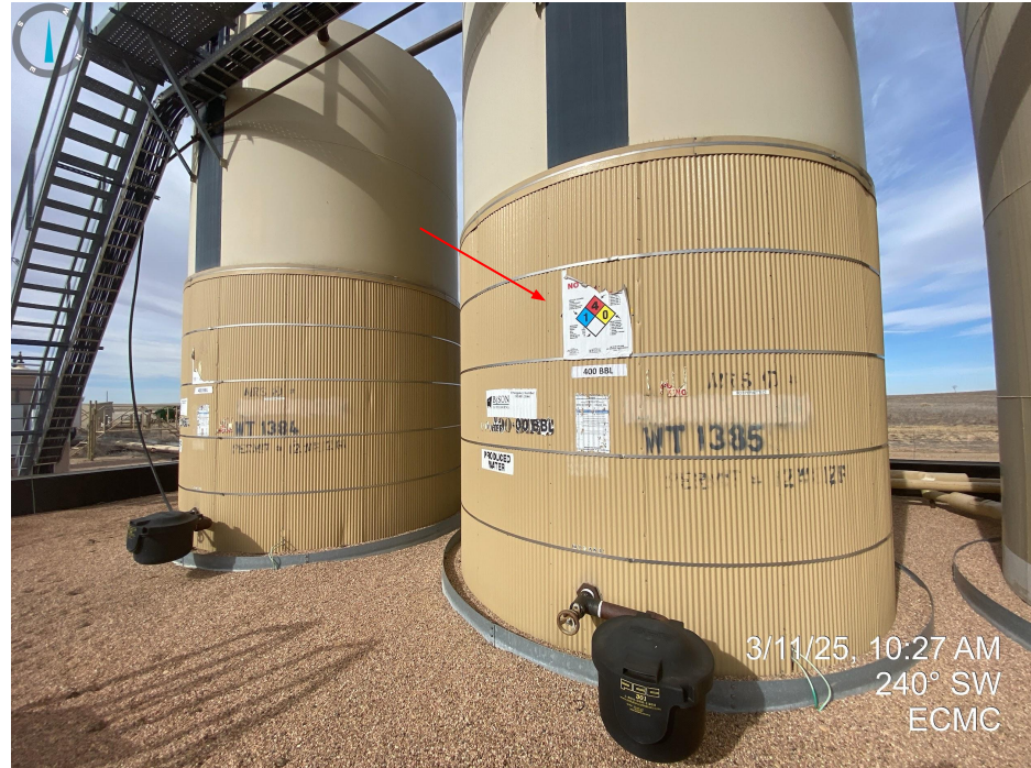
Photos 17 & 18. Tank labels/placards not legible and are peeling, faded, cracked and require replacement.