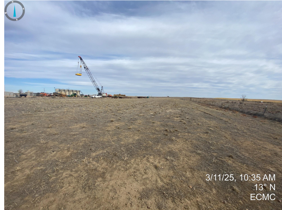
Photos 27 & 28. Taken from the southern portion of the interim reclamation areas. The interim reclamation areas do not appear to be progressing towards standards and regulations with little evidence of desirable vegetation observed.