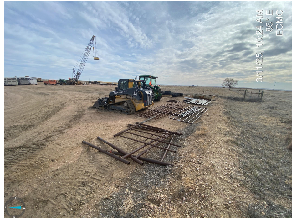
Photos 5 & 6. Various supplies and equipment being stored on the south side of the production facilities.