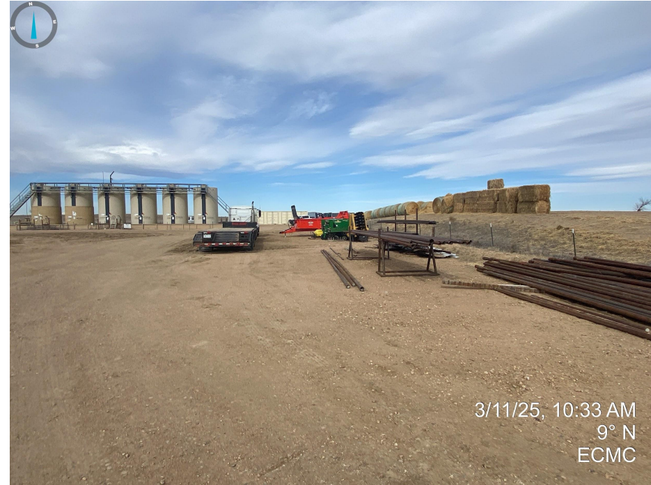
Photos 7 & 8. Various supplies and equipment being stored on the north side of the production facilities.