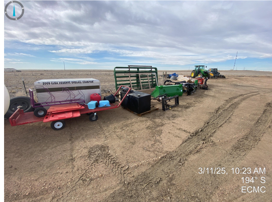
Photos 3 & 4. Various supplies and equipment being stored on the south side of the production facilities.