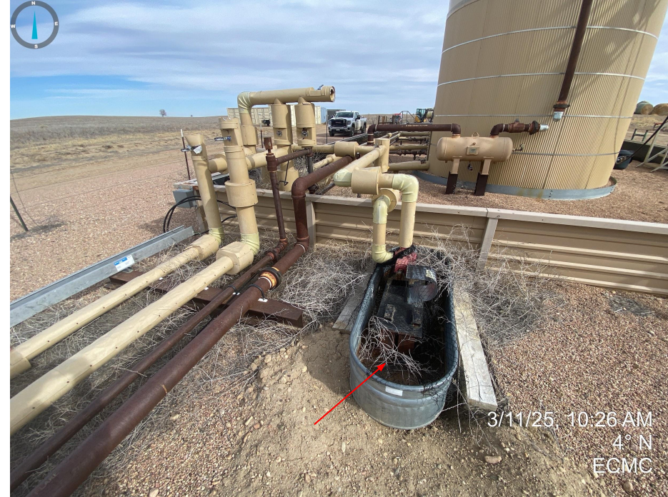
Photos 13 & 14. Tumbleweed debris observed throughout the location and within equipment. Also pictured in Photo 14 (right), wildlife netting does not appear adequate to exclude entry.