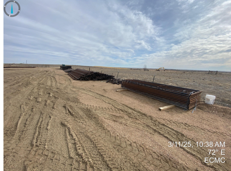
Photos 9 & 10. Various supplies and equipment being stored around the well location (Photo 9; left) and on the east side of the production facilities (Photo 10; right).