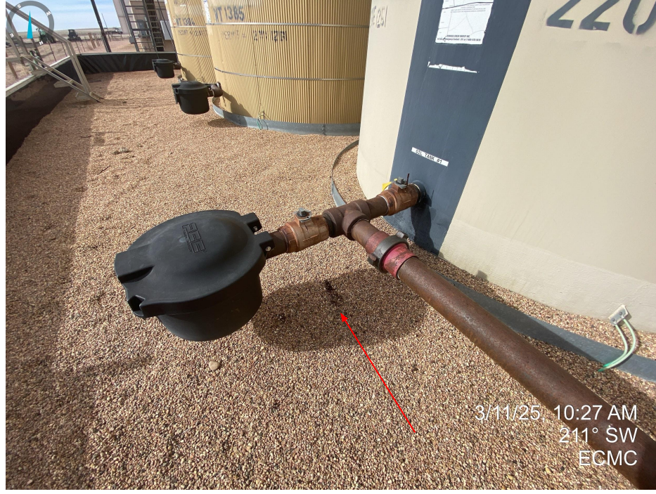
Photos 15 & 16. Hydrocarbon staining within tank battery.