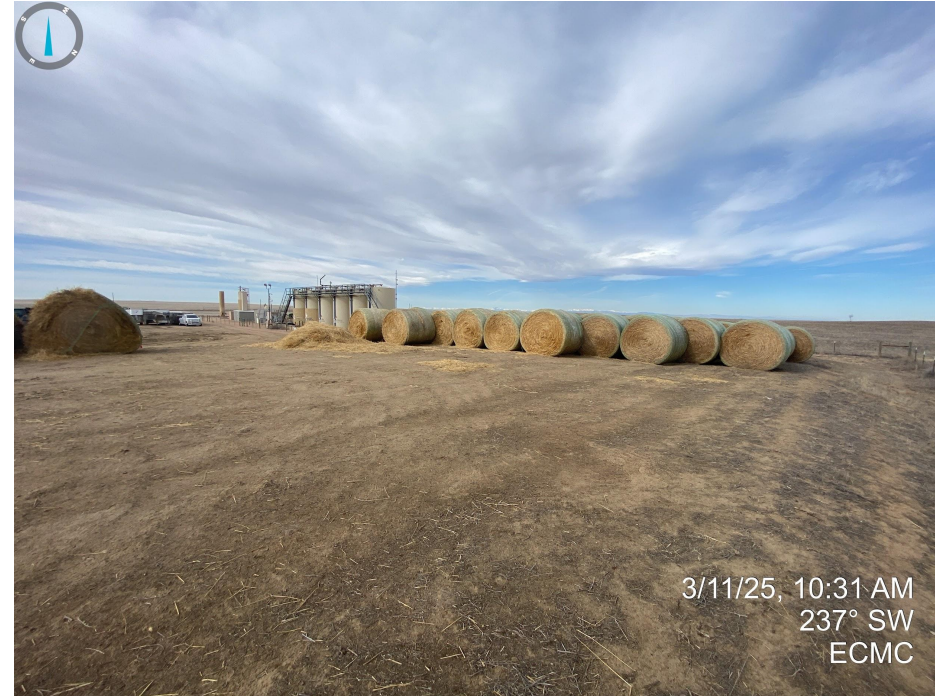
Photos 19 & 20. Bales of hay/straw being stored on top of the topsoil stockpile. Photo 20 (right) shows evidence of bare/unstabilized soils.