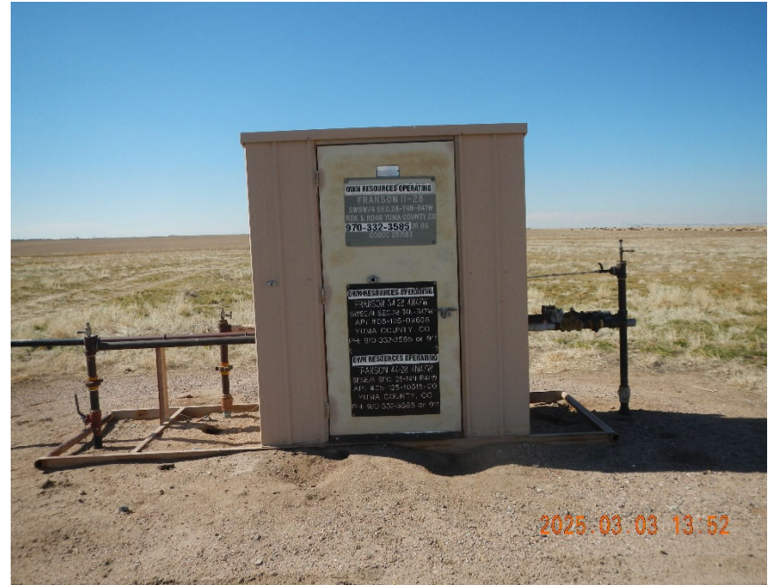
6. Gathering location overview.