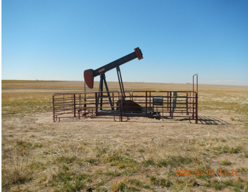
3. Well location overview.