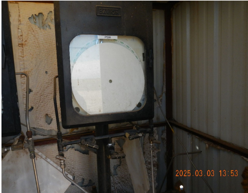
5. Gas meter inside meter shed.