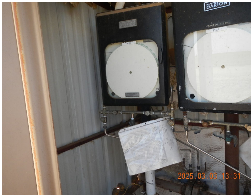
7. Gas meter inside meter shed.