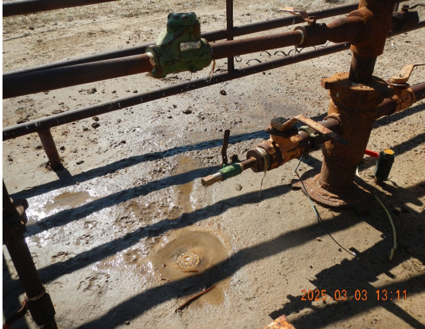
3. Additional view of wellhead. Note fluid left side of frame.