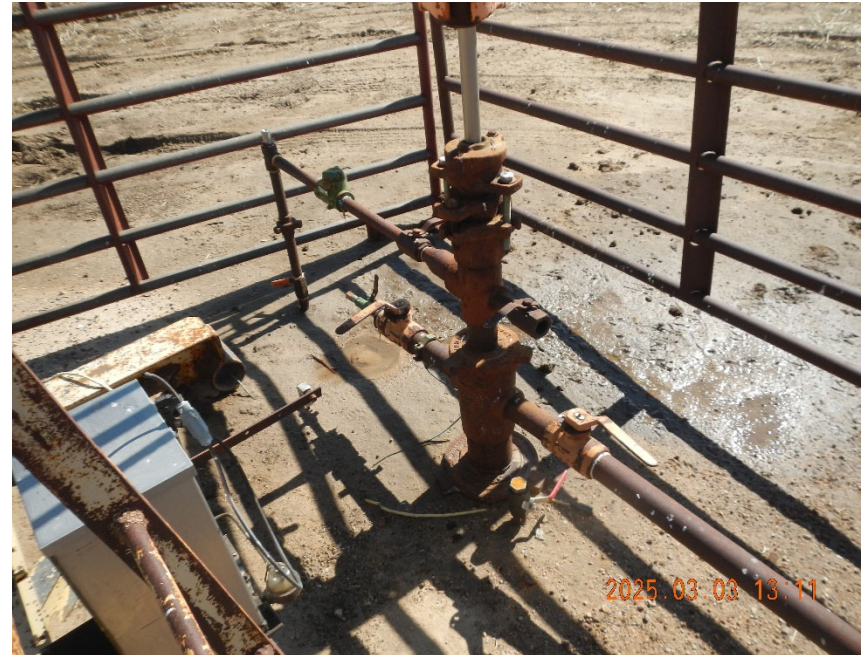
2. View of wellhead. Note fluid right side of frame.