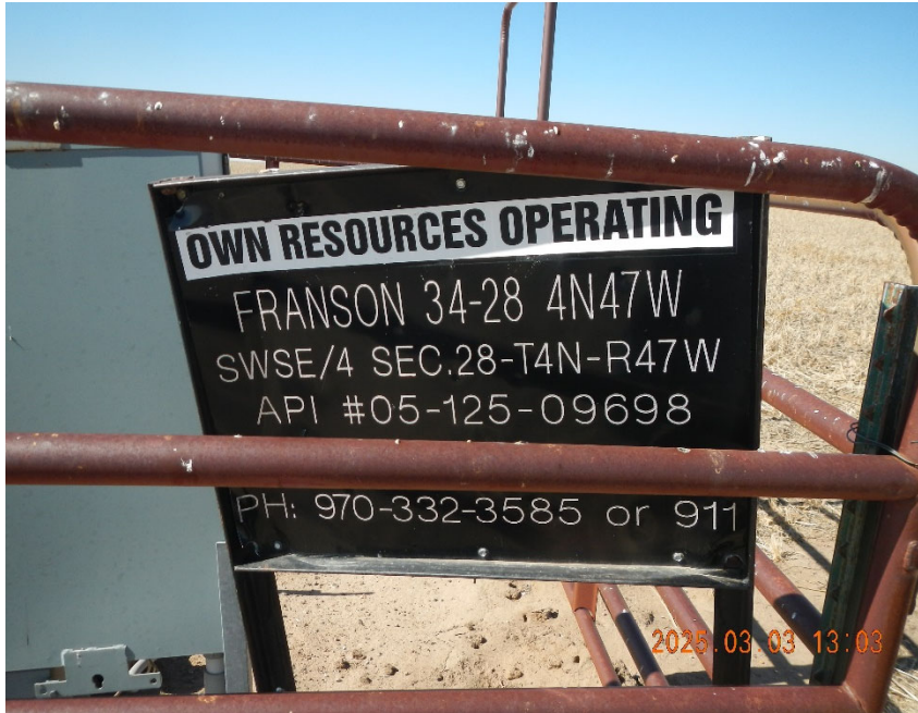
1. Lease sign at well location.