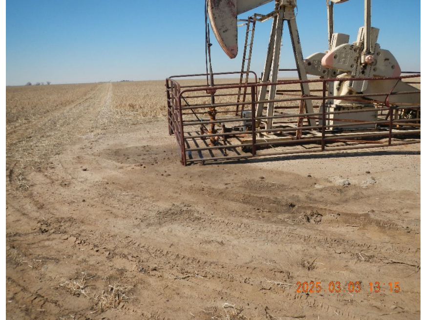
4. View of well site. Note damp soil center of frame.