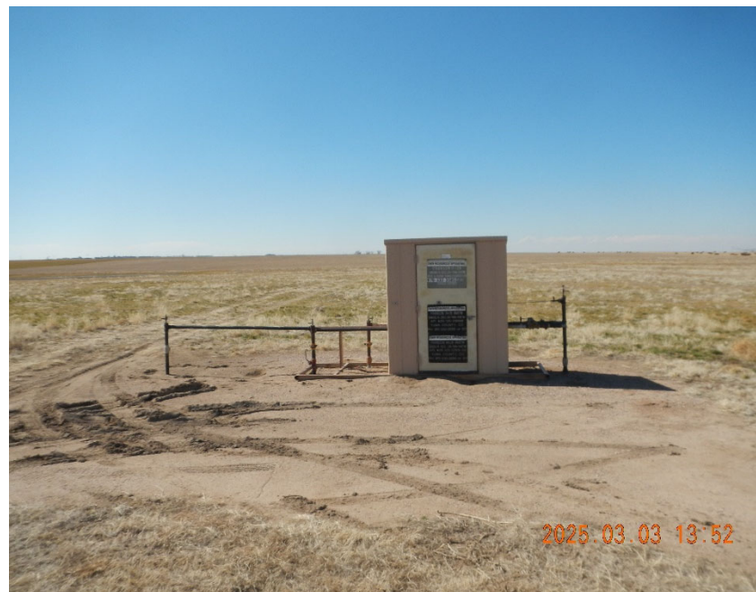
8. Gathering location overview.