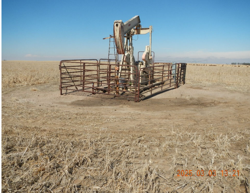
5. Additional view of well site. Note damp soil center of frame.