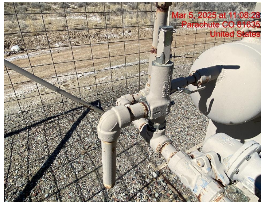
PRV Terminates in Unsafe Manner – Photo #07038