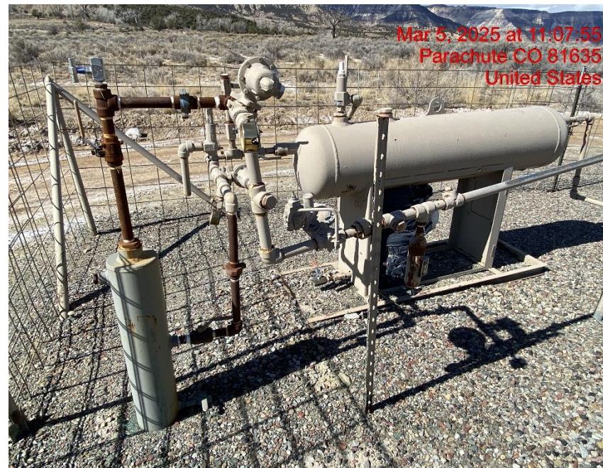
Location – Photo #07036