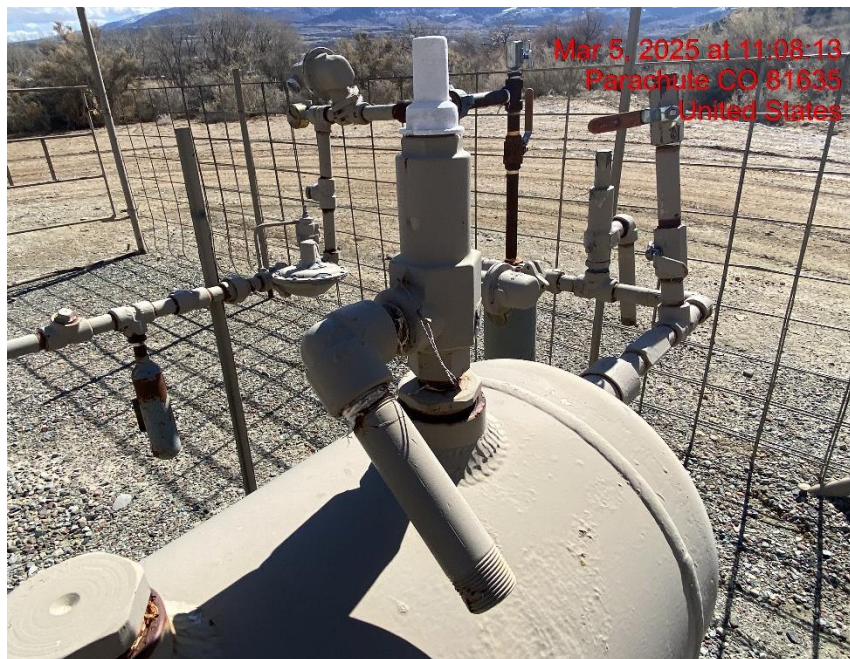
PRV Terminates in Unsafe Manner – Photo #07037