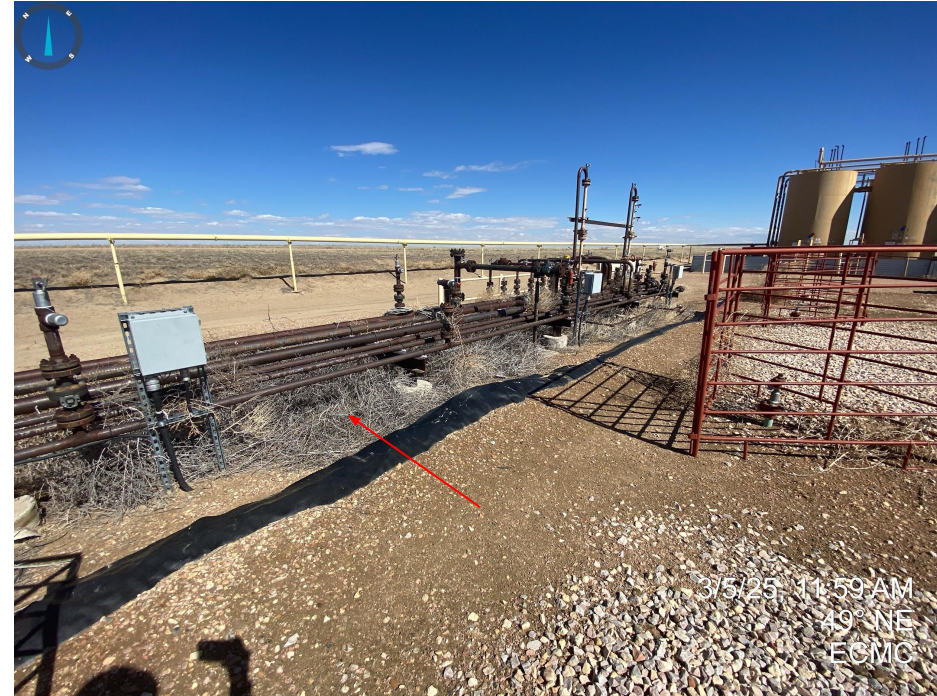
Photos 9 & 10. Lid at buried vessel not securely fastened (left; Photo 9) and tumbleweed debris within equipment (right; Photo 10).