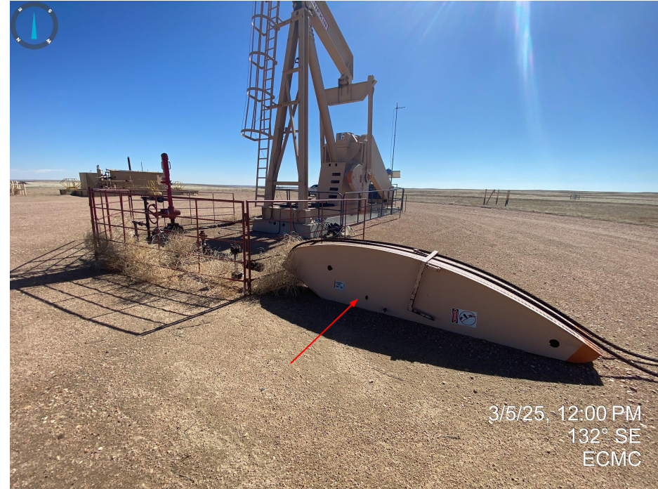
Photos 5 & 6. Unused equipment observed throughout the location.