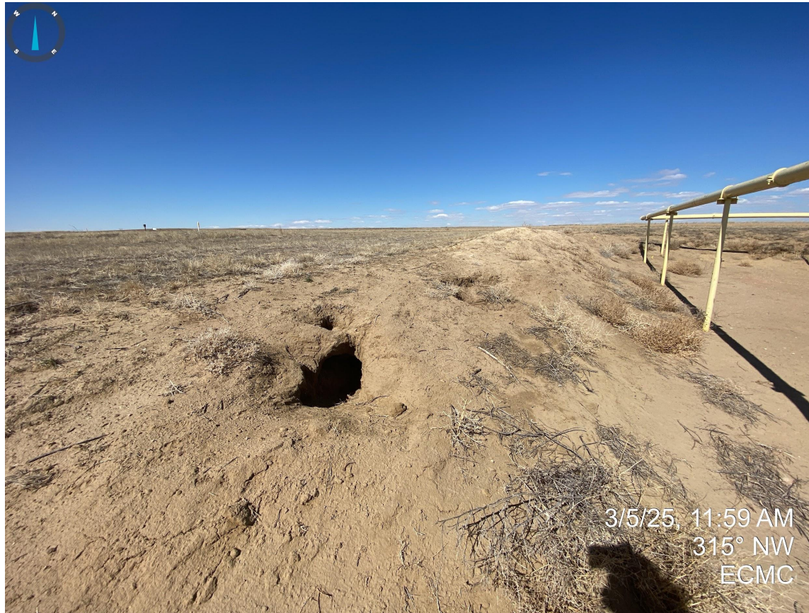
Photo 11. Stockpiled soils on the western portion of the production areas have evidence of undesirable vegetation, animal burrows, and bare/exposed soils.