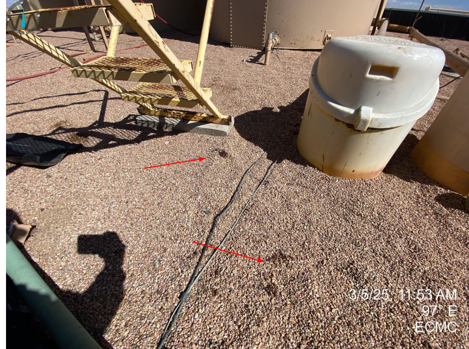
Photos 3 & 4. Hydrocarbon staining observed within the tank battery secondary containment.