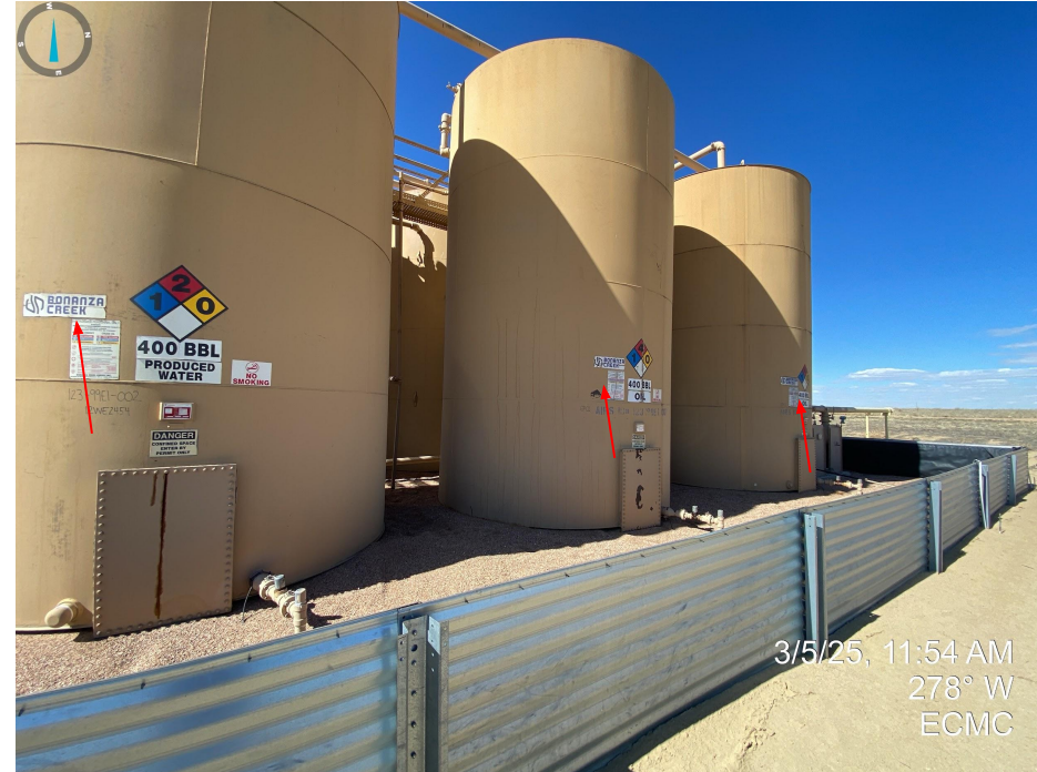
Photos 1 & 2. Signs at entrance, wellhead and tank labels do not reflect current operator of record.