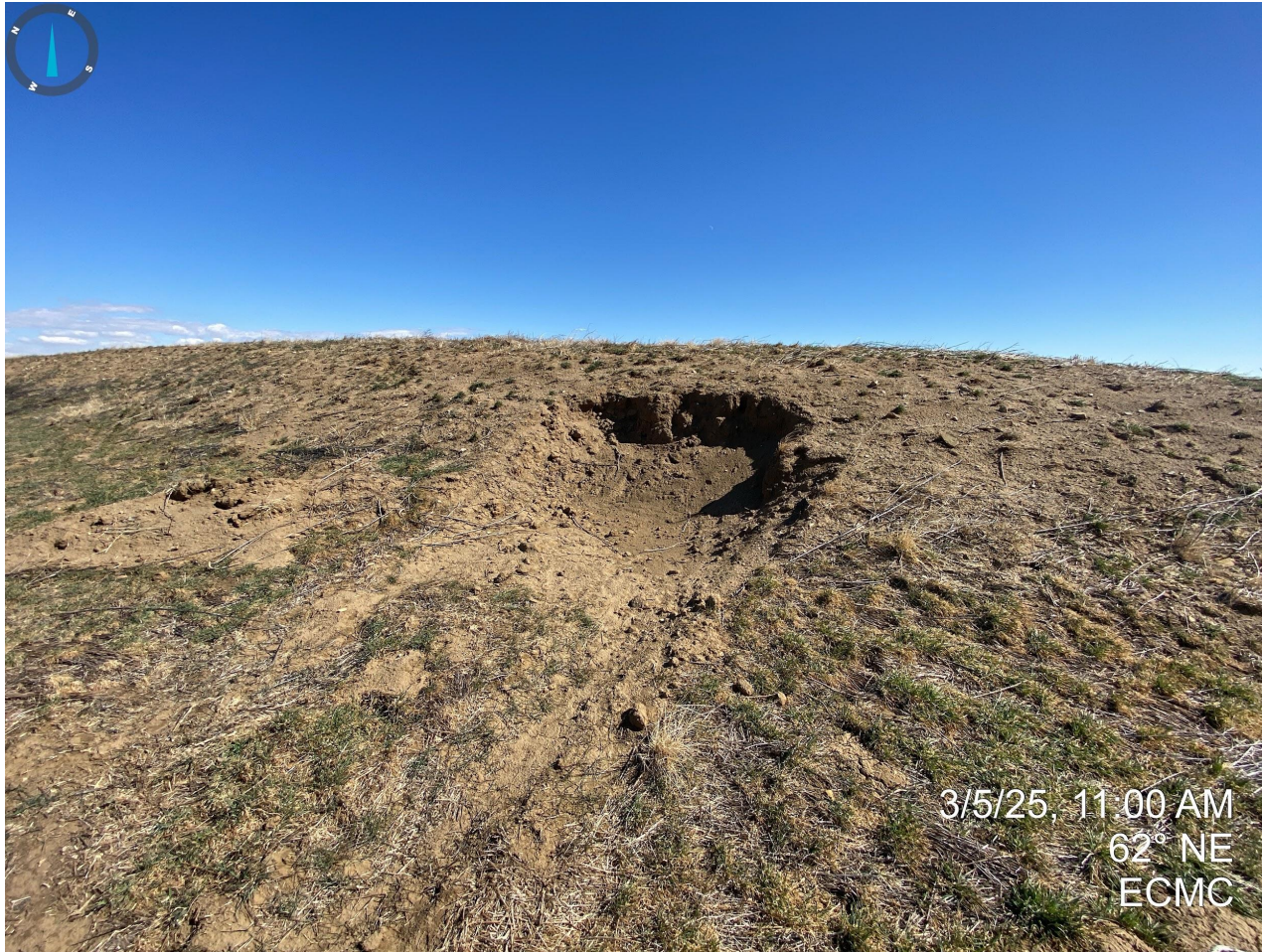
Photo 12. It appears that several cubic yards of topsoil have been removed from the stockpile.