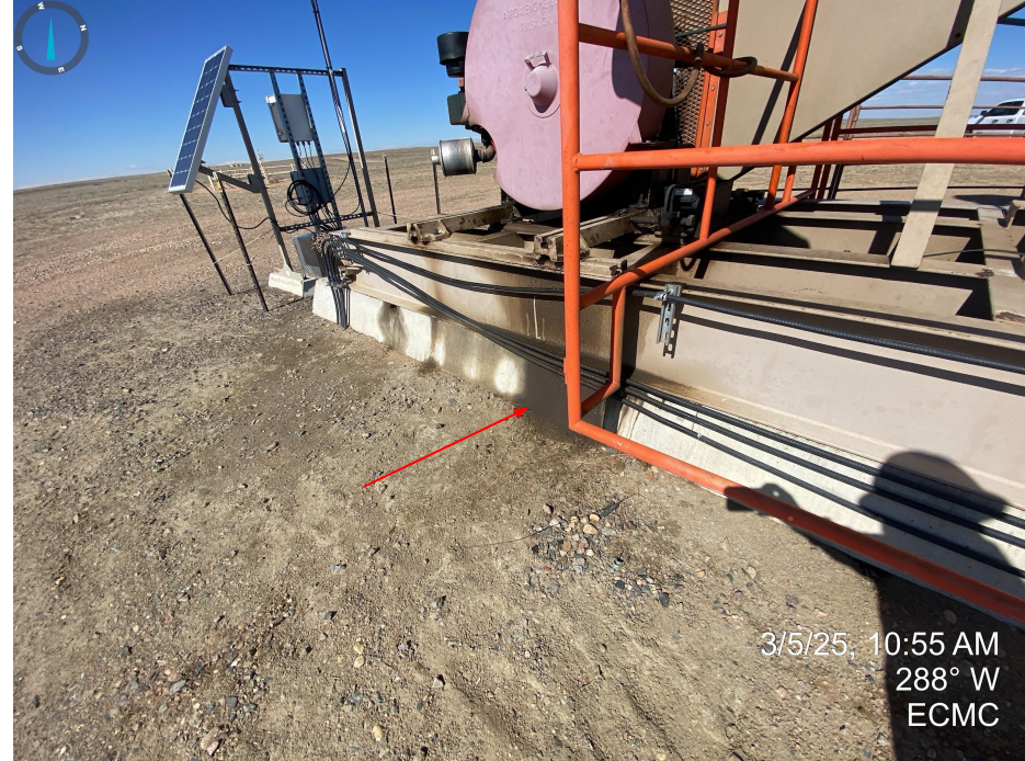
Photos 4 & 5. Hydrocarbon staining observed at pumpjack unit.