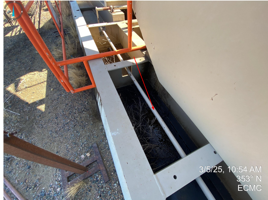
Photos 2 & 3. Hydrocarbon staining observed at pumpjack unit.