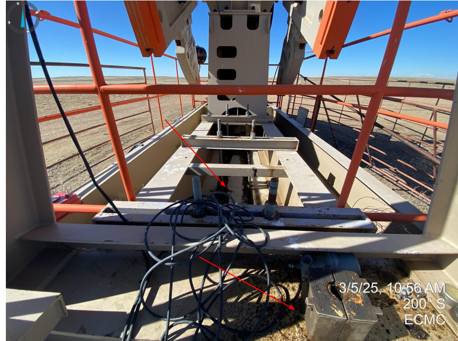
Photos 6 & 7. Hydrocarbon staining observed at pumpjack unit.