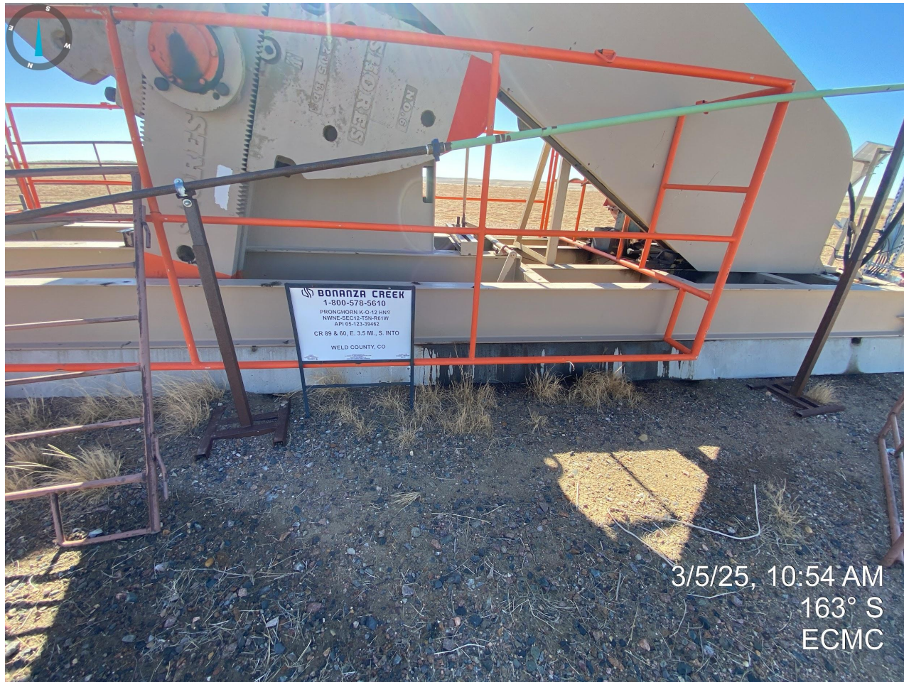
Photo 1. Sign at well does not reflect current operator of record.