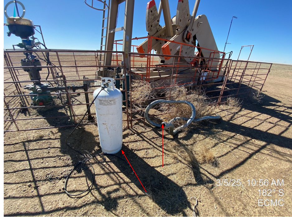
Photos 8 & 9. Unused equipment and tumbleweed debris observed at well.