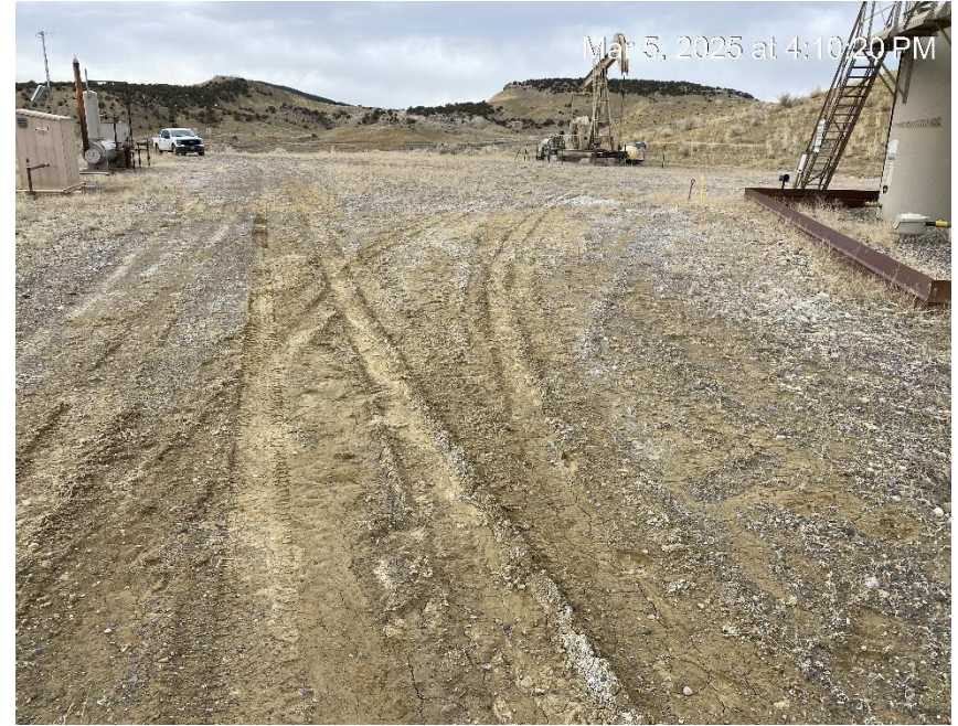
Location from East entrance