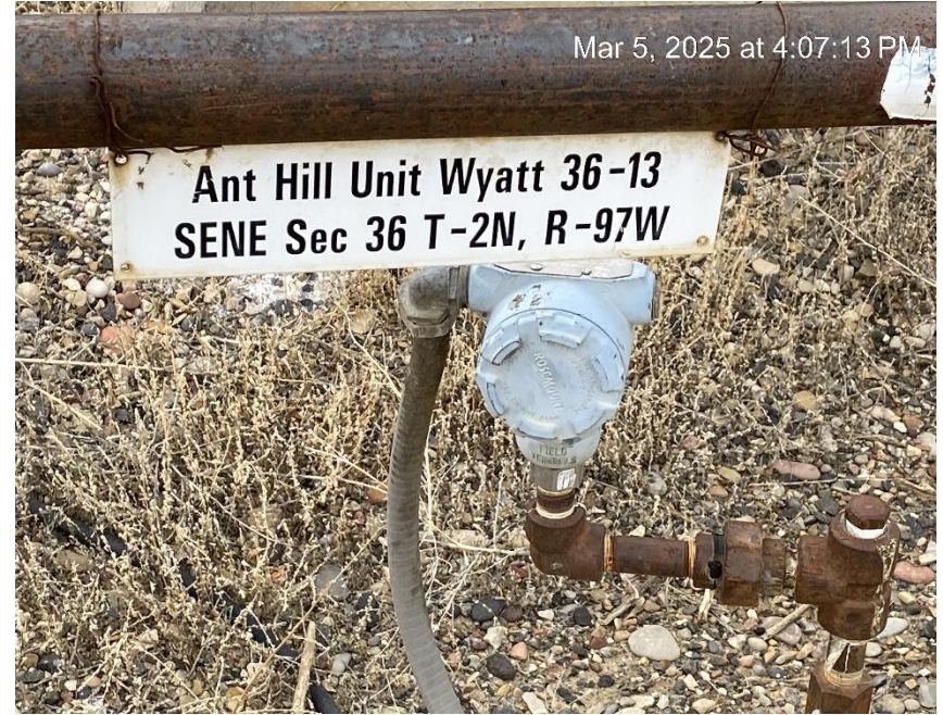
Missing required information