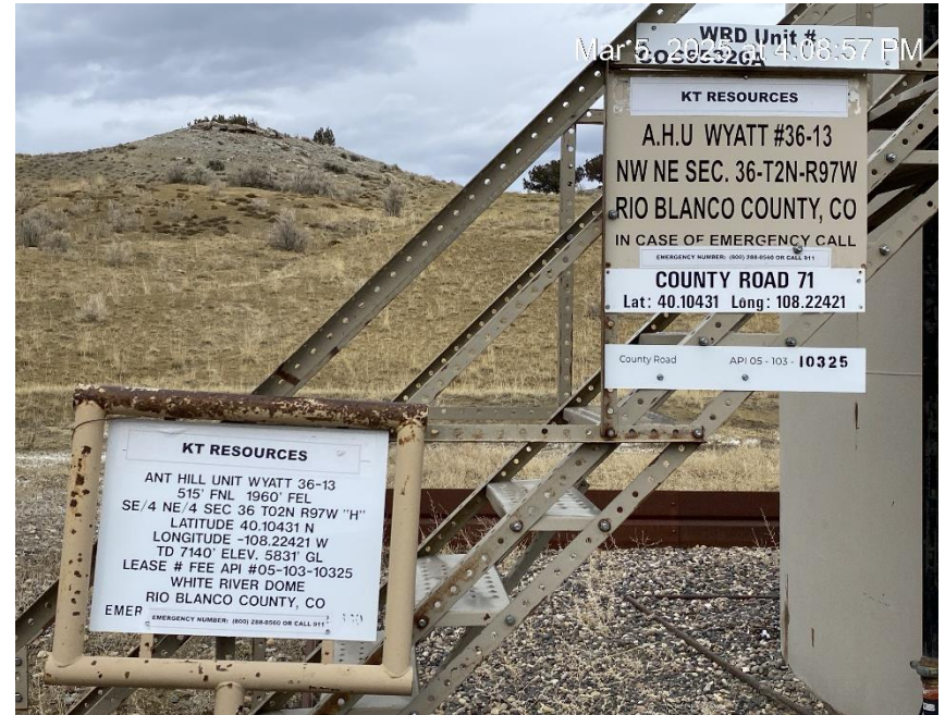
Conflicting information. Incorrect sign is debris.