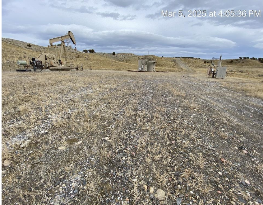
Location from West entrance