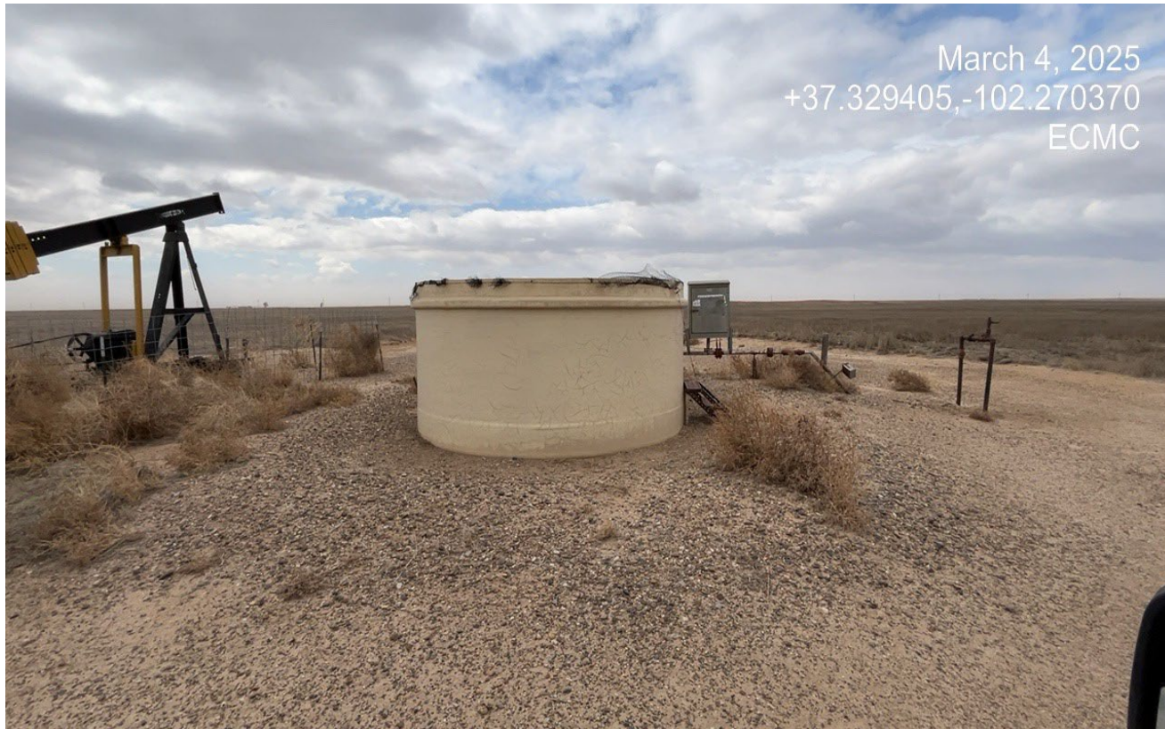
Photo 2. The secondary containment is insufficient to contain a spill.