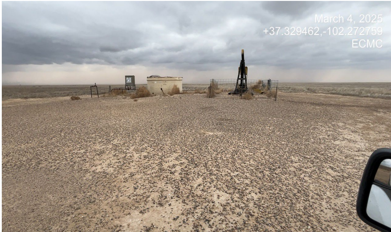
Photo 1. Facing east toward the wellsite.