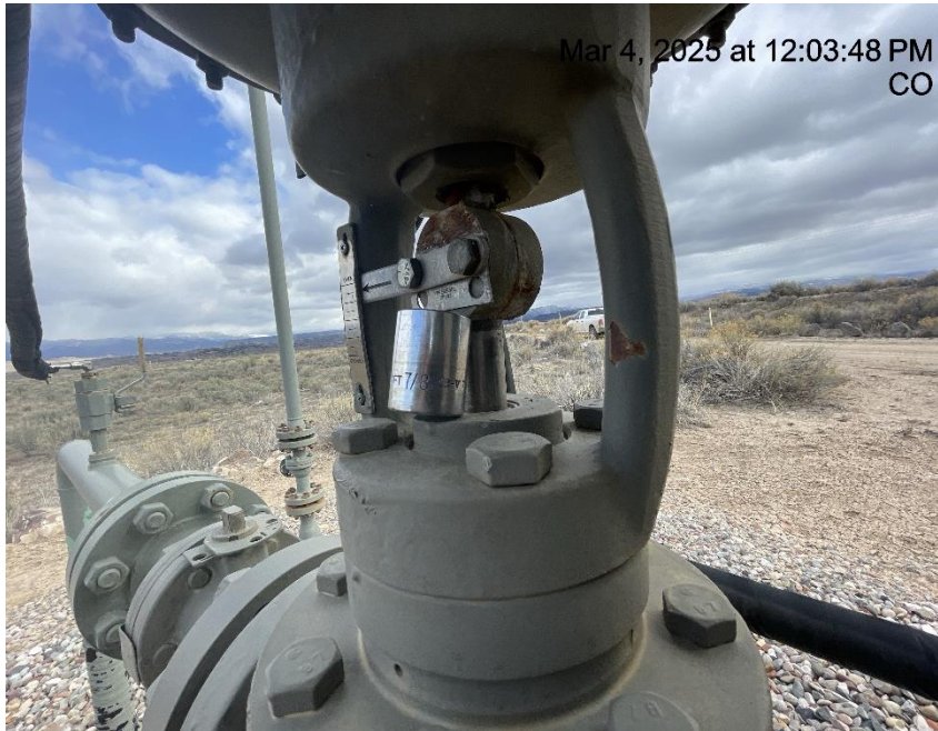
Photo # 551 Pneumatic control valve on summit pipeline near meter house has been modified/valve no longer has the ability to close