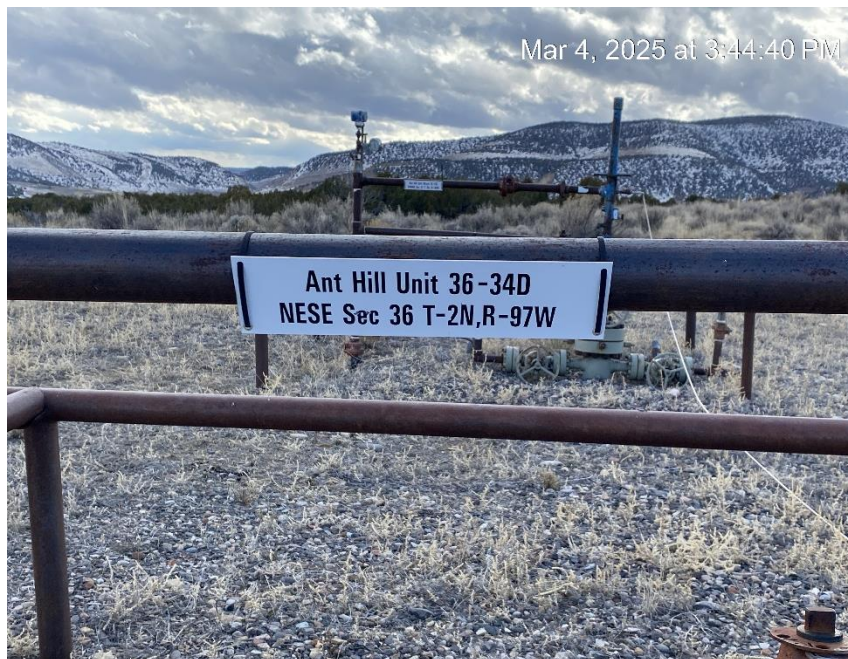
Missing required information