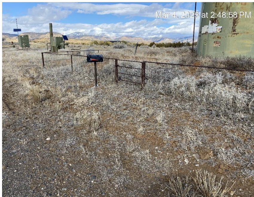
Location from Southwest entrance