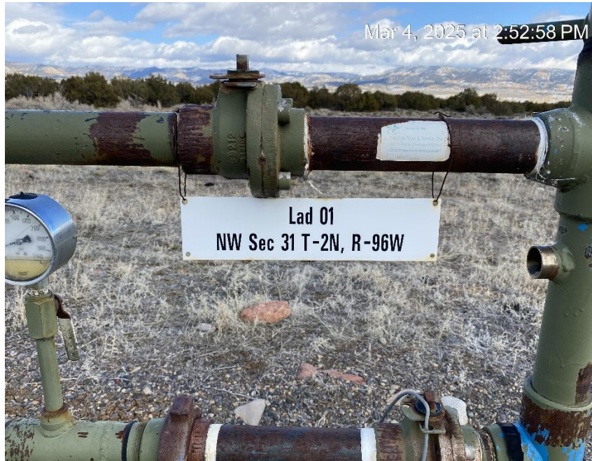
Missing required information