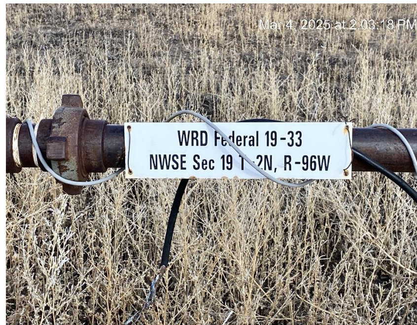
Missing required information