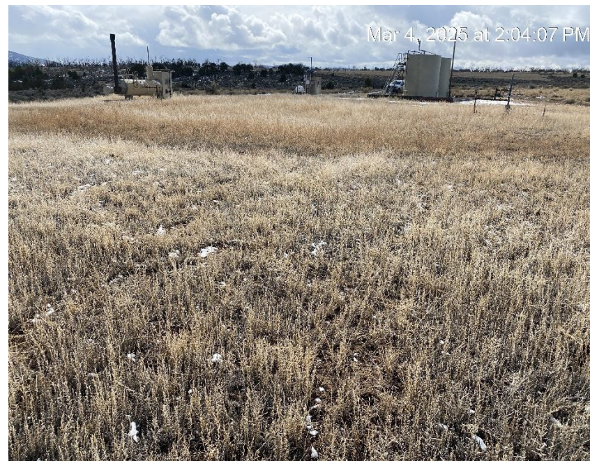
Location from Northeast corner