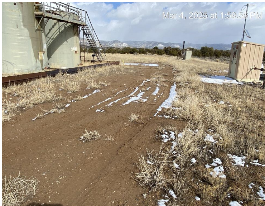
Location from West entrance