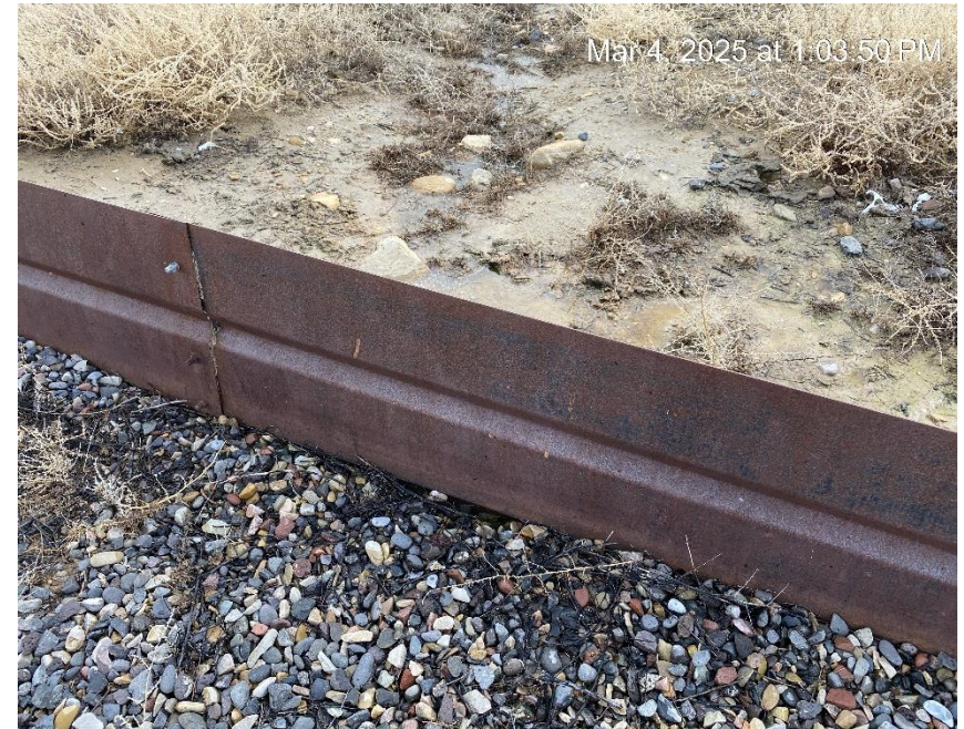
Berm leak at Southwest corner