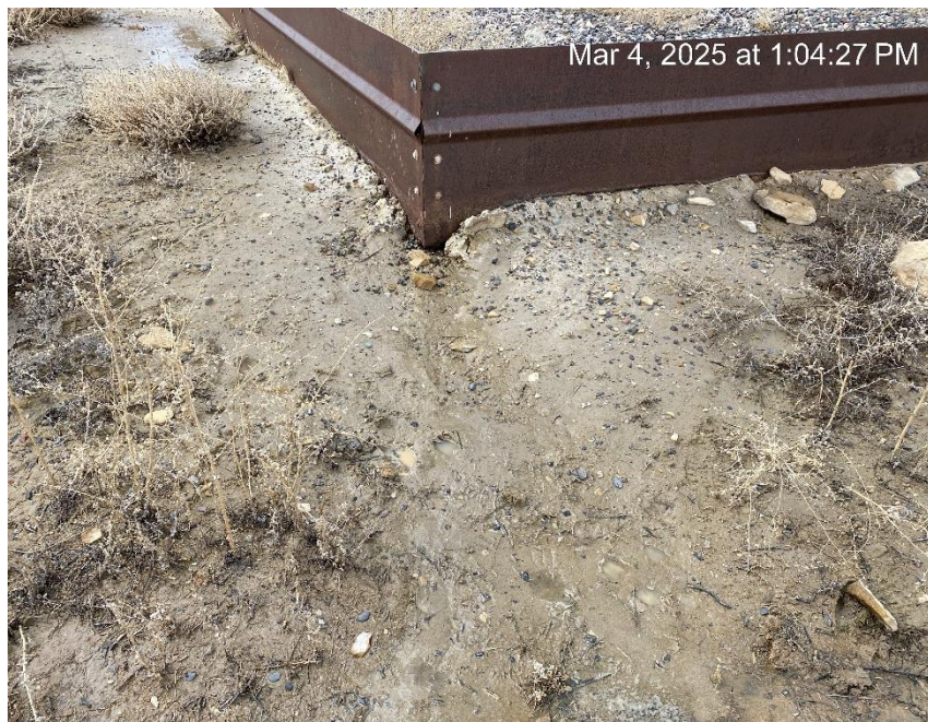
Berm leak at Southeast corner