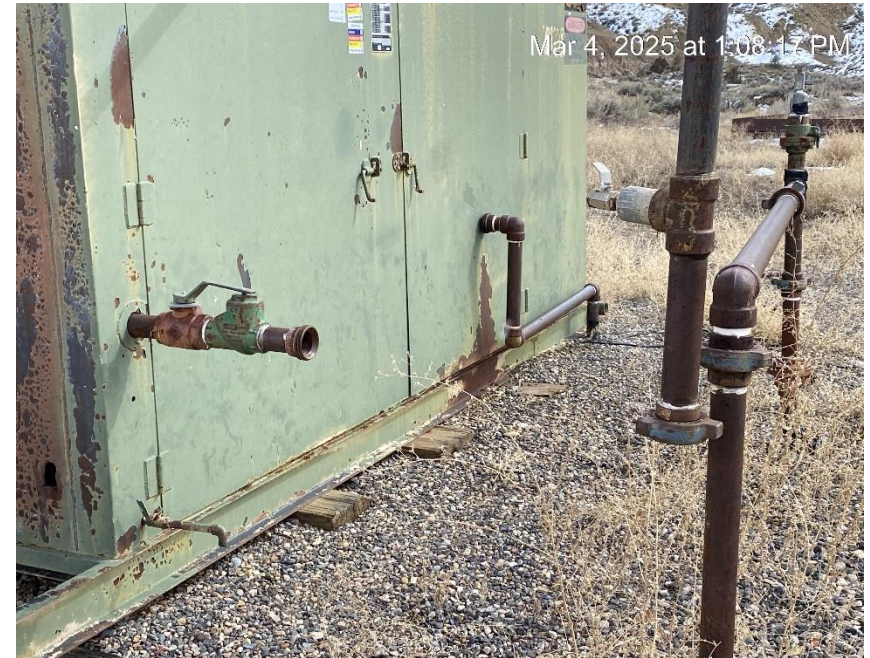
Disconnected lines off separator