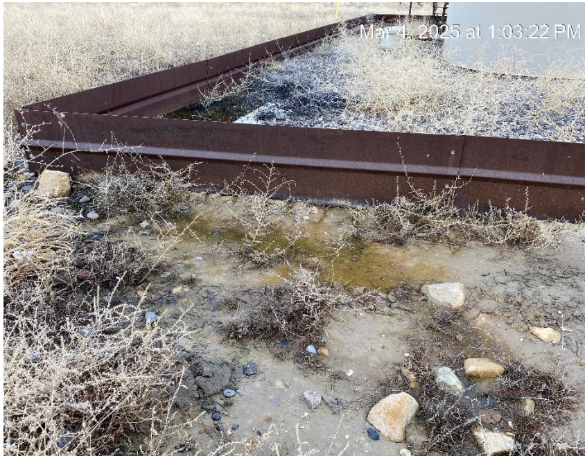
Berm leak at Southwest corner