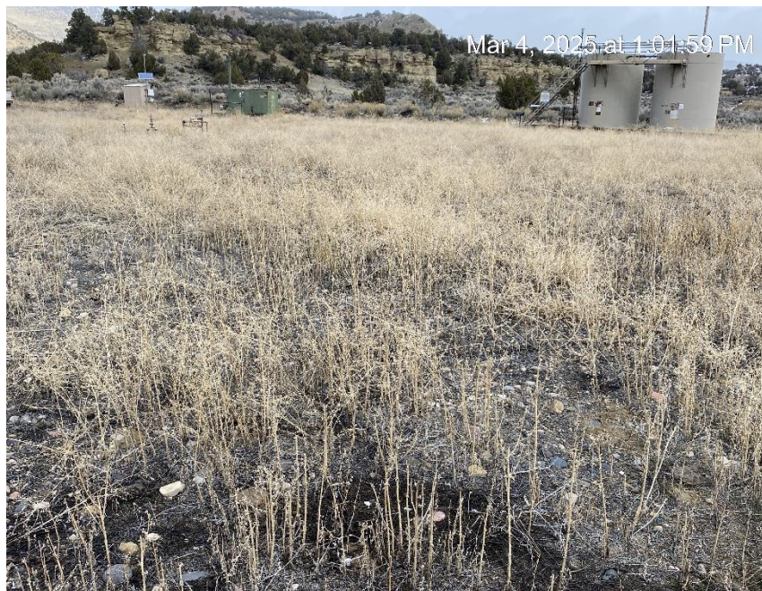
Location from the West