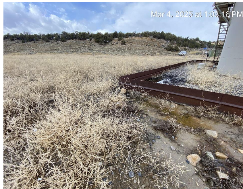
Location from Southeast corner