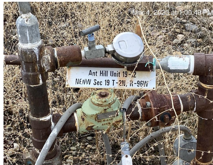
Missing required information