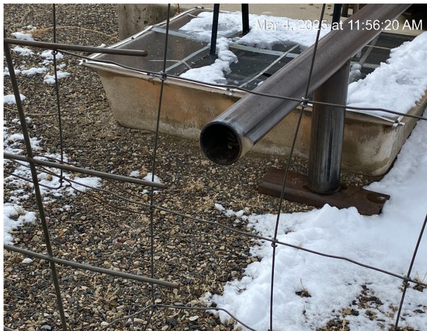
Open to wildlife