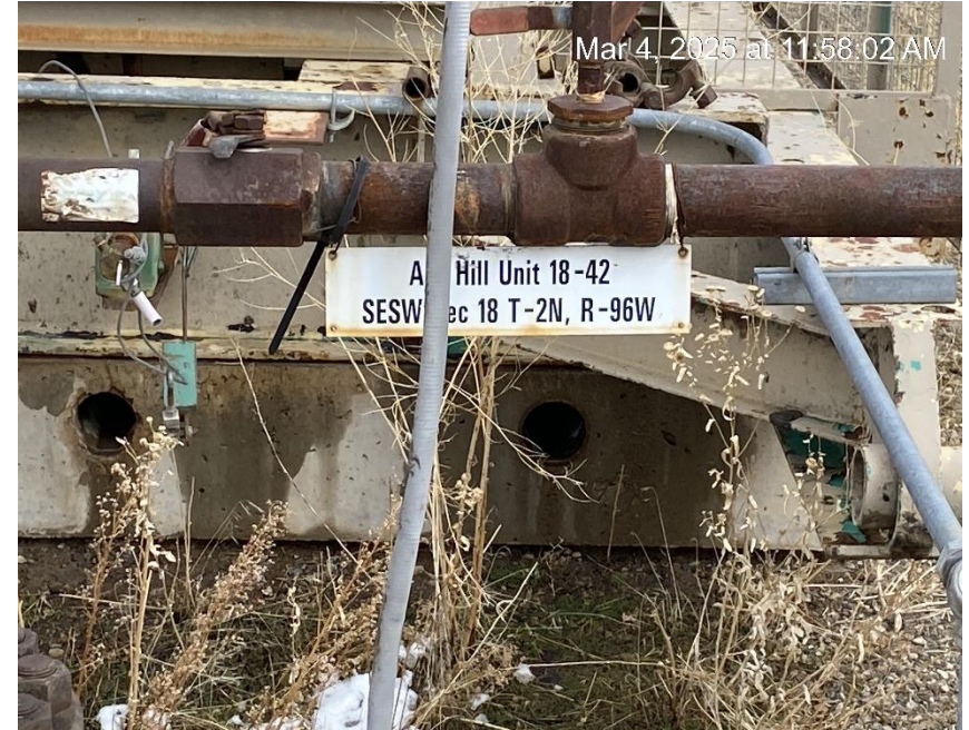
Missing required information