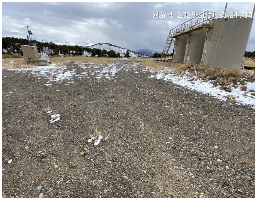
Location from North corner