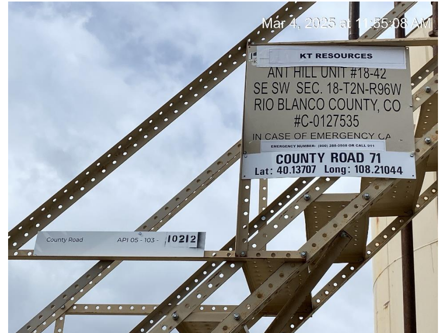
Above 6 feet