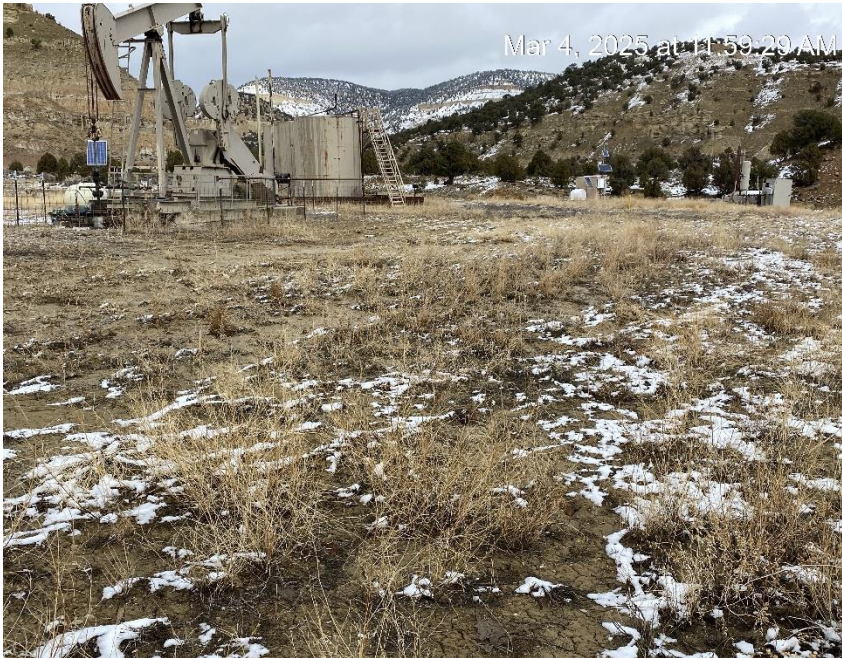
Location from South corner