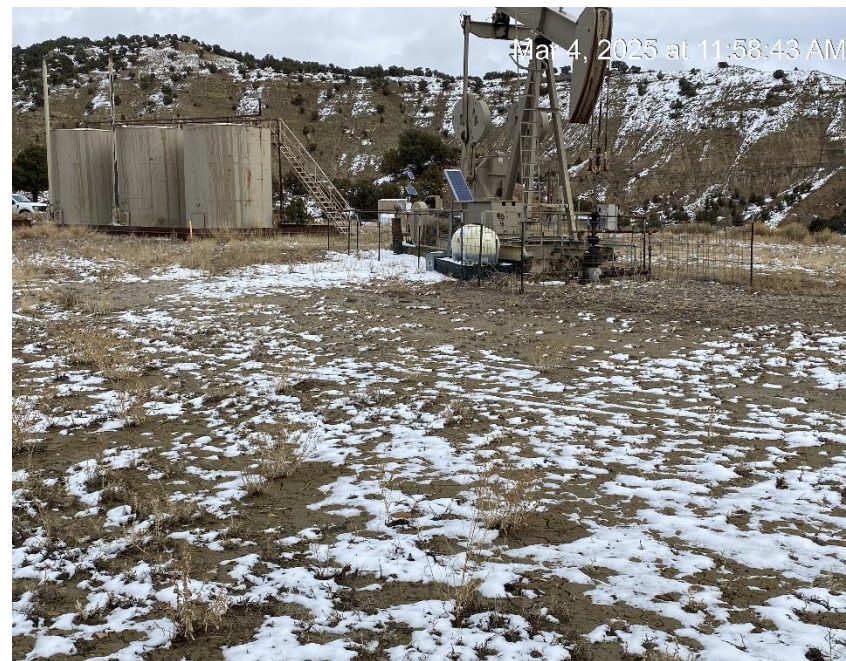
Location from West corner