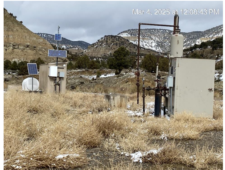
Location from East corner