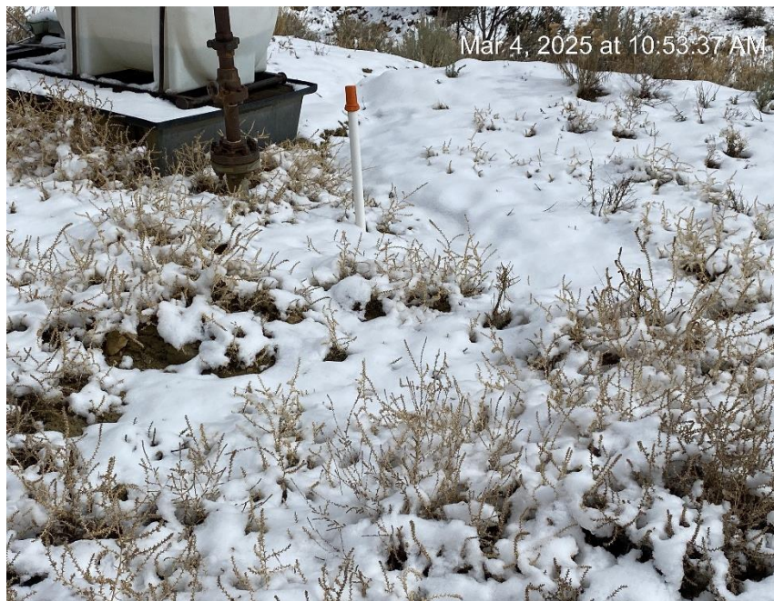
Erosion and sediment migration leaving location