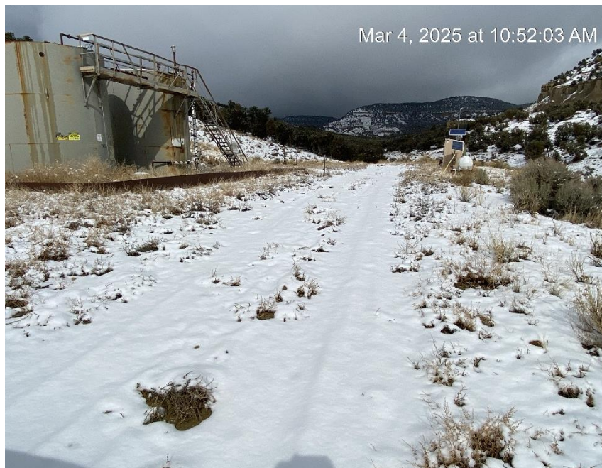
Location from the South entrance