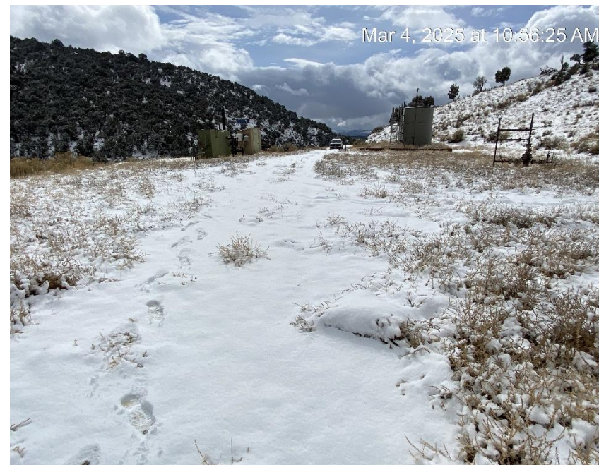
Location from the North