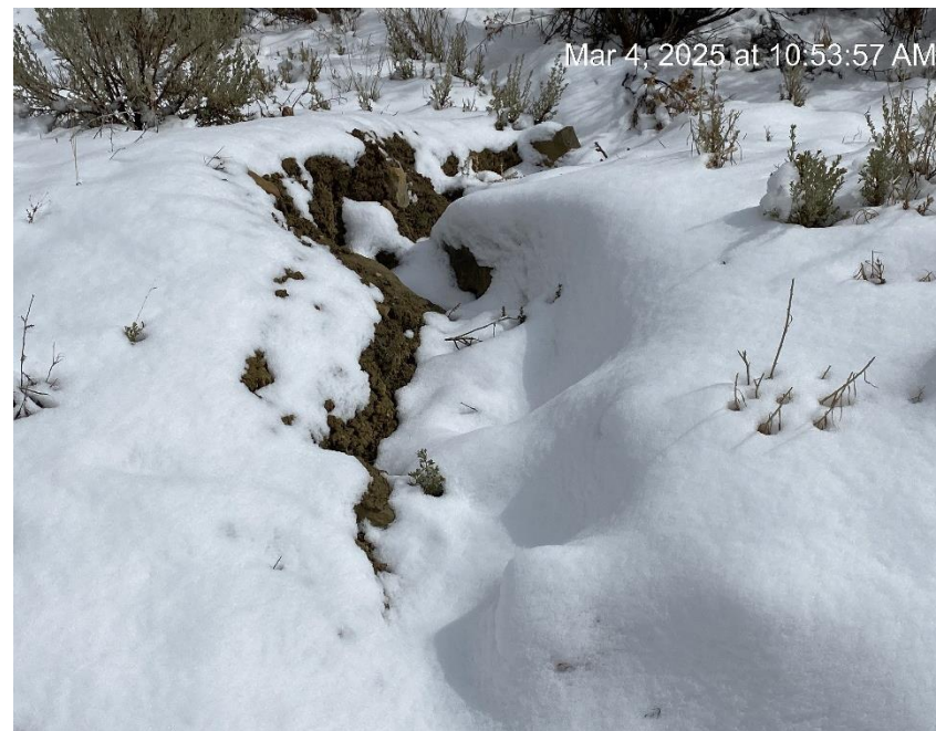
Erosion and sediment migration leaving location