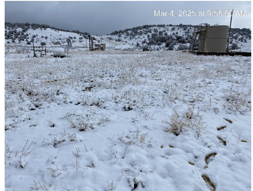
Location from the Northwest