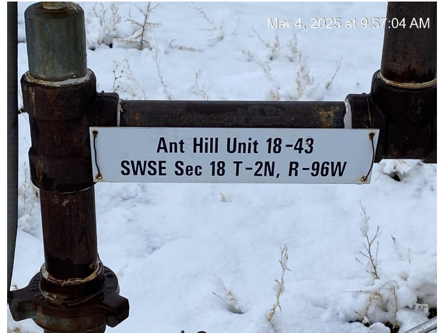
Required information missing