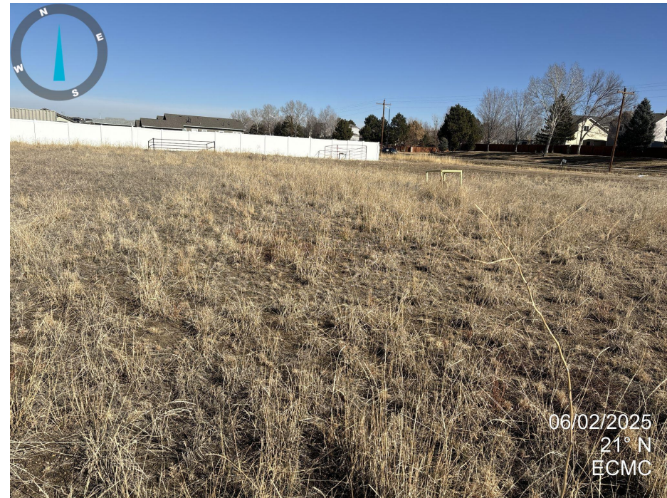
Photo 2. Looking north across location. Desirable vegetation has established on parts of the location.