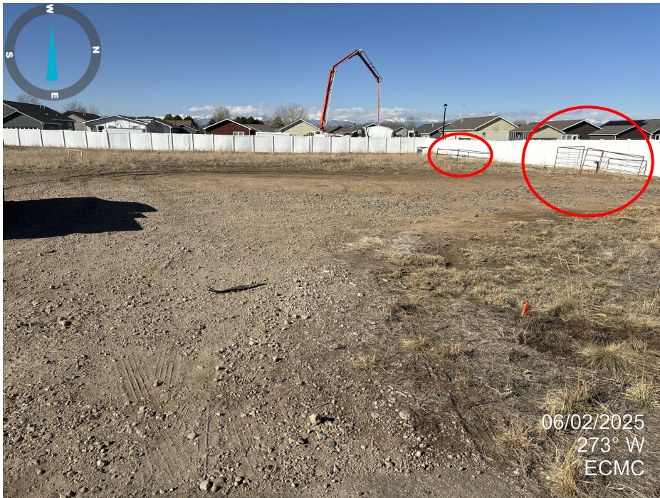
Photo 1. Looking west across location. Two risers associated with KPK remain on location (red circles). Access road appears to be used for construction and midstream pipeline access.