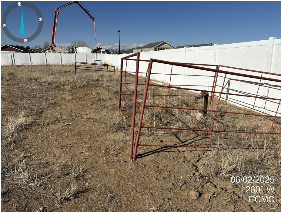
Photo 3. Risers at the north side of location. These risers appear to be associated with KP Kauffman Company INC. Vegetation establishment is poor around the risers.