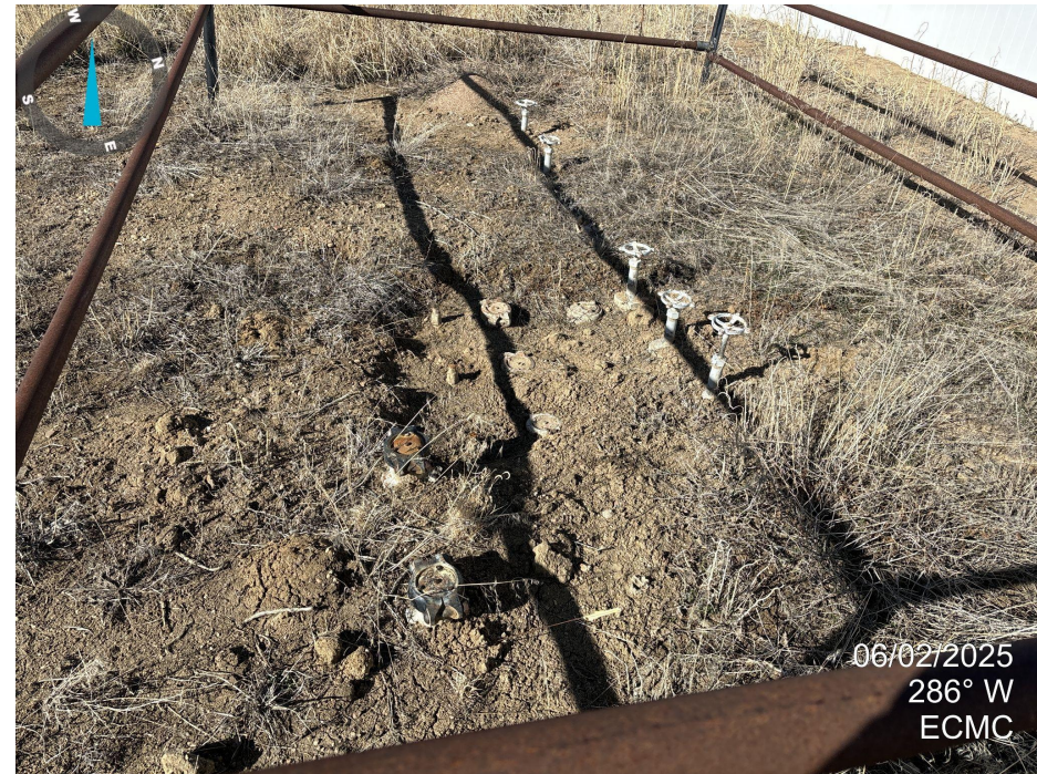
Photo 4. Risers at the northwest part of the location. See Photo 3 comments.