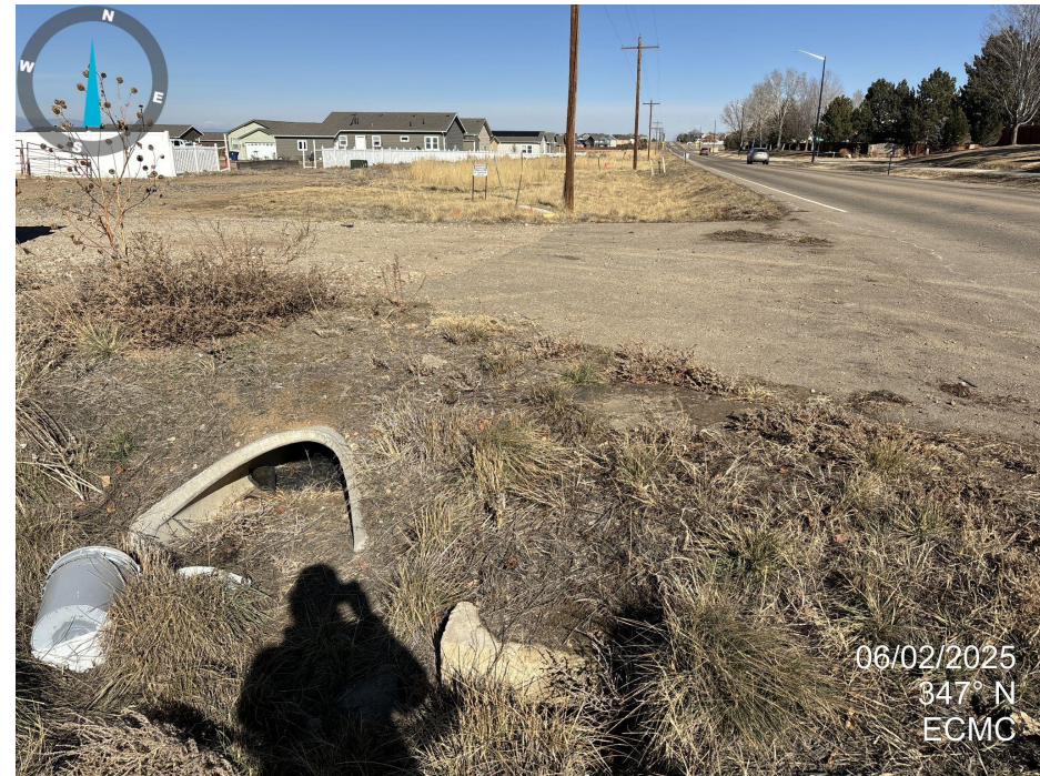
Photo 6. Culvert remains in place. Trash (bucket) is present near culvert.