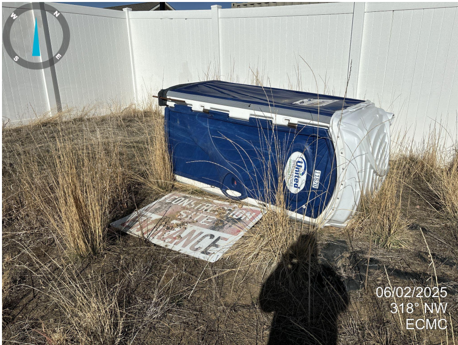
Photo 5. Tipped over port a let in the northwest corner of location.