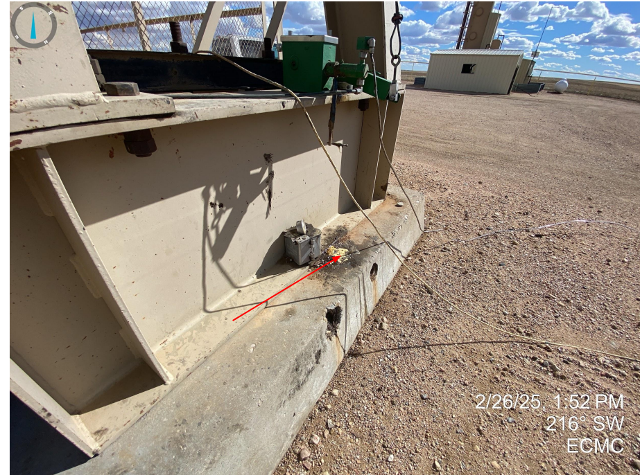
Photos 3 & 4. Hydrocarbon staining on equipment at wellhead and pump jack unit.