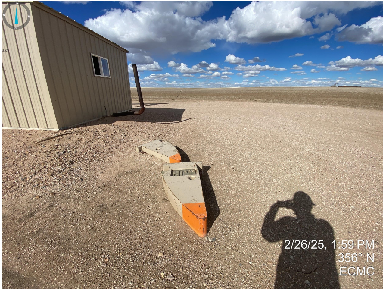
Photo 6. Pump jack weights being stored on location.