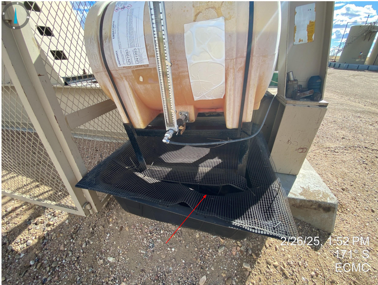
Photo 5. Wildlife netting inadequate at day tank.