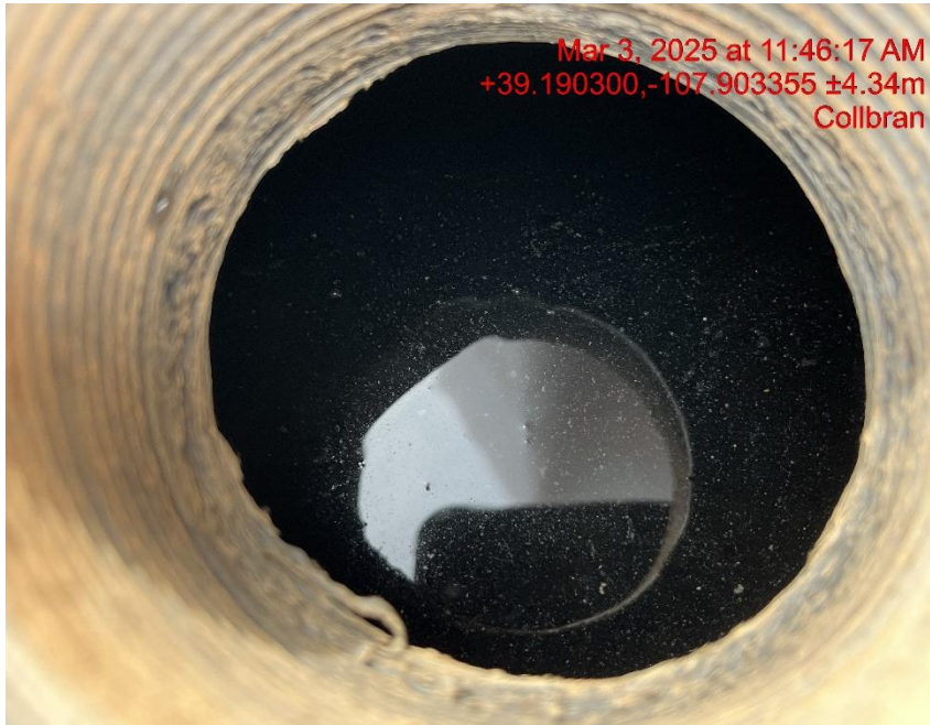
Photo # 6193 Failure to maintain chemical BMP's/chemical containments full of fluid & not sufficient to contain possible spill