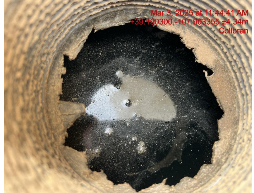
Photo # 6190 Failure to maintain chemical BMP's/chemical containments full of fluid & not sufficient to contain possible spill

Mar 3, 2025 at 11:44:41 AM +39.190300,-107.903355 ±4.34m Collbran