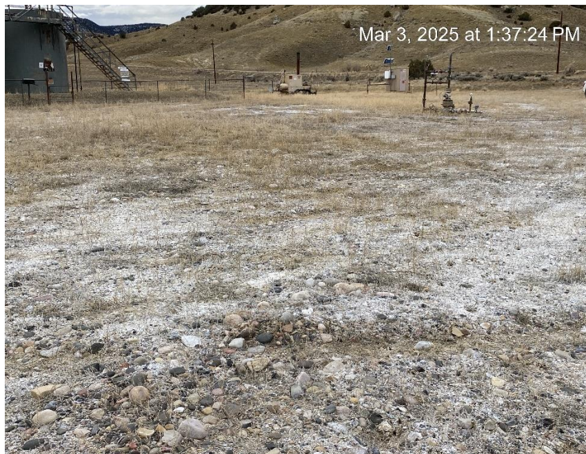
Location from North corner