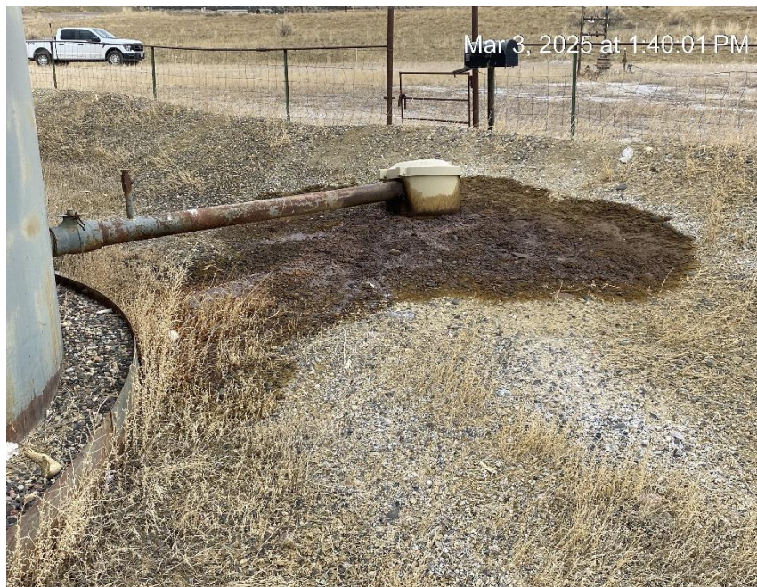
Leaking load line