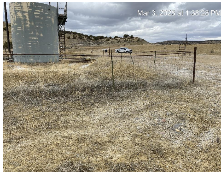
Location from East corner