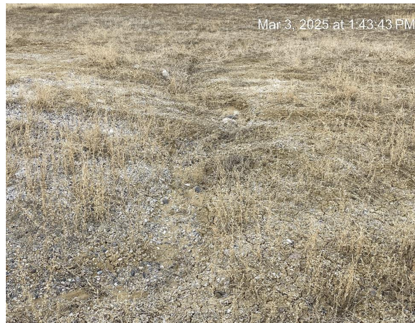
Erosion and sediment migration from location