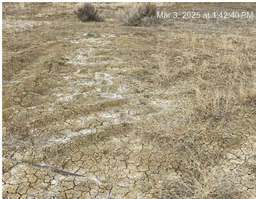
Erosion and sediment migration from location