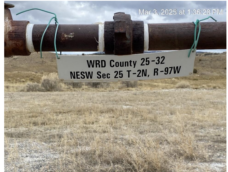
Missing required information