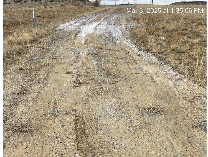
Sediment migration from access road on to location