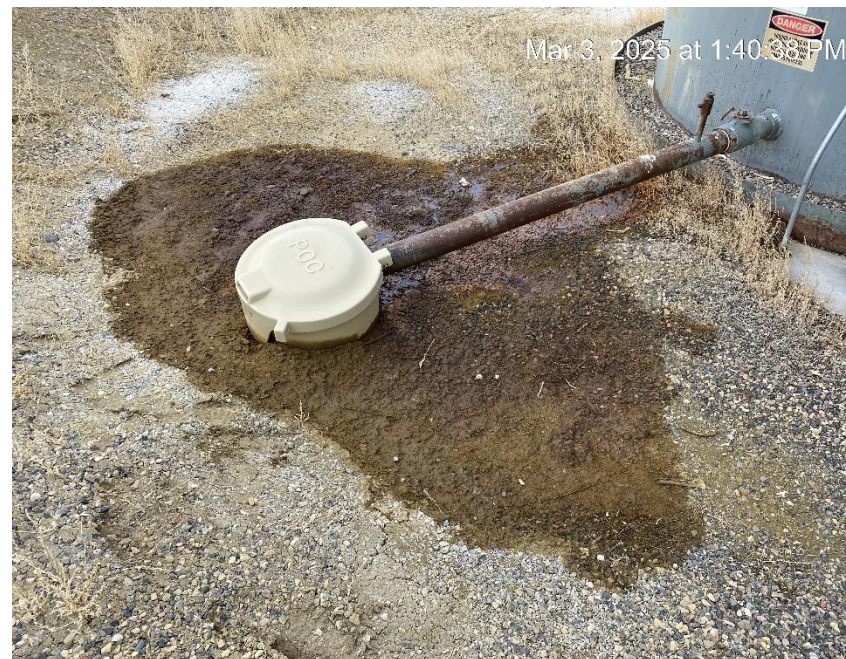
Leaking load line