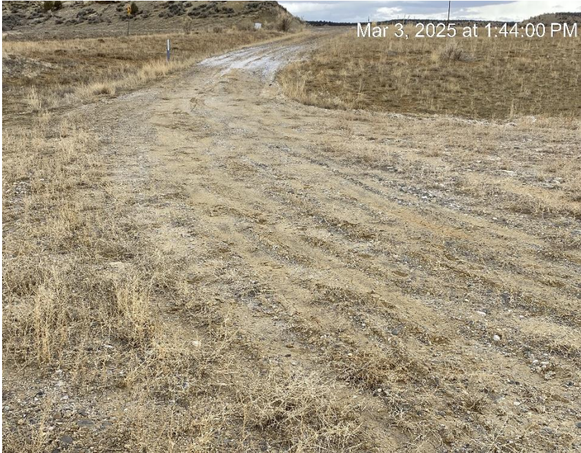
Sediment migration from access road on to location