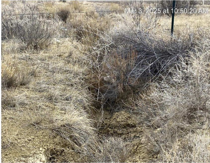
Erosion and check dam washed out