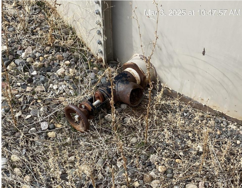
Open end tank valve