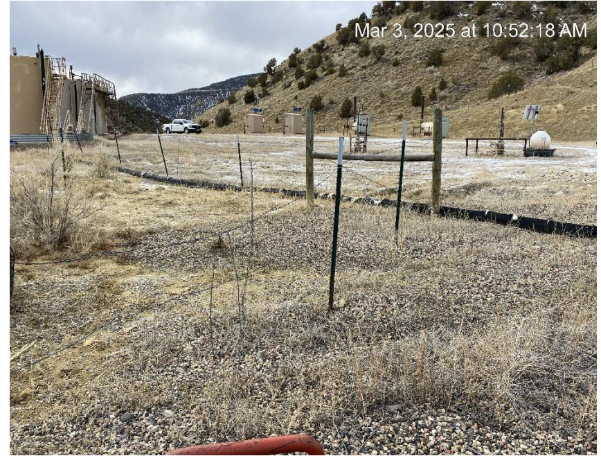
Location from Northeast corner