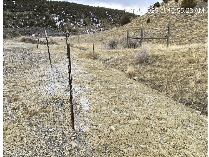
Washed out check dams