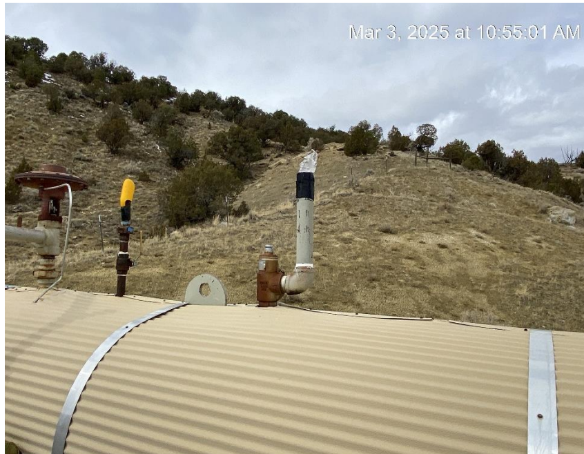
Inadequate riser protection