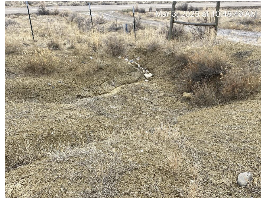
Gas calibration overdue