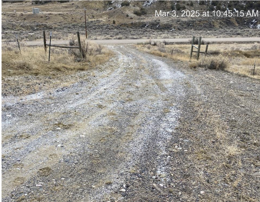
Access road to location