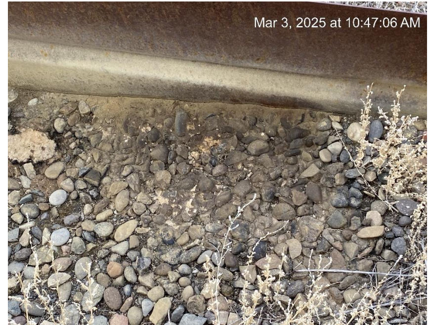
Oily waste and staining