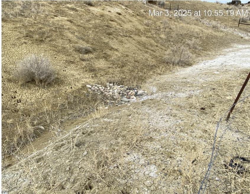
Washed out check dam