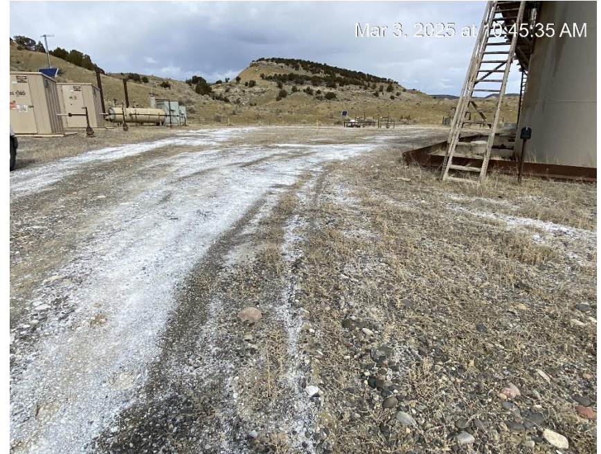
Location from Southeast corner entrance