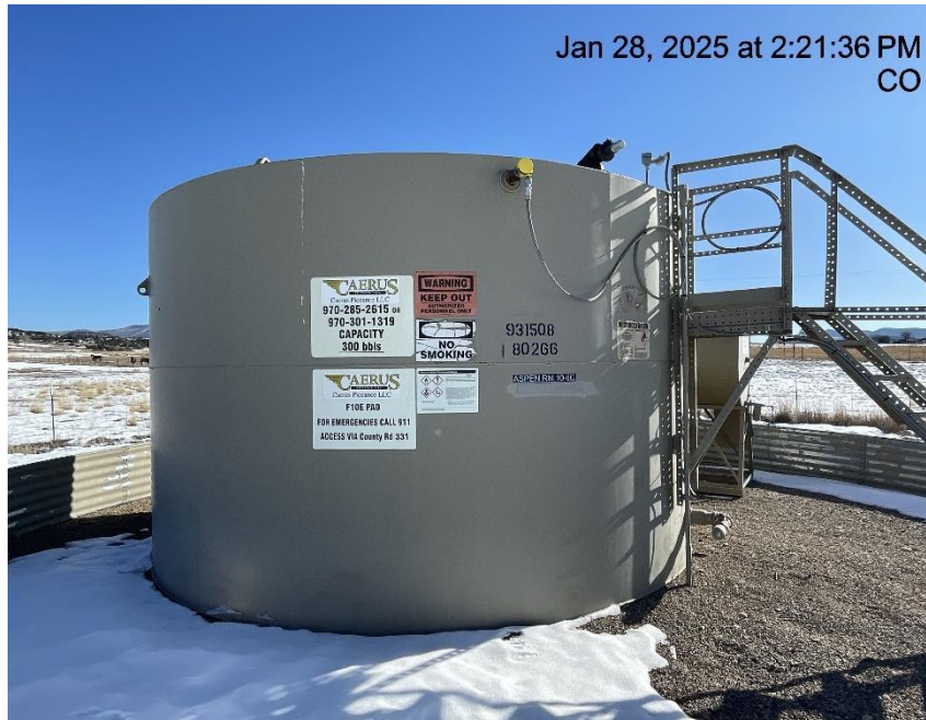
Photo # 1968 From inspection 708905613 conducted on 01/28/2025 Tank is disconnected & not in use/unused equipment