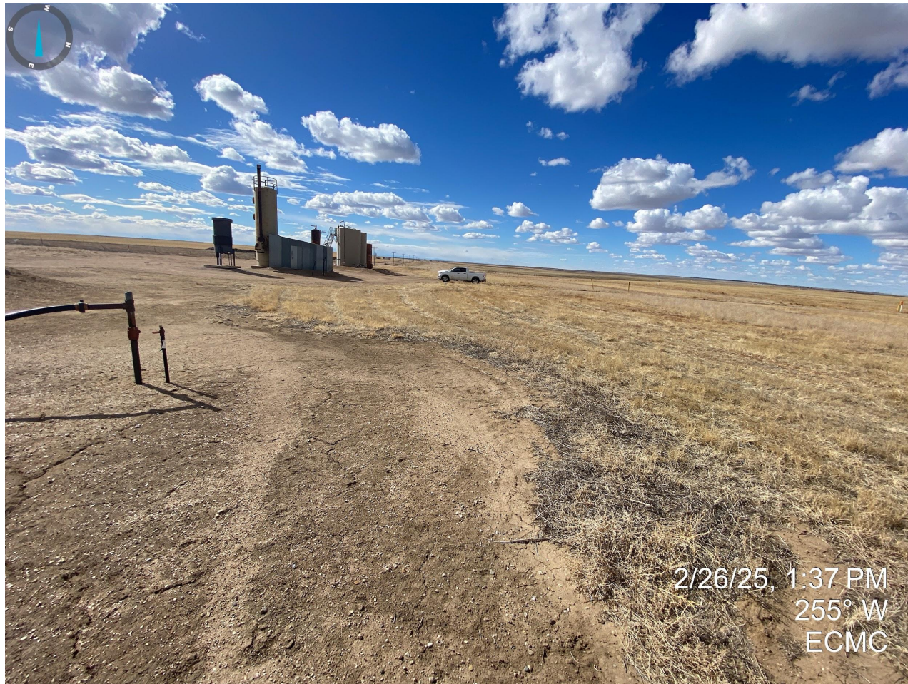
Photo 14. Eastern interim areas, near pit. See comments in Photo 11 for additional information.