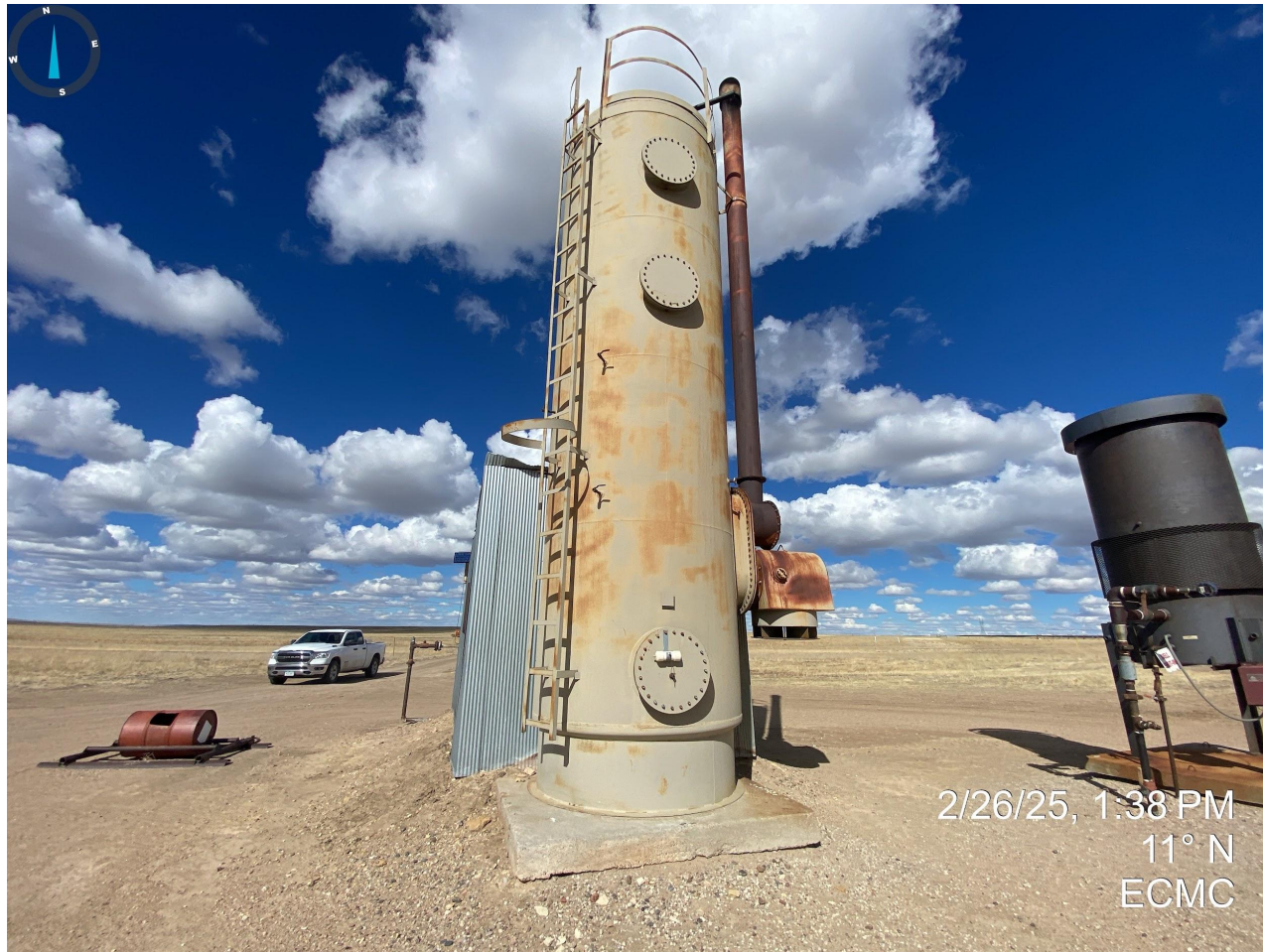
Photo 8. No NFPA placard at vertical heater treater.