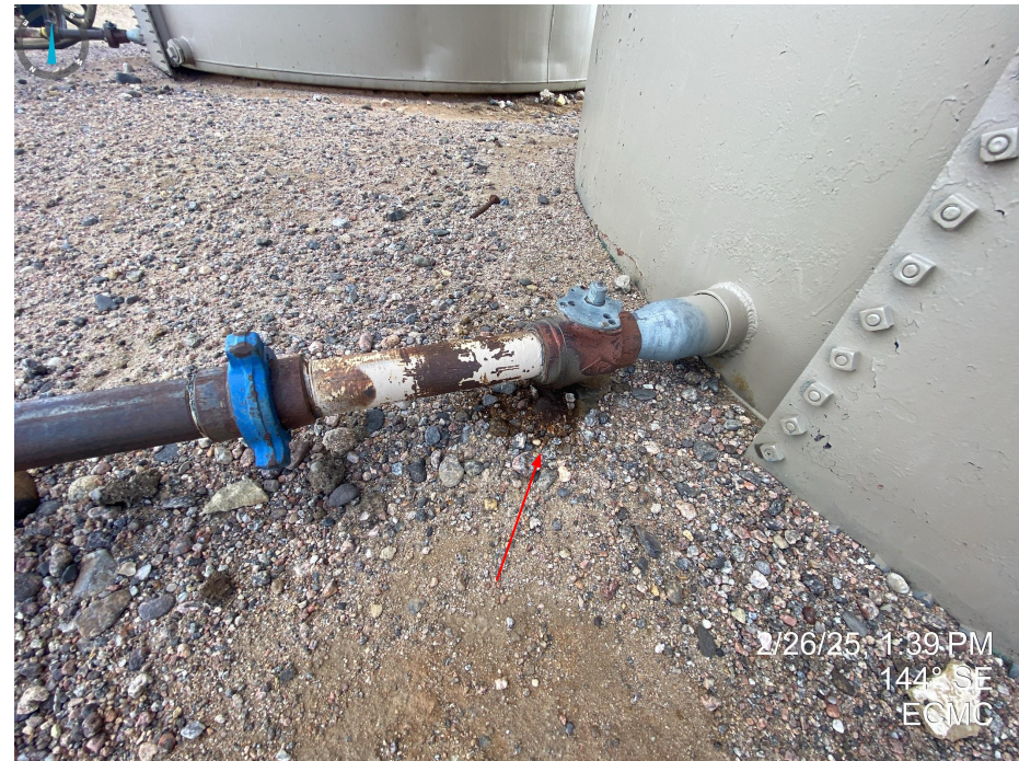
Photo 9 & 10. Stained soil and leaky valves at AST.