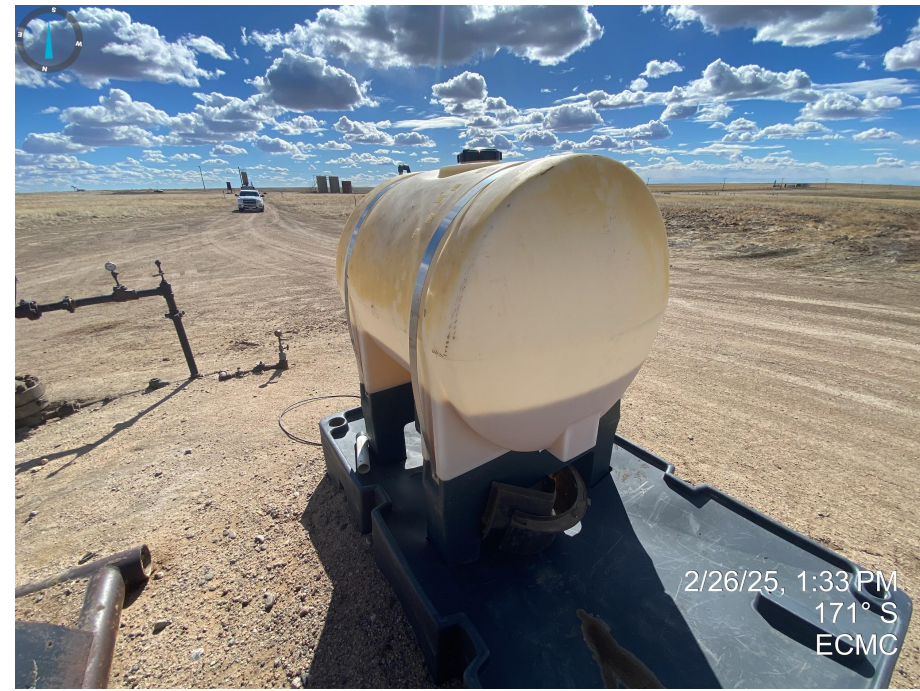
Photos 2 & 3. Tank labels not adequate at day tank.