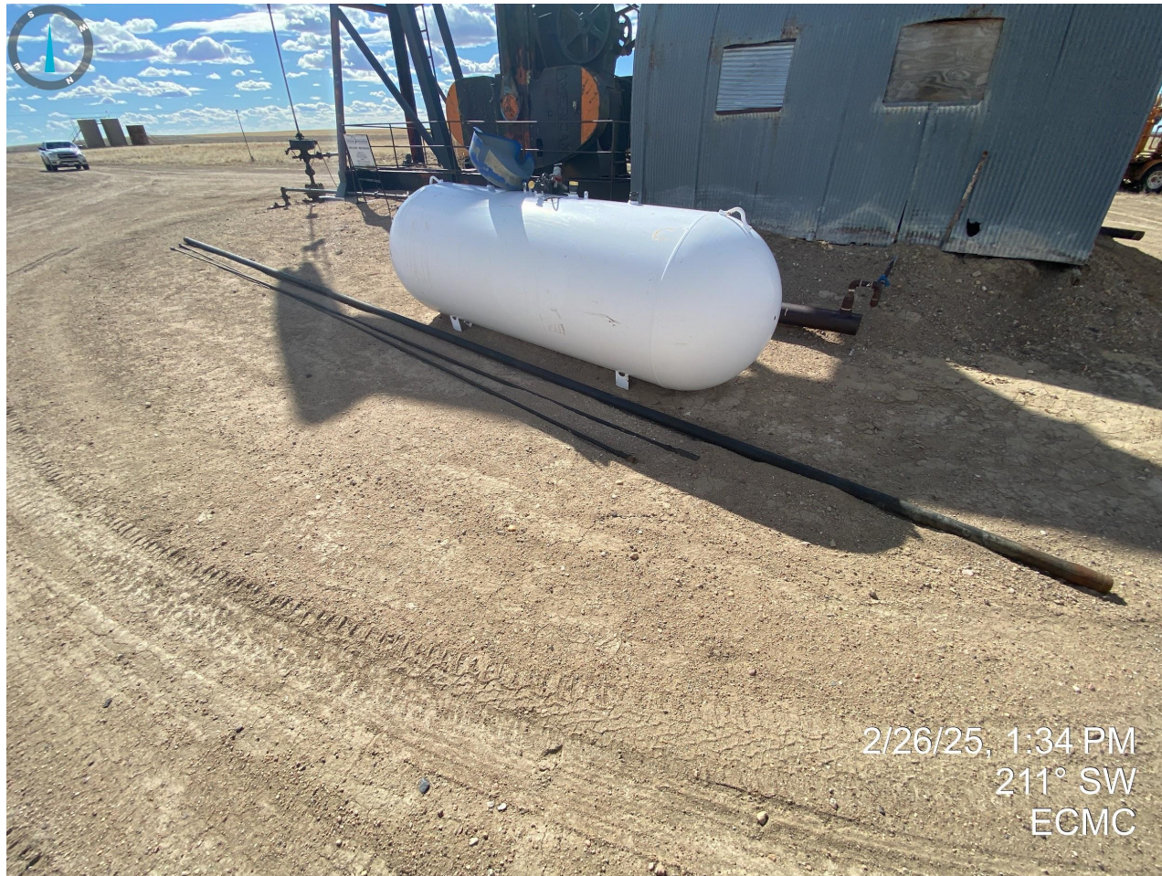
Photo 5. Unused equipment near pumpjack unit.