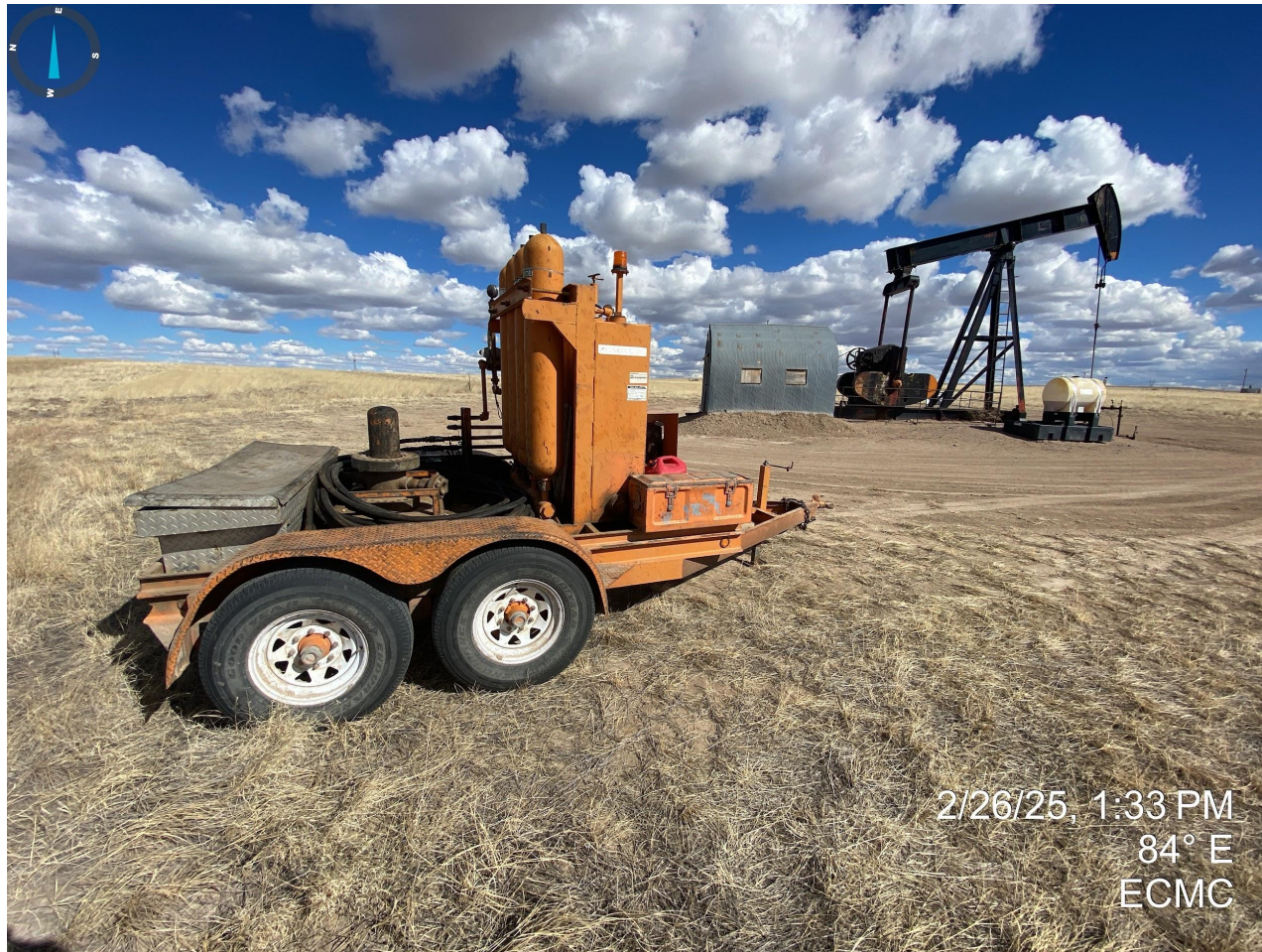
Photo 4. Unused equipment stored northwest of wellhead/pumpjack.