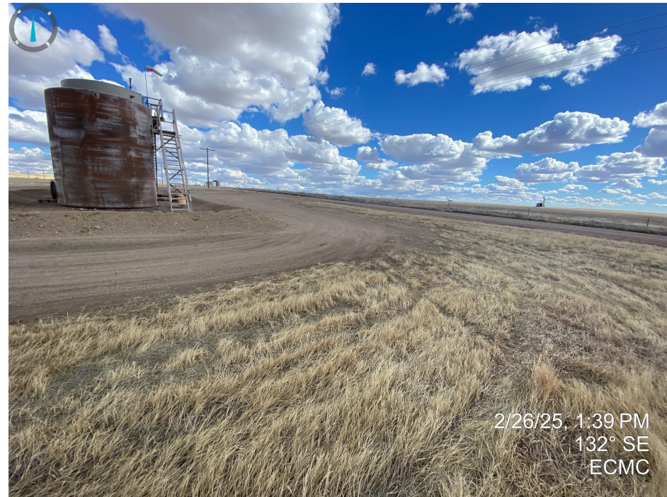
Photo 12 & 13. Western interim areas, near tank battery. See comments in Photo 11 for additional information.