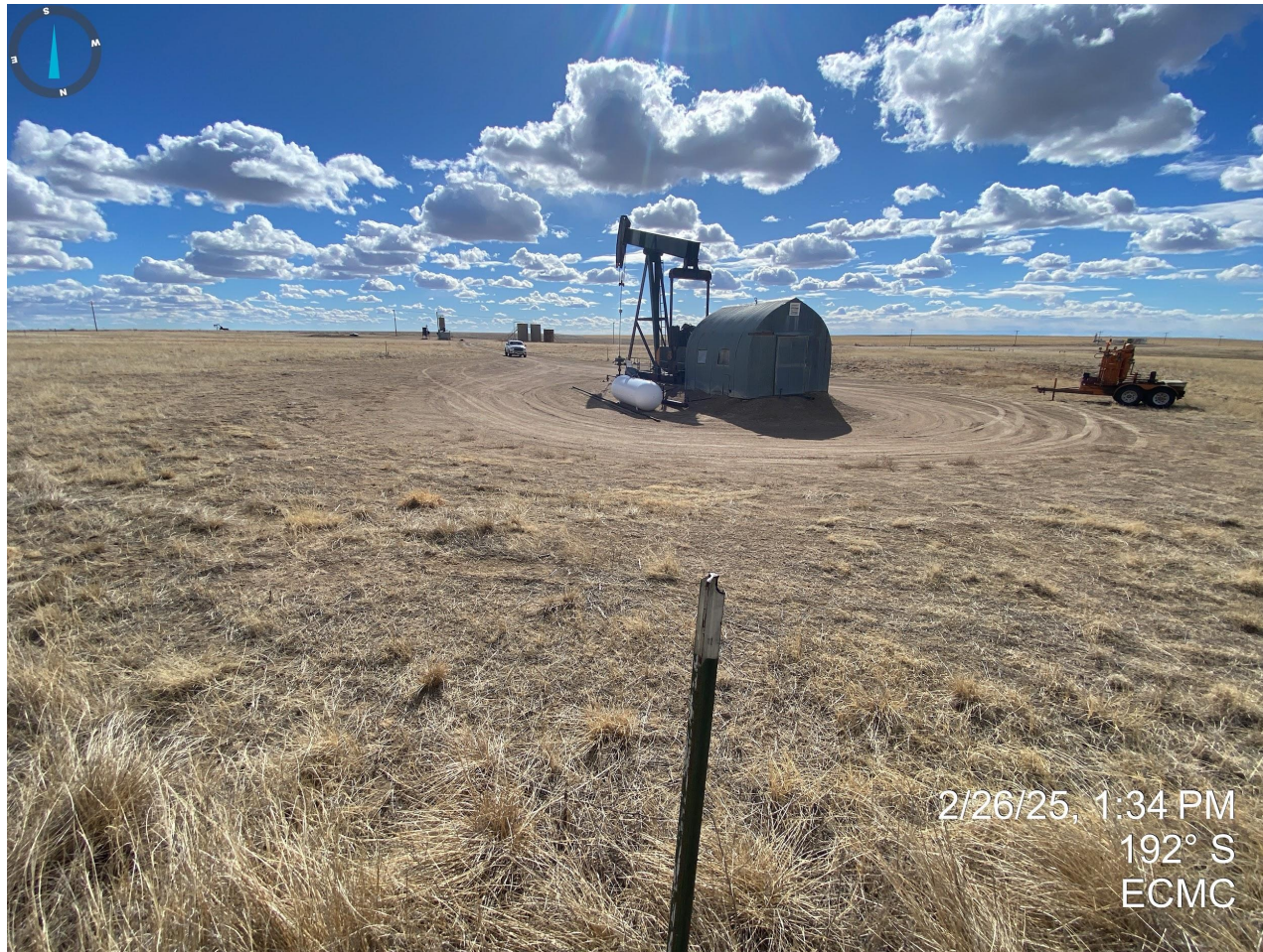
Photo 11. Northern interim areas, near well. Appears interim reclamation activities have been performed to reduce disturbance areas only needed for production operations. A vegetative assessment will be performed at a later date during the active growing season to verify interim reclamation regulations and standards and will therefore remain "In-Process".