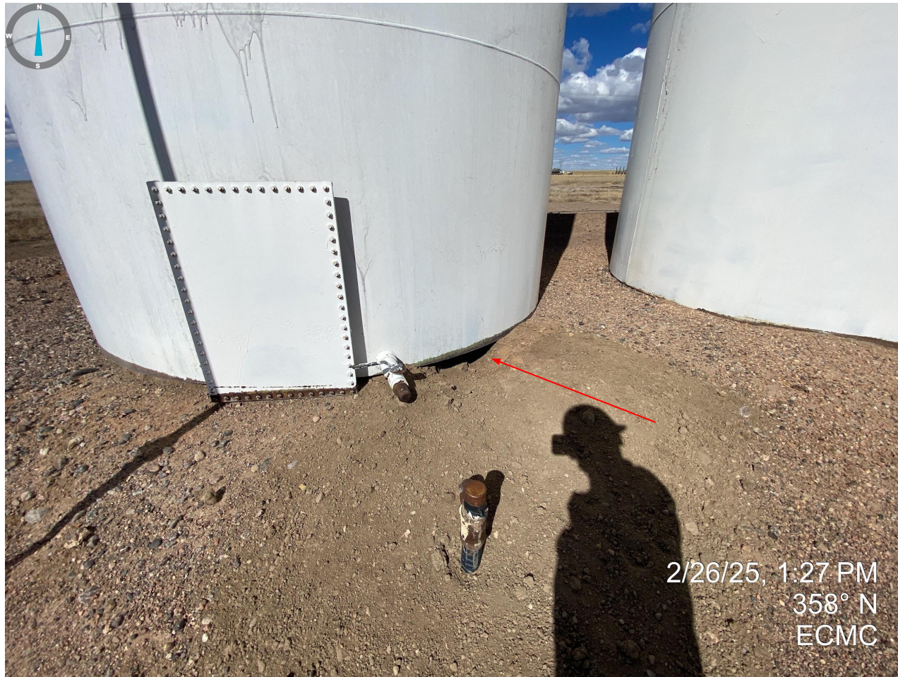
Photo 3. Animal burrow observed at AST.