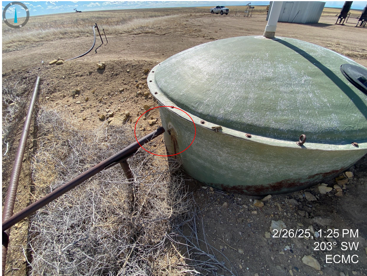
Photo 6. Fitting at partially buried vessel does not appear to be properly connected.