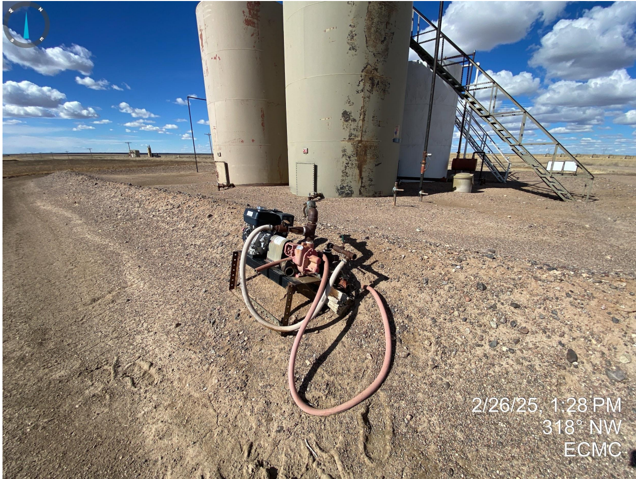
Photo 5. Unused equipment (motor/pump) observed on south side of tank battery.