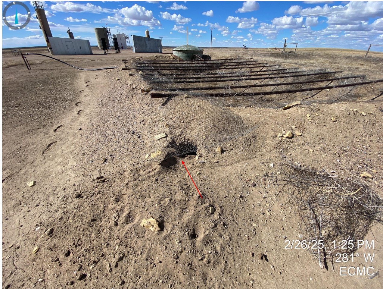
Photo 1. Animal burrow observed at pit berm.