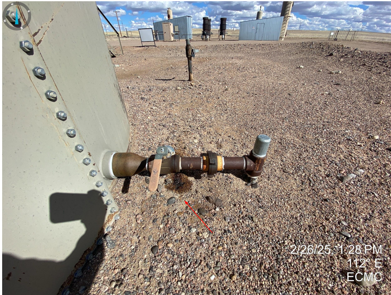
Photo 4. Stained soil and leaky valve at AST.