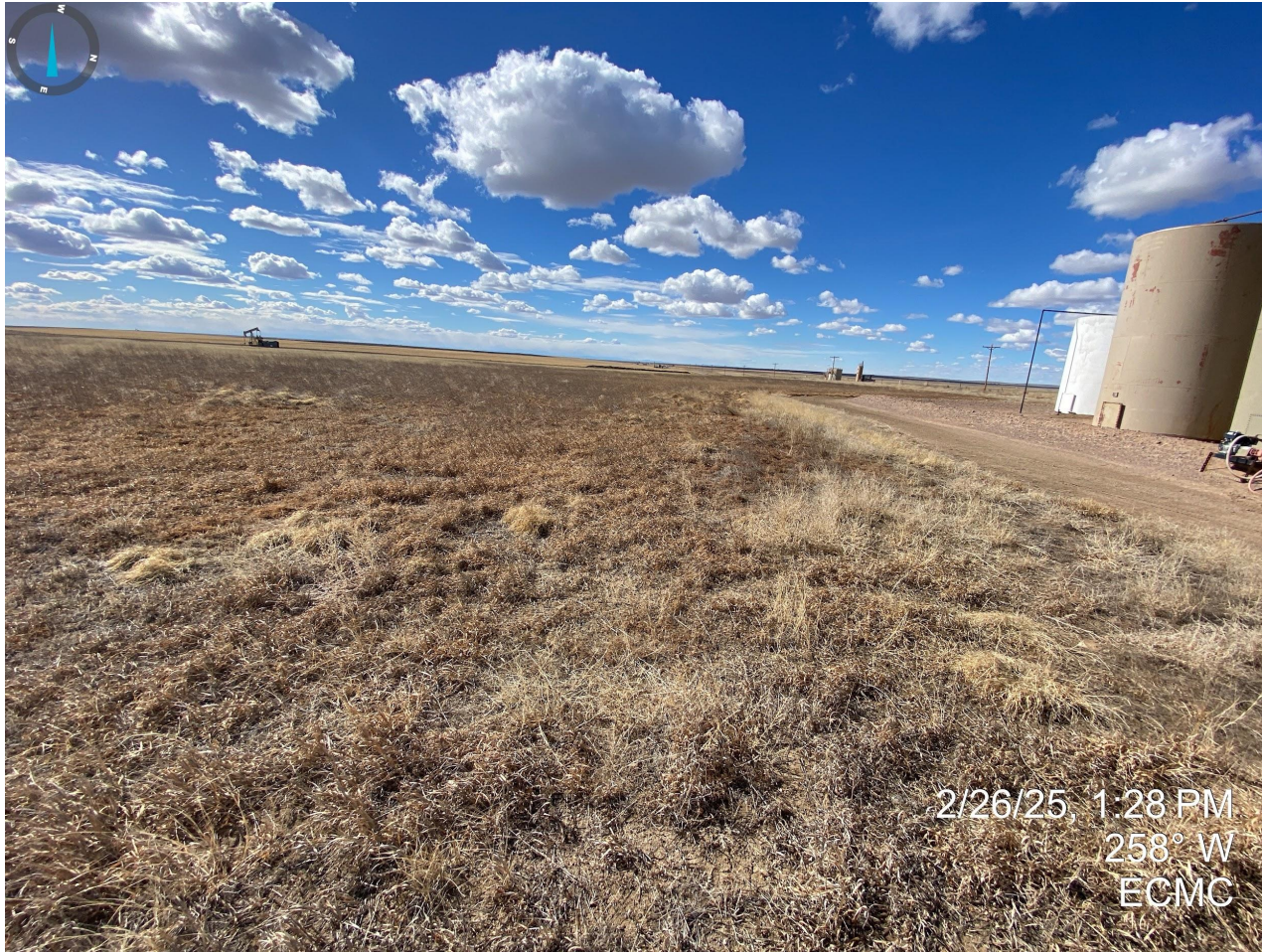
Photo 7. Southern interim areas. Appears interim reclamation activities have been performed to reduce disturbance areas only needed for production operations. A vegetative assessment will be performed at a later date during the active growing season to verify interim reclamation regulations and standards and will therefore remain "In-Process".