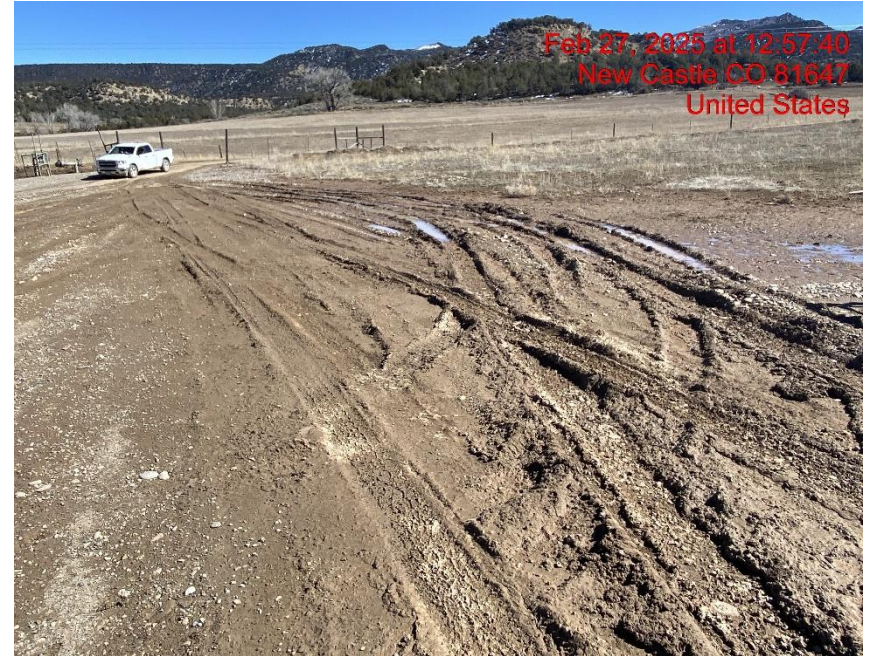
Lack of Stabilization – Photo #06901