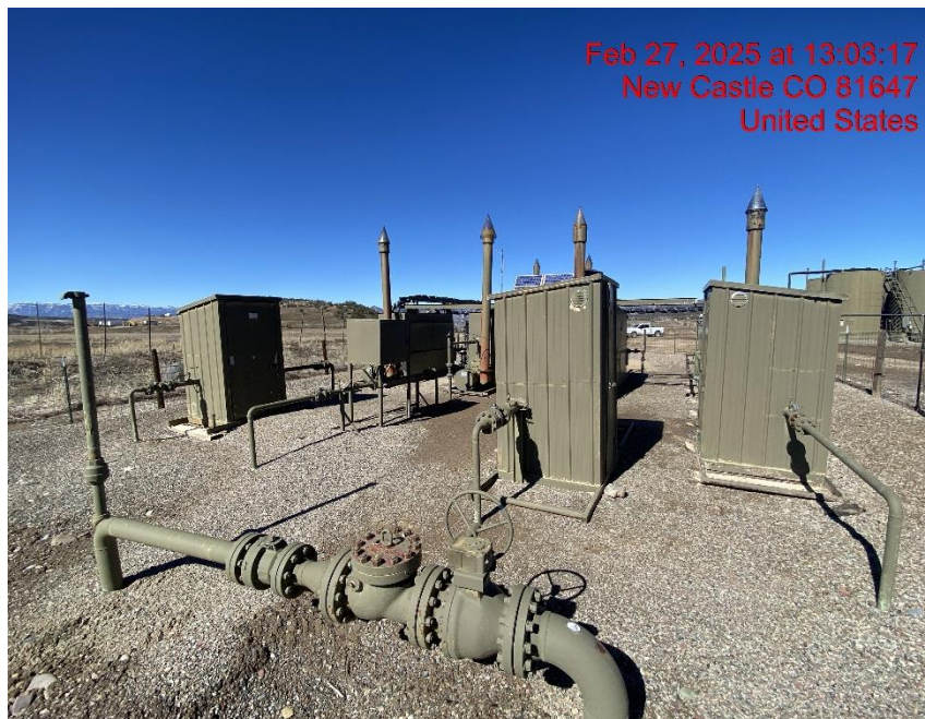
Location – Photo #06908