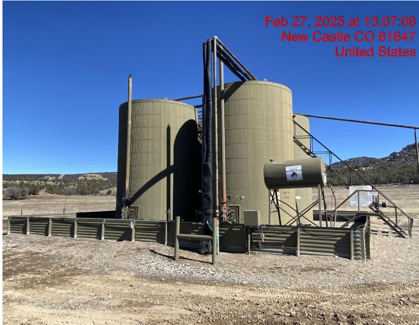
Location – Photo #06914