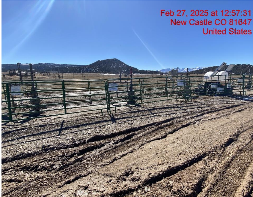
Location – Photo #06900