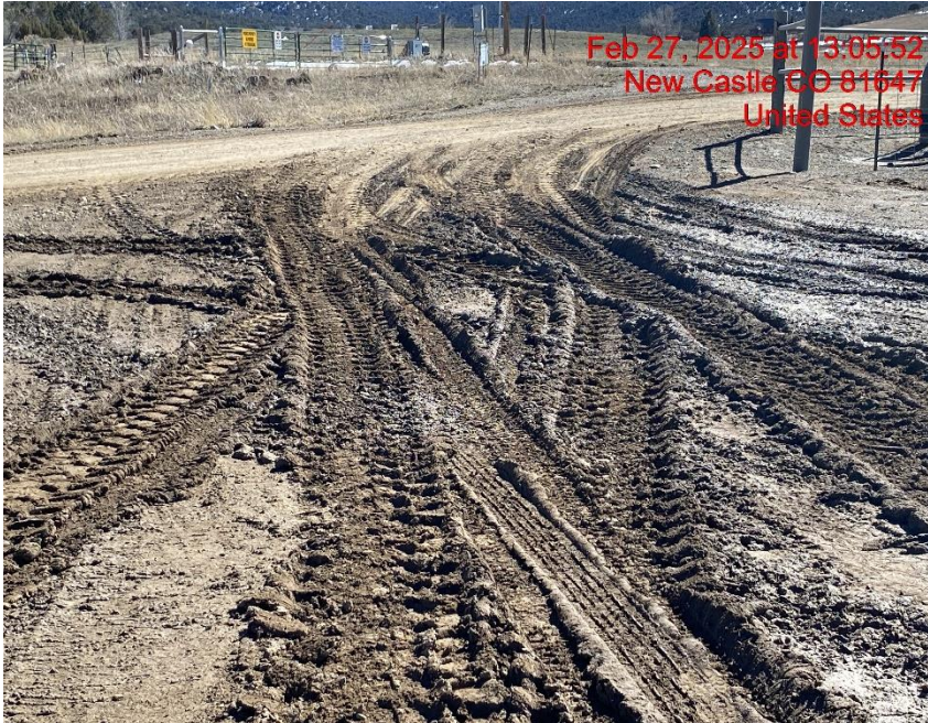
Lack of Stabilization/Insufficient Tracking BMPs – Photo #06912