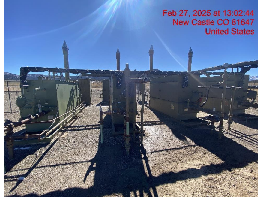
Location – Photo #06907