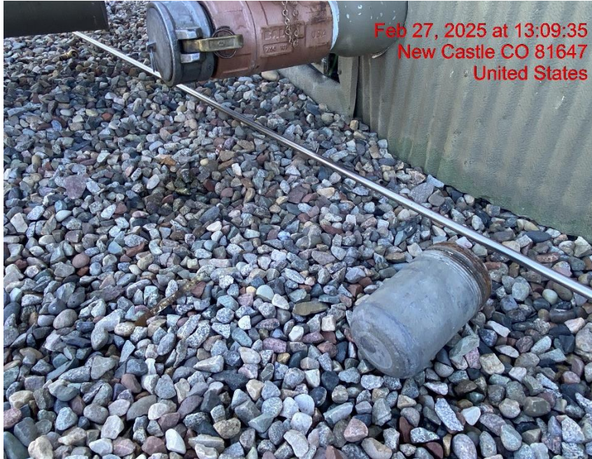
Stored Supplies – Photo #06922