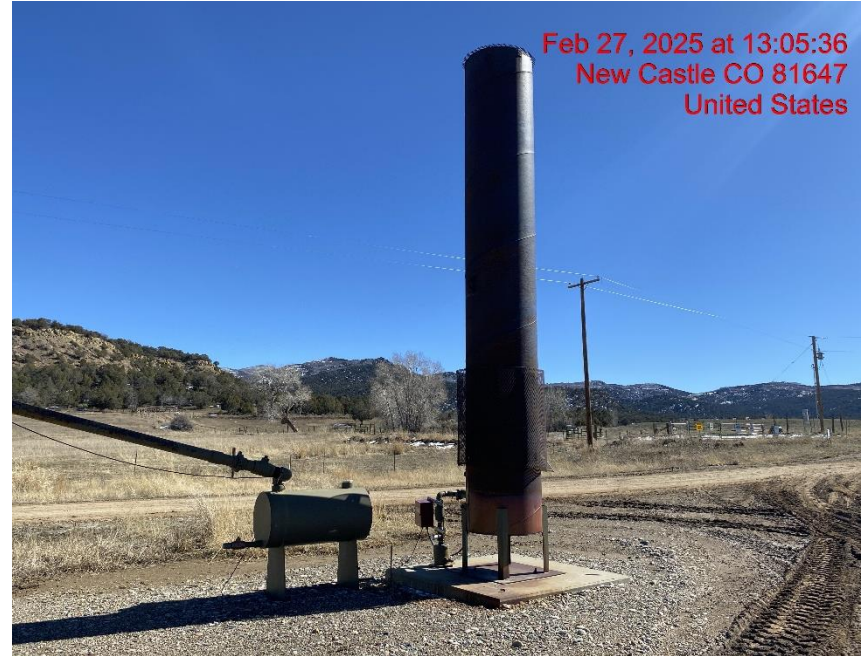
Location – Photo #06911