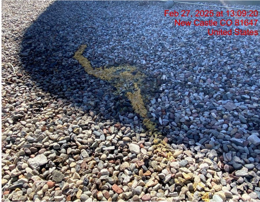
Staining/Oily Waste – Photo #06920