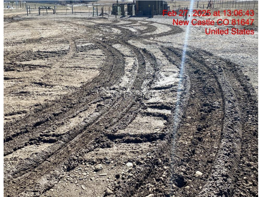
Lack of Stabilization – Photo #06913