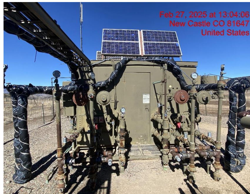
Location – Photo #06909