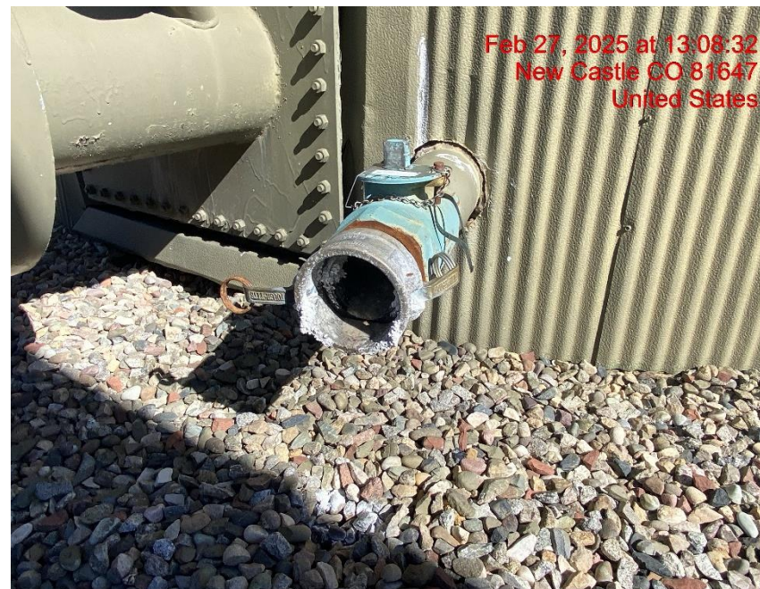
Open-Ended Line on Storage Tank – Photo #06918