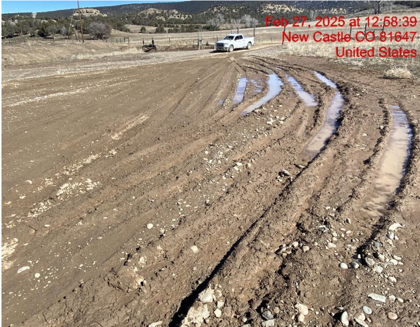
Lack of Stabilization – Photo #06902