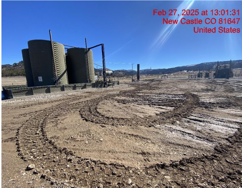
Location Overview – Photo #06906