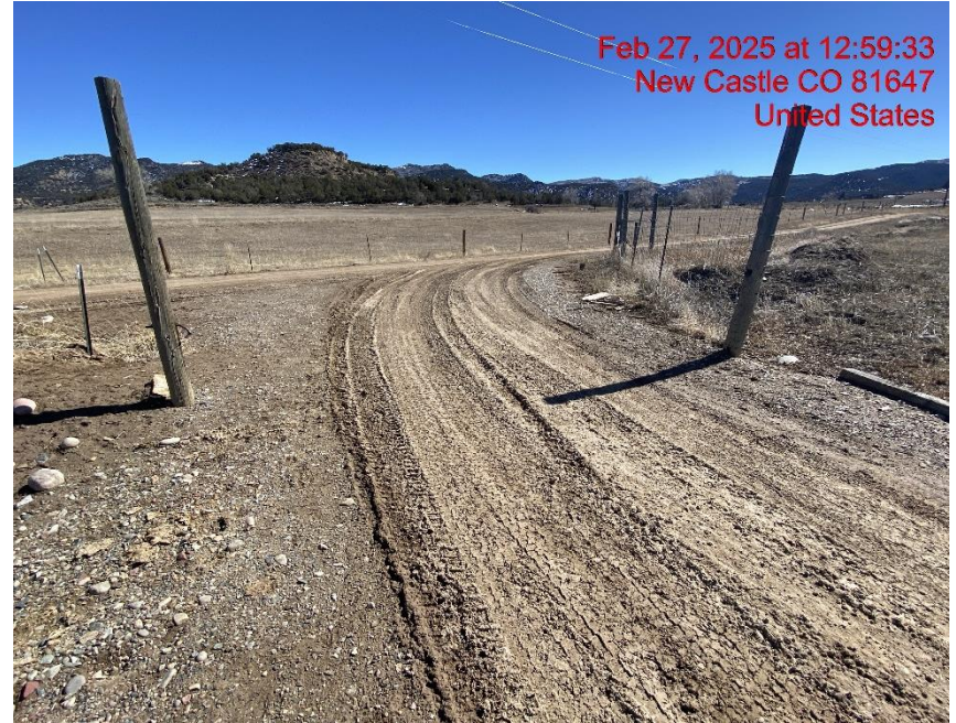
Insufficient Tracking BMPs – Photo #06903