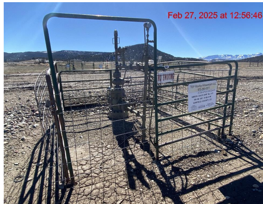
Location Overview – Photo #06898

Feb 27, 2025 at 12:56:03 New Castle CO 81647 United States