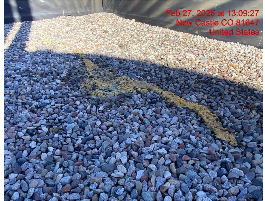
Staining/Oily Waste – Photo #06921