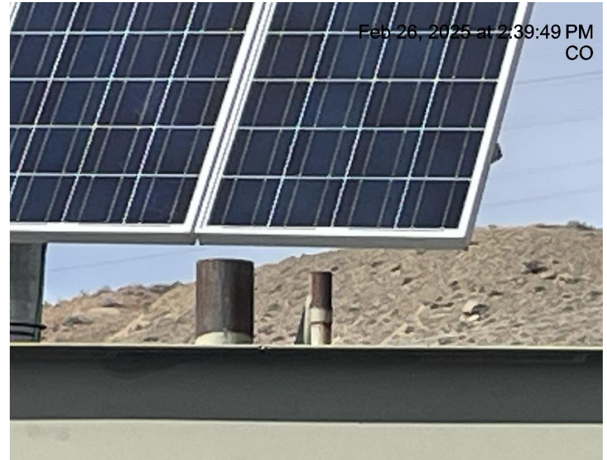
Photo # 9719 PRV vent line does not comply with CECMC pressure safety device rules