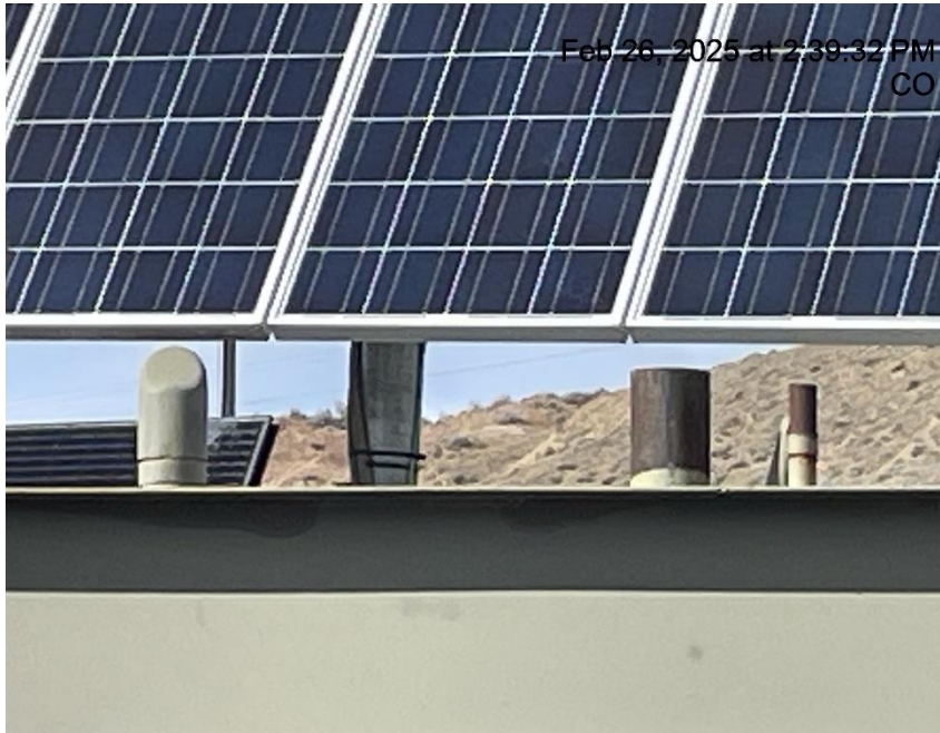
Photo # 9718 PRV vent line does not comply with CECMC pressure safety device rules