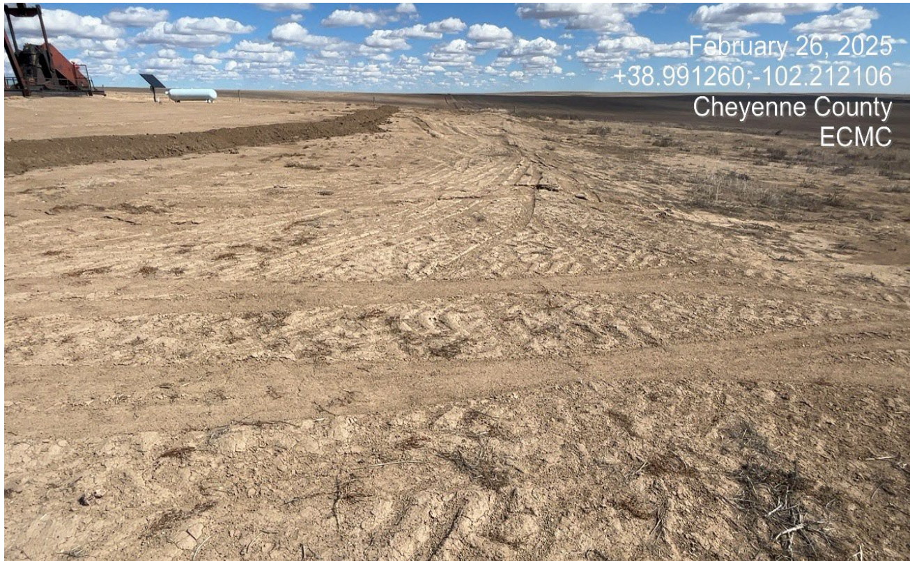
Photo 2. Facing east at the south side of the location. This area is not reclaimed or stabilized.