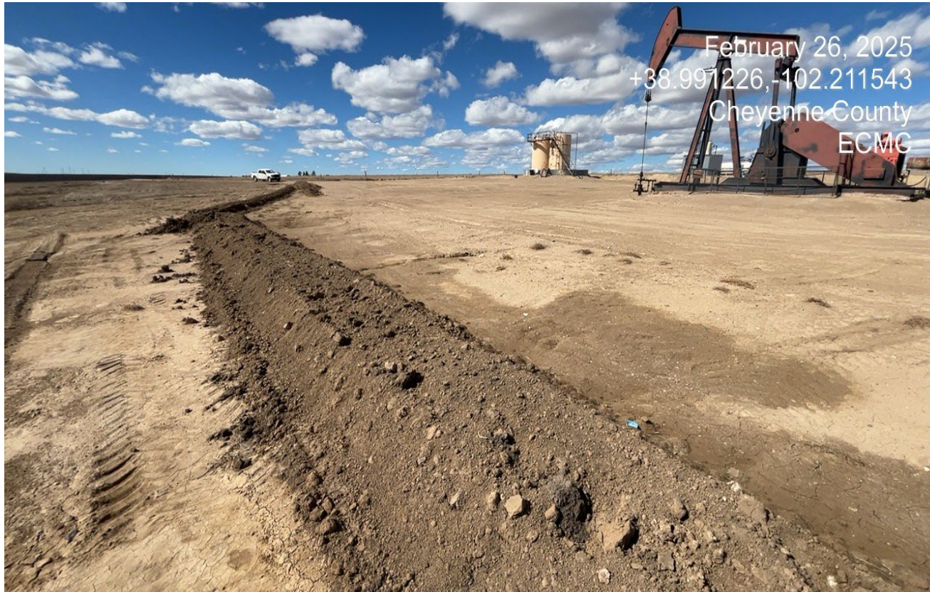
Photo 4. There is a soil berm along the south side of the location. It is unknown if this material is being used as a berm or for reclamation. A berm must be compacted and stabilized and stormwater will still need a route to take with BMP's such as a sediment trap or rock rip/rap outlet.