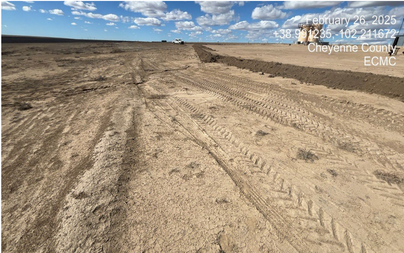
Photo 3. There is erosion along the south side of the location and soils are not stabilized.