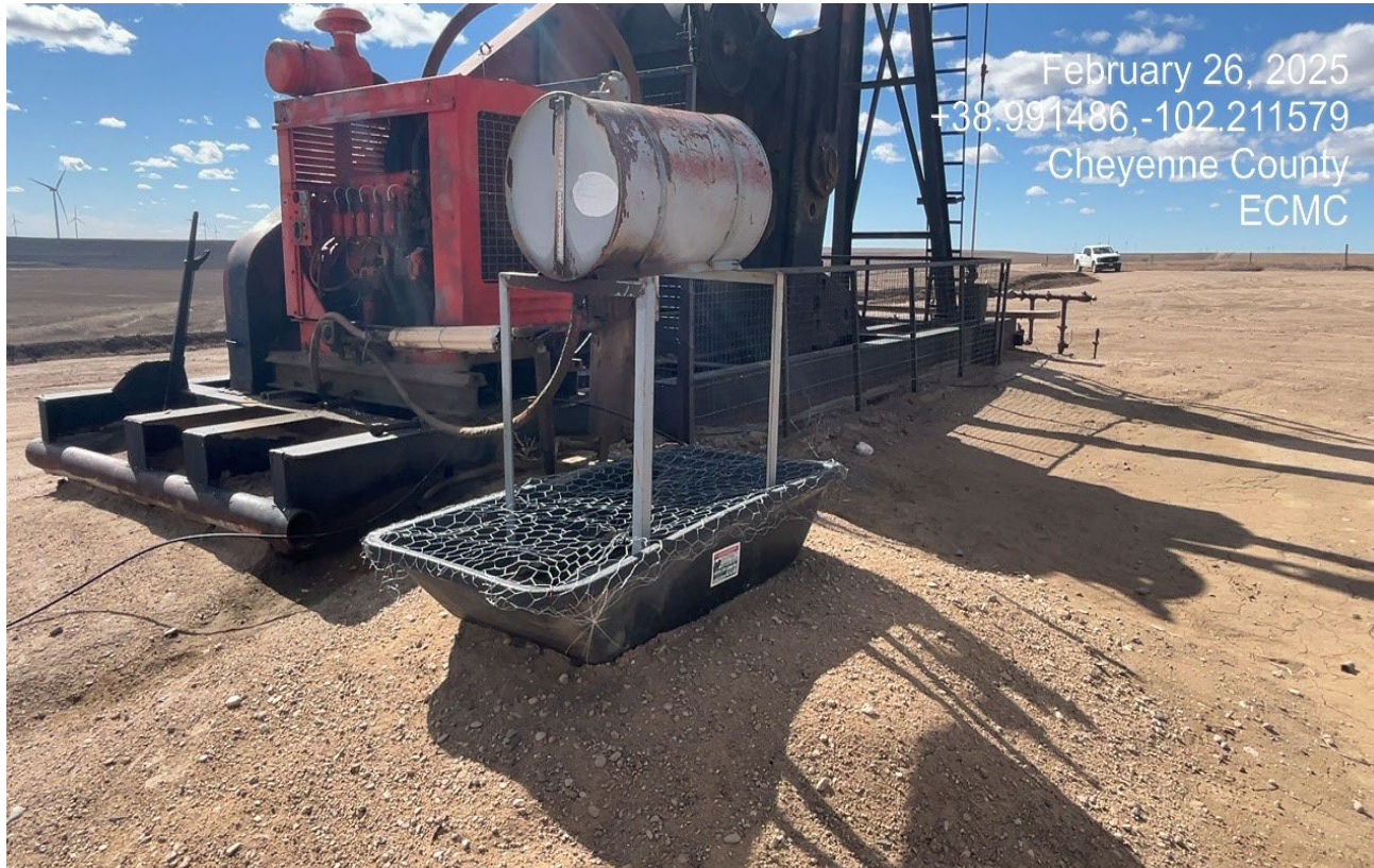
Photo 5. The containment has woven wire for wildlife protections.