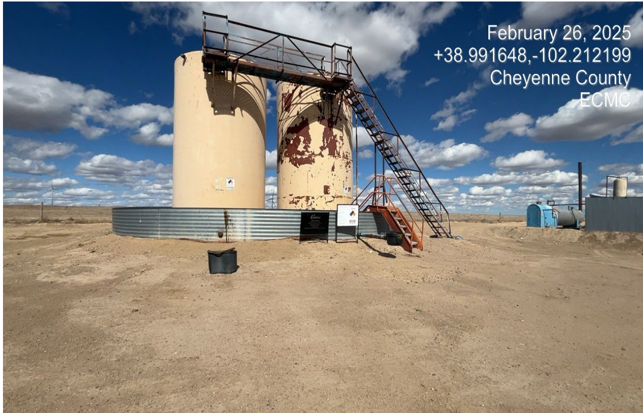
Photo 6. Facing toward the tank battery.