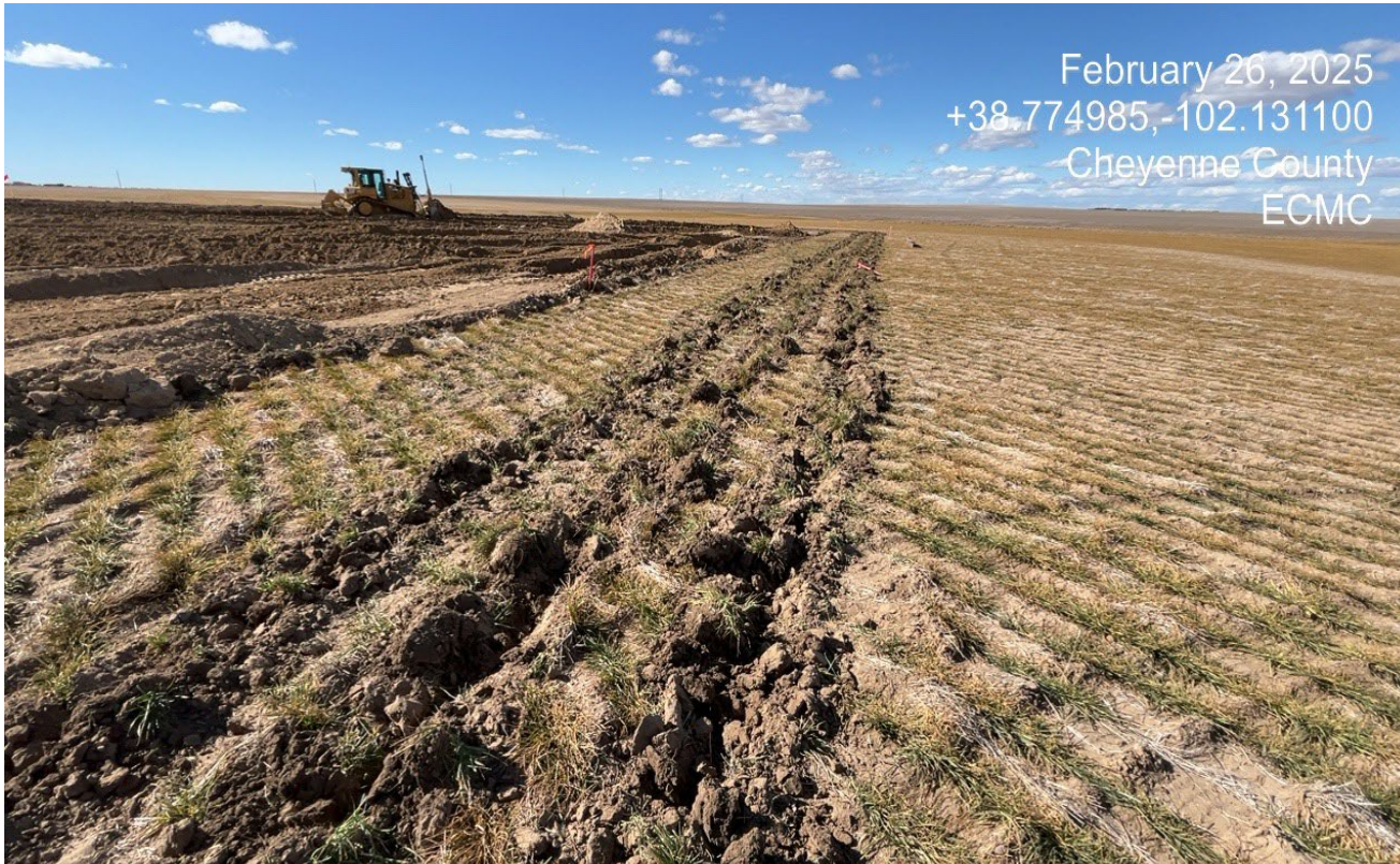
Photo 4. Facing along the east side of the location. Surface roughening has occurred around the perimeter of the location.