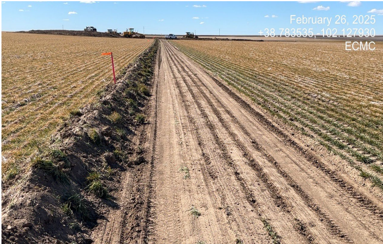
Photo 2. Facing east along the access road. Additional topsoil will need to be salvaged along the road.