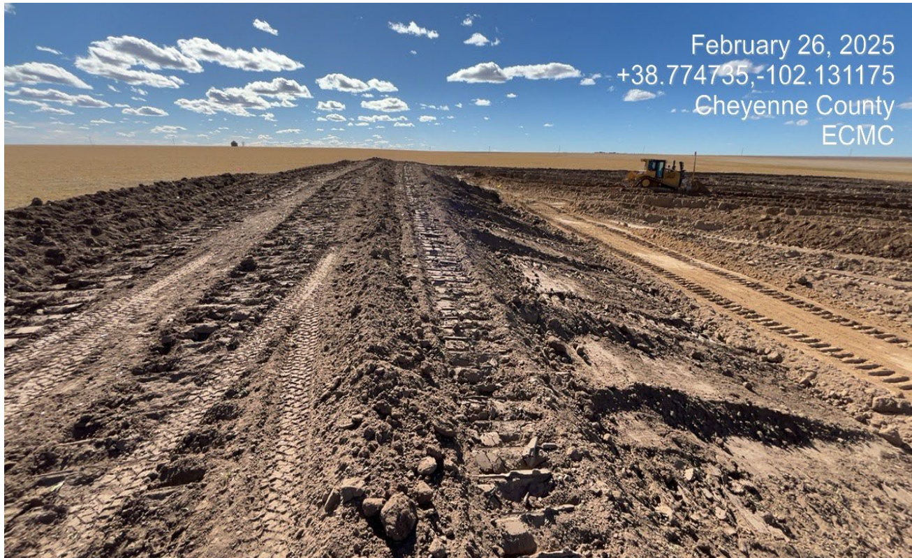
Photo 5. Facing southwest along the topsoil pile which has been segregated and stored at the south side of the location.