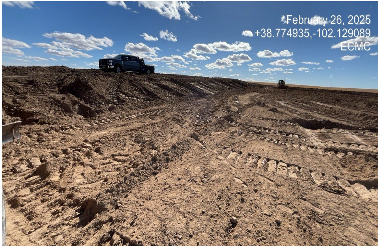
Photo 3. Facing southwest toward the topsoil pile which has been segregated and stored at the south side of the location.