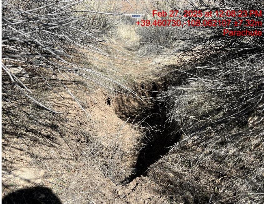
Photo # 6059 Subsidence in ditch/ditch needs maintenance on SE side of location, additionally is a wildlife hazard/personnel safety hazard