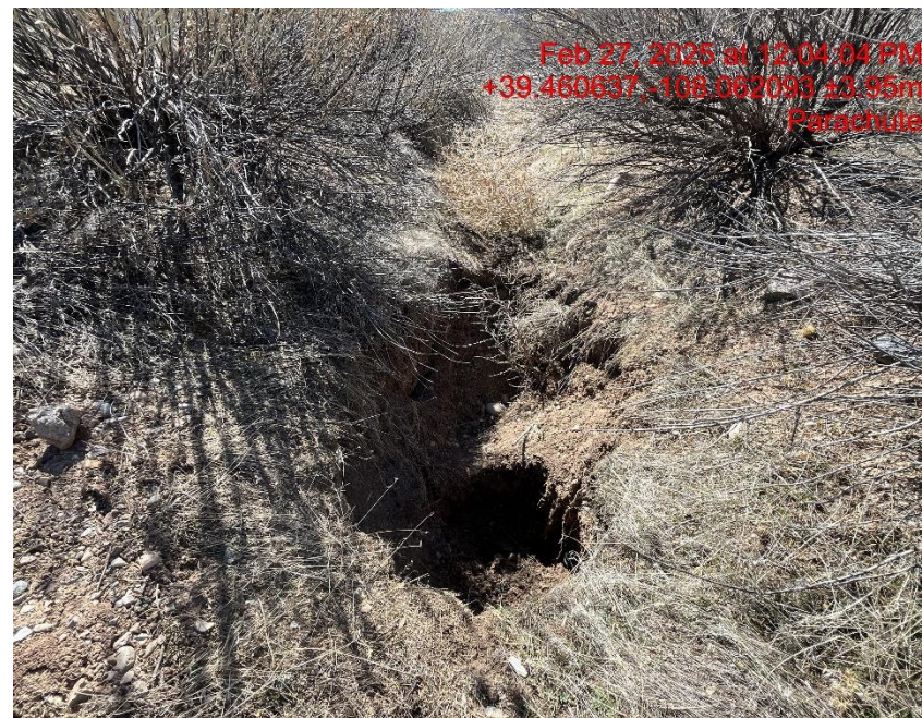
Photo # 6055 Subsidence in ditch/ditch needs maintenance on SE side of location, additionally is a wildlife hazard/personnel safety hazard