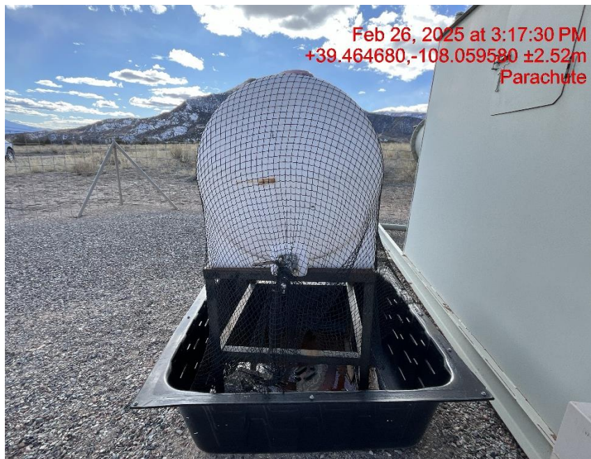
Photo # 5948 Wildlife protection for chemical containment needs maintenance/netting is damaged and open to wildlife