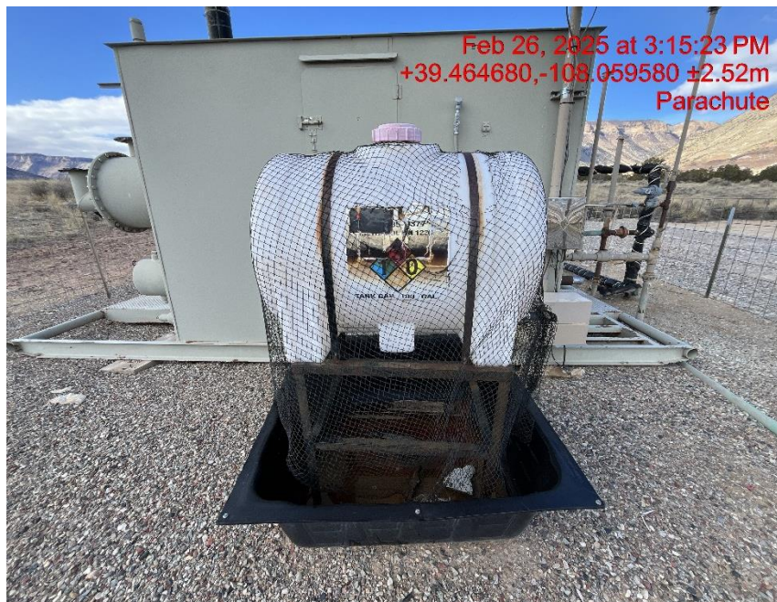
Photo # 5944 Tank lacks required labeling/do not comply with CECMC rules