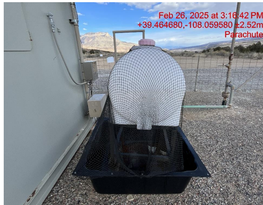
Photo # 5947 Wildlife protection for chemical containment needs maintenance/netting is damaged and open to wildlife