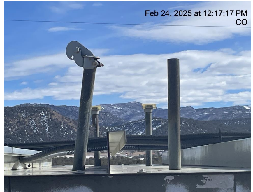
Photo # 8227 PRV vent line does not comply with CECMC pressure safety device rules