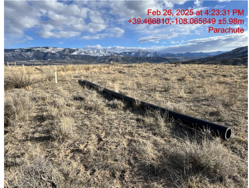
Photo # 6017 Open ended poly pipe/wildlife hazard 0.1 miles NW of location off lease road intersection