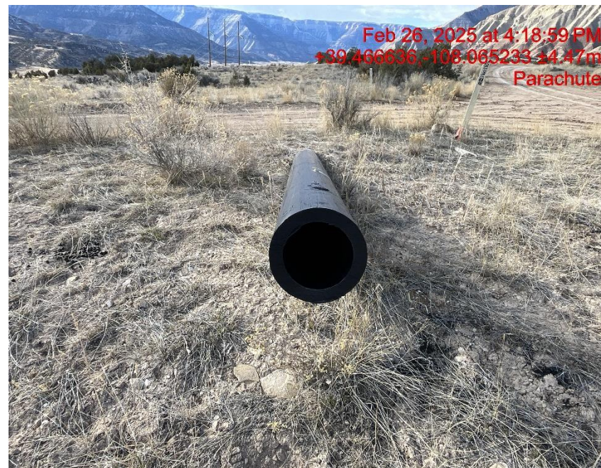
Photo # 6008 Open ended poly pipe/wildlife hazard 0.1 miles NW of location off lease road intersection