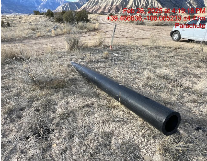
Photo # 6010 Open ended poly pipe/wildlife hazard 0.1 miles NW of location off lease road intersection