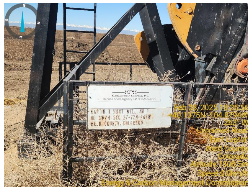
Photo 11 Wellhead