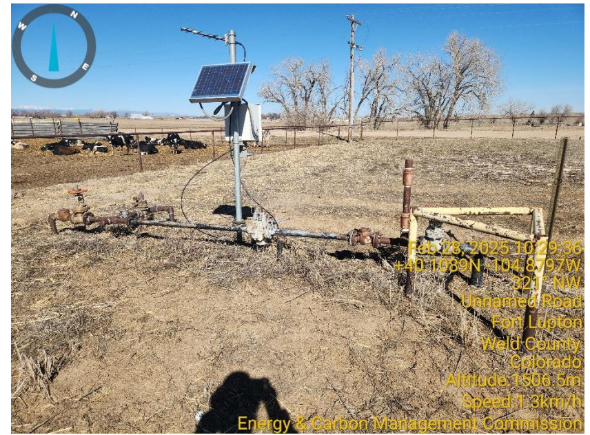
Photo 1 Dead vegetation lying around Location