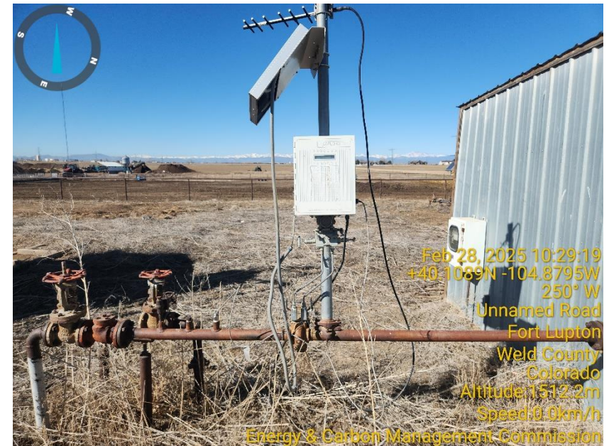
Photo 3 Dead vegetation around Vertical Separator.