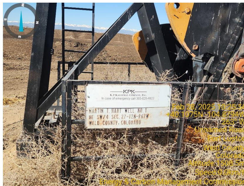
Photo 13 Dead vegetation around the ancillary equipment.