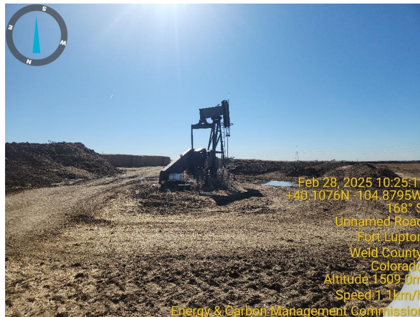
Photo 9 Flow line manifold dead vegetation throughout location.