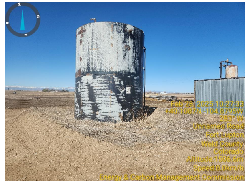
Photo 7 Tank battery no signage, berms need work.