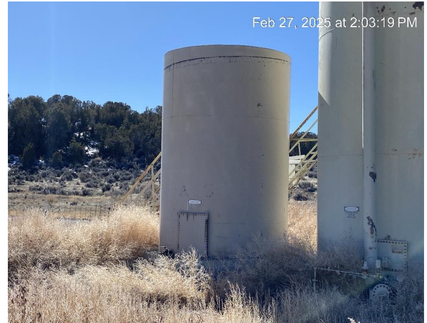
Disconnected and not in use