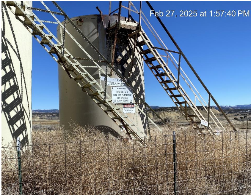
Disconnected and not in use