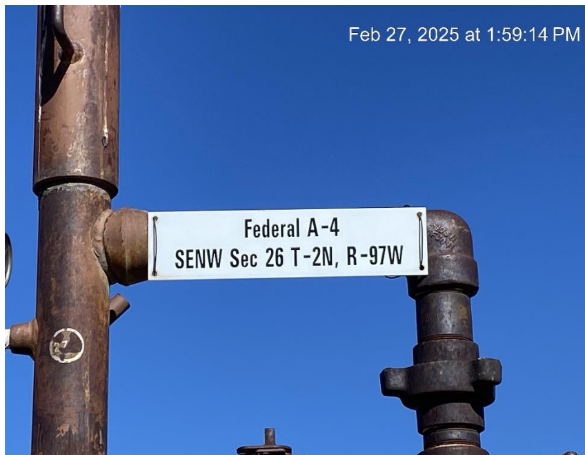
Missing required information