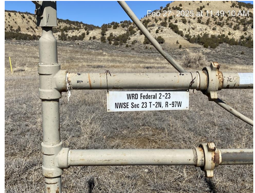
Missing required information