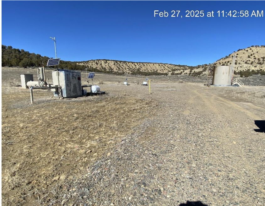
Location from Southeast entrance