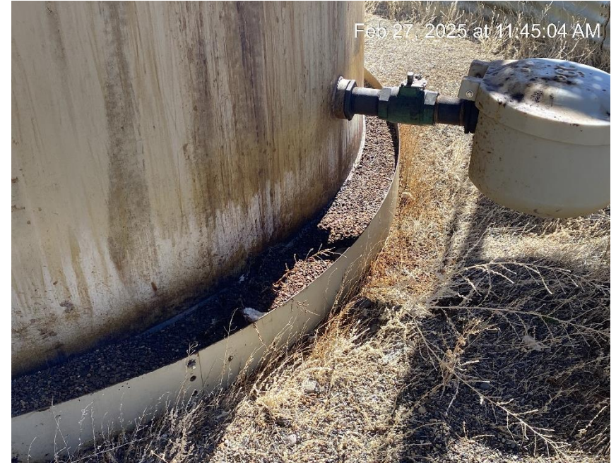
Oily waste and staining