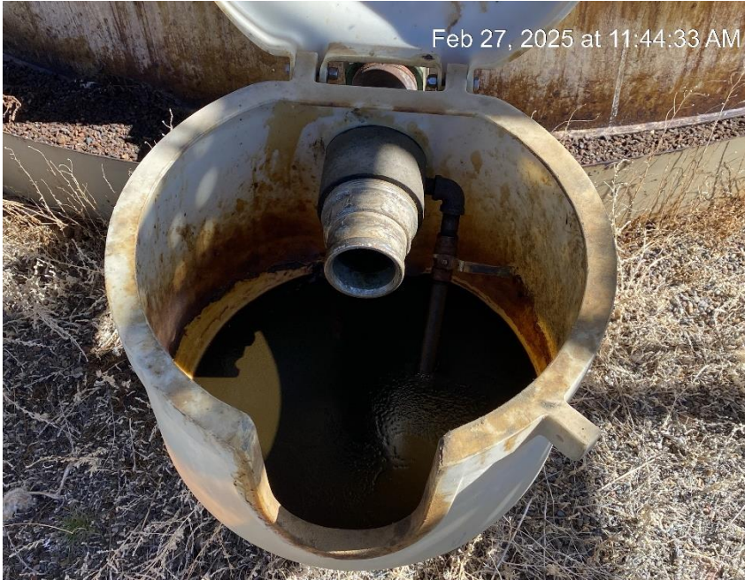
Open end load line