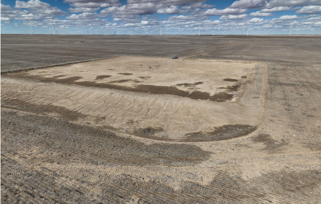
Photo 7. Drone aerial photo facing northwest toward the location. Interim reclamation has not been completed.