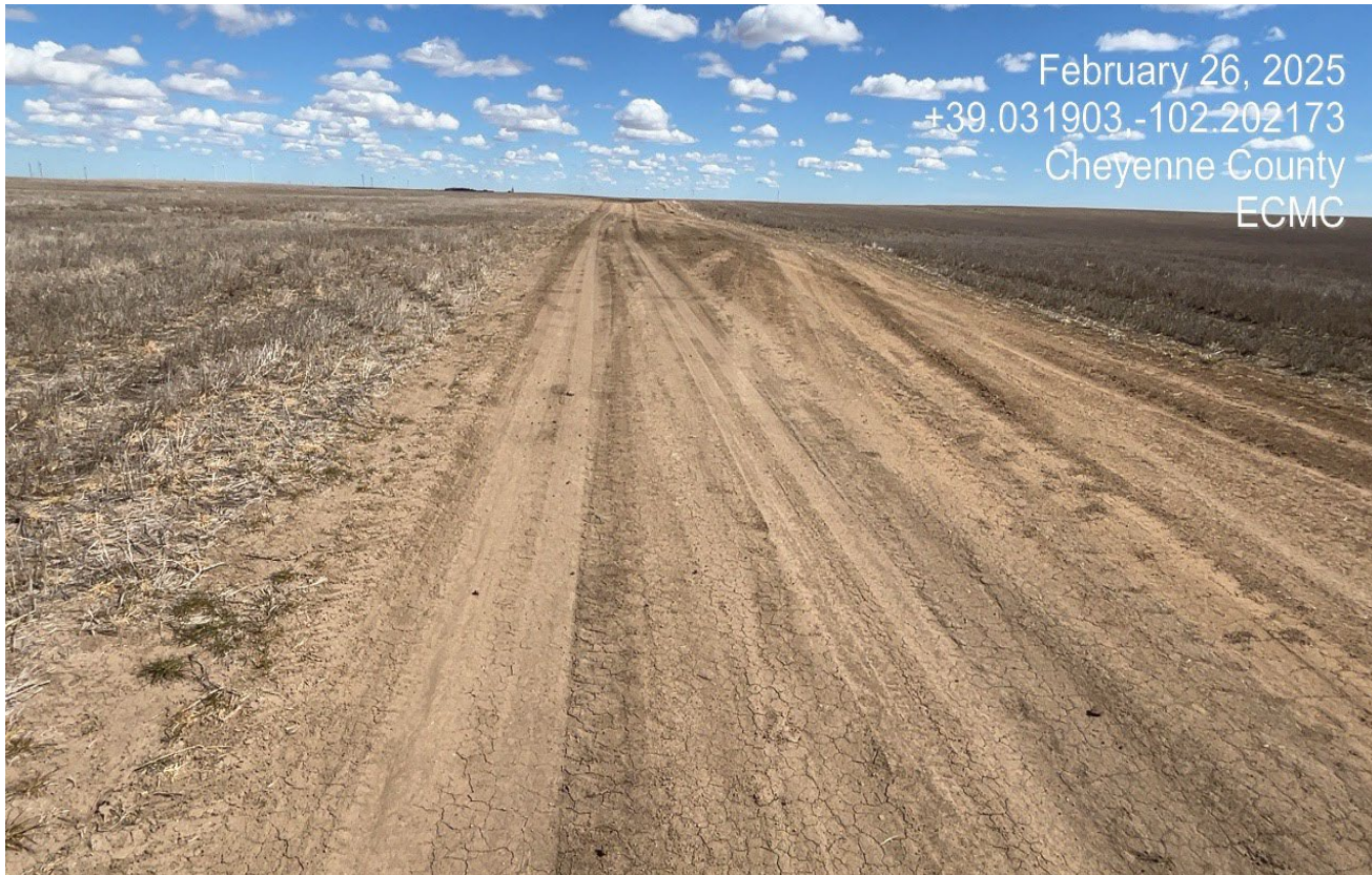
Photo 1. Facing east along the access road. Vehicles are avoiding the eroded area of the road causing unnecessary disturbance. The road needs to be repaired and stabilized.