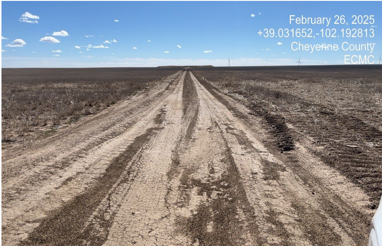
Photo 2. Facing south along the access road. The access road needs to be reduced in size by reclaiming and decompacting soils.