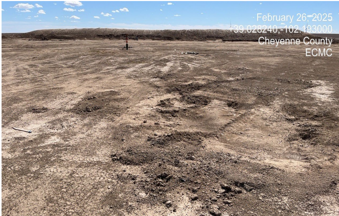
Photo 3. Facing south toward the wellsite.