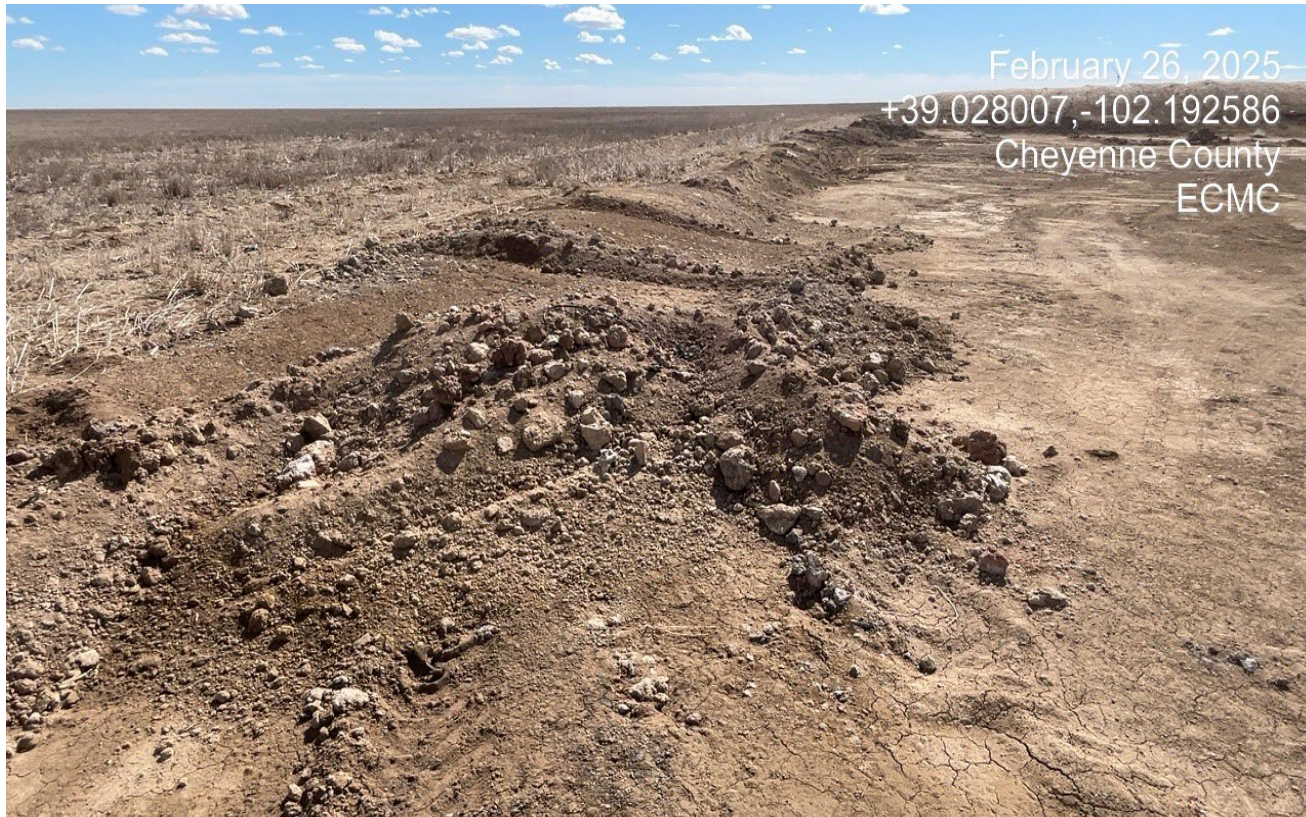
Photo 5. It appears some of the grey cuttings previously observed along the eastern side were removed. There appear to be some discolored soils that remain.