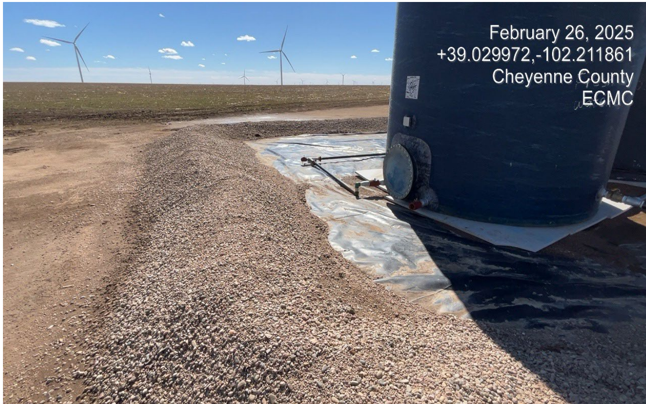
Photo 3. There are animal borrows in the side of the berm. The earthen berm is not designed to resist degradation from erosion.