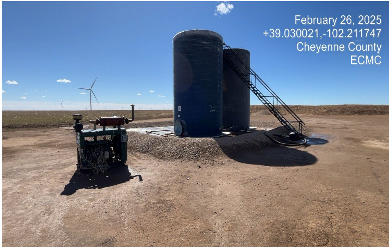
Photo 3. Facing toward the tank battery. The earthen berm is not designed to resist degradation from erosion.