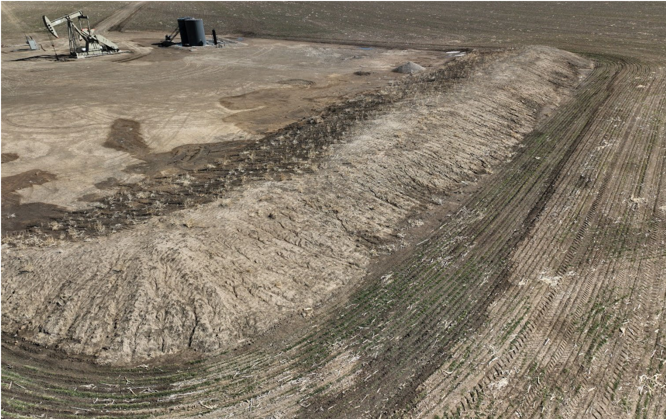
Photo 7. Drone aerial photo facing southeast toward the topsoil pile. There is erosion occurring along the topsoil pile.