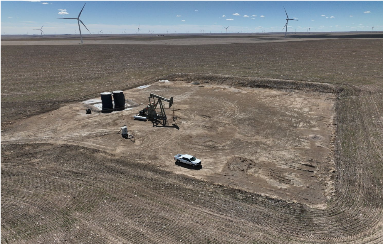
Photo 5. Drone aerial photo facing southwest toward the location.