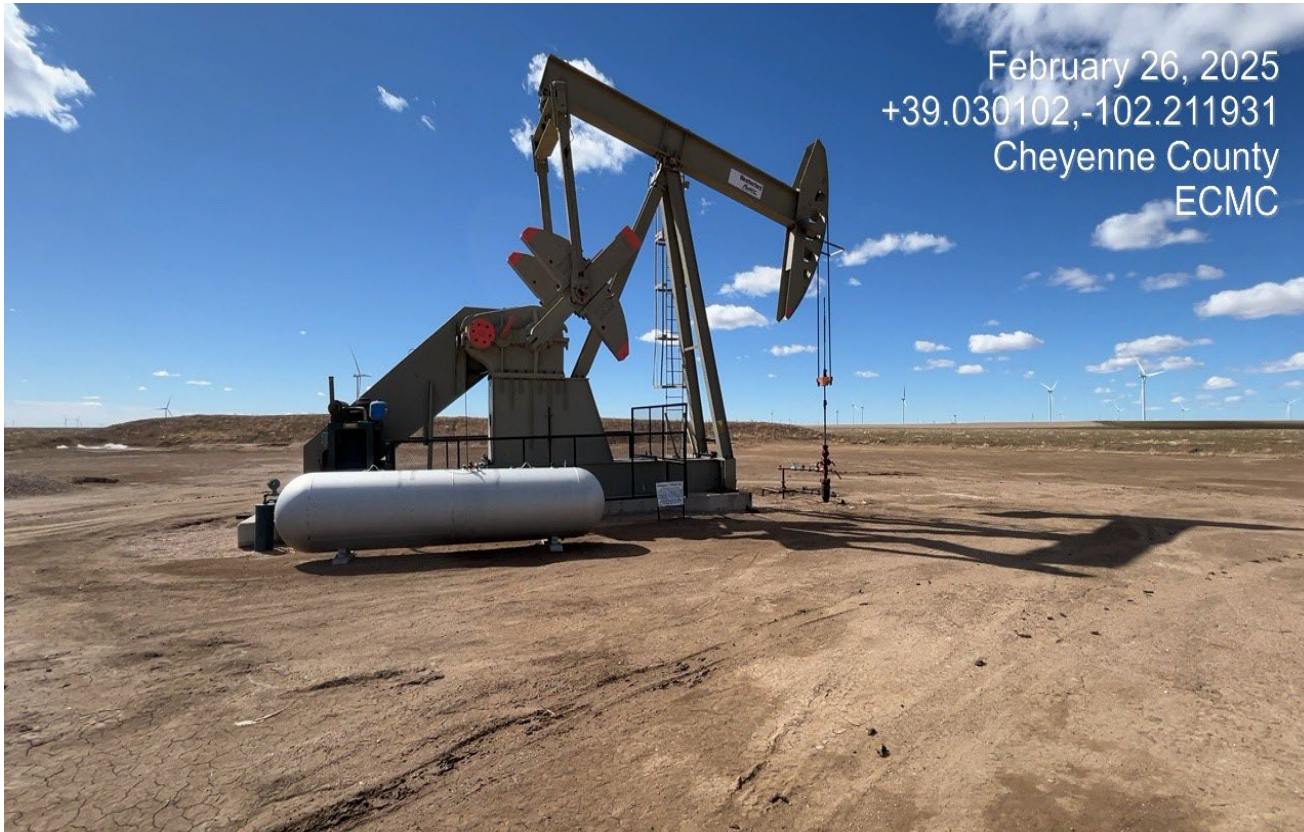
Photo 4. North side of the location facing south. Unused areas of the location have not been reclaimed.