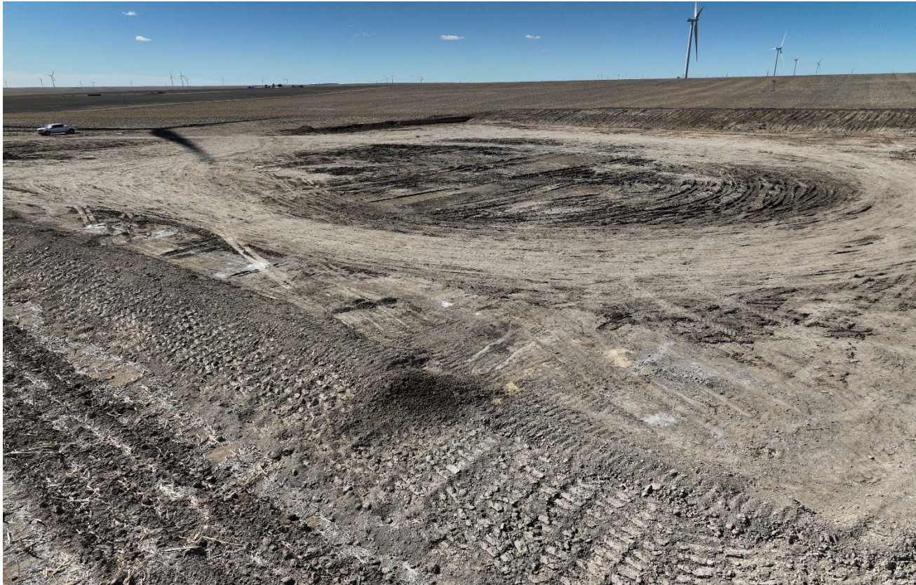
Photo 12. Drone aerial photo facing southwest. There are various white substance spills along the east side of the pad.