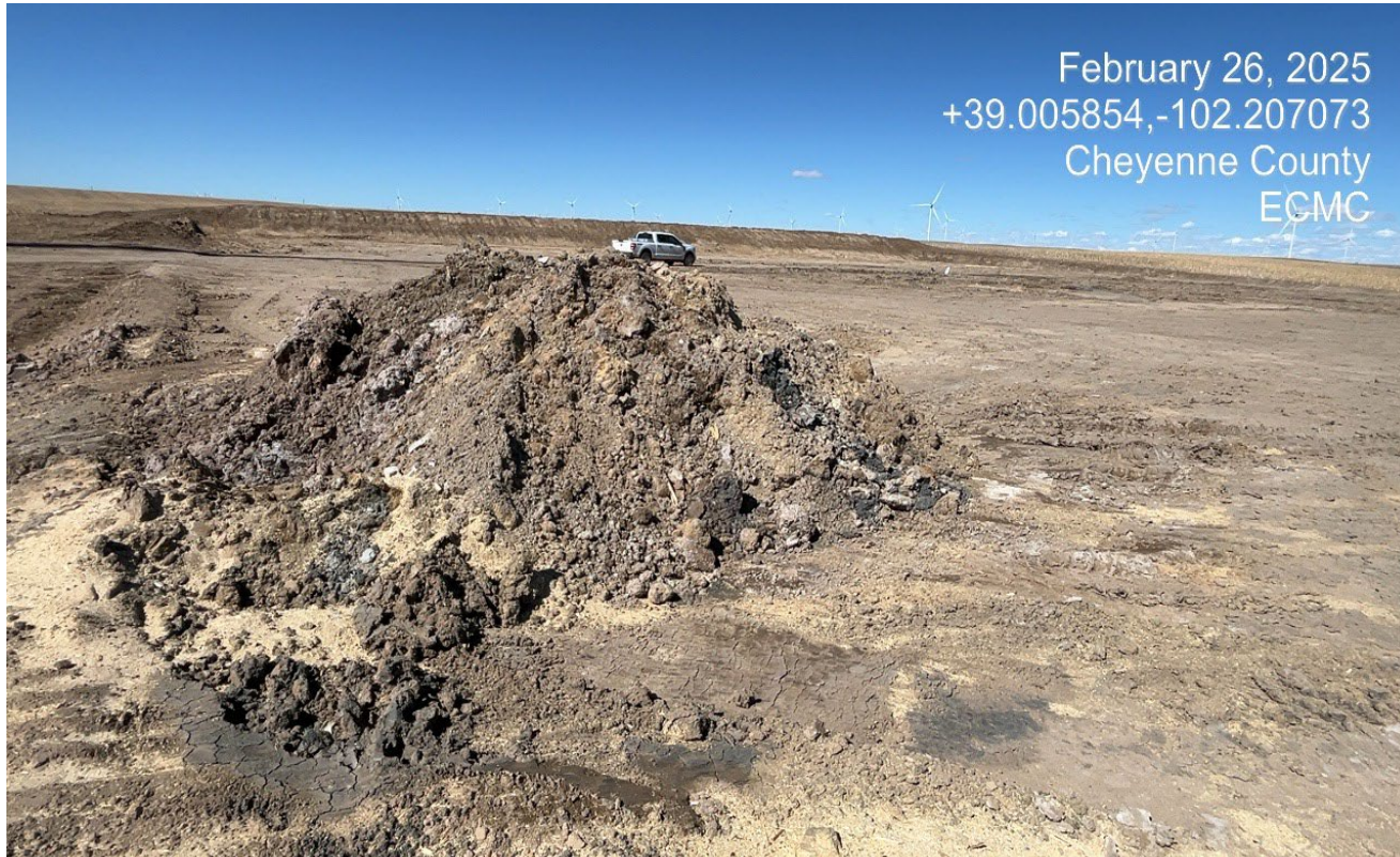
Photo 10. There is a pile of drill cuttings and mud mixed with sawdust at the southeast corner of the location..