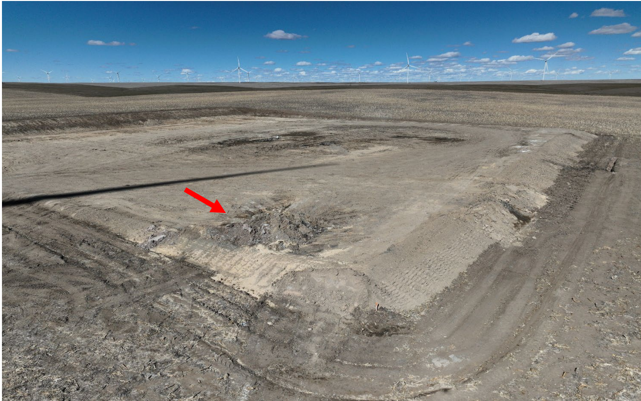
Photo 11. Drone aerial photo facing northwest. Red arrow points to the drill cuttings pile shown in the previous photo.