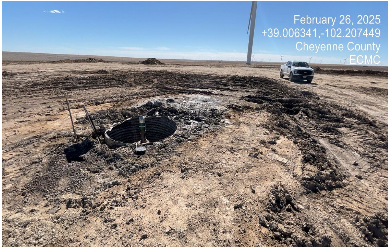
Photo 4. Facing back south at the wellhead. There is grey and blackened mud all around the wellhead. Drilling mud was not properly managed during the drilling process.