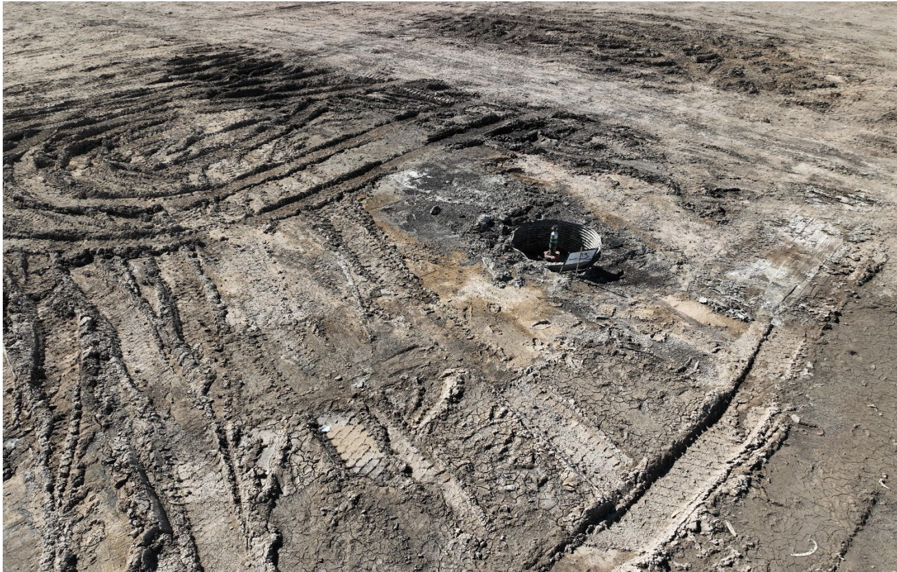
Photo 14. Drone aerial photo facing down toward the wellhead. There is grey and blackened mud all around the wellhead. Drilling mud was not properly managed during the drilling process.