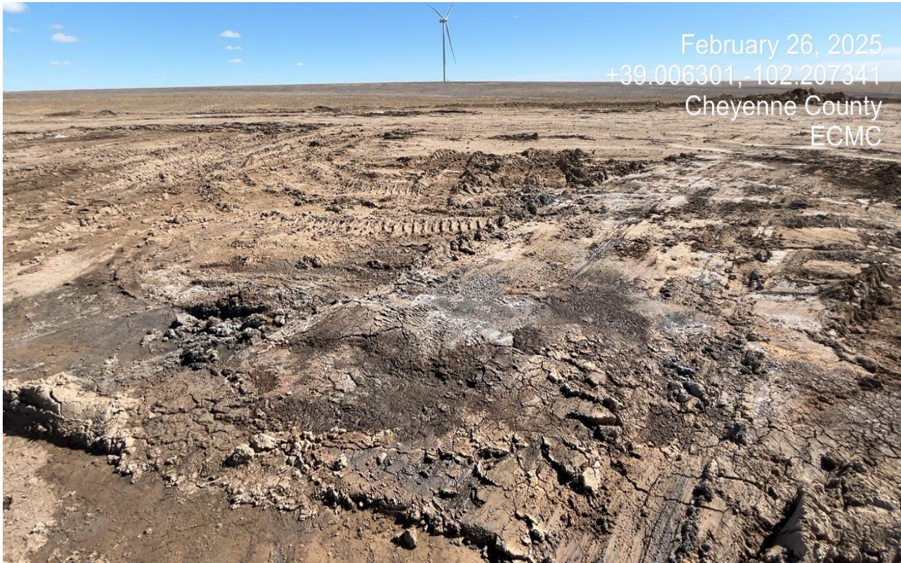
Photo 6. Facing east at the location. There is grey and blackened mud all around the wellhead. Drilling mud was not properly managed during the drilling process.