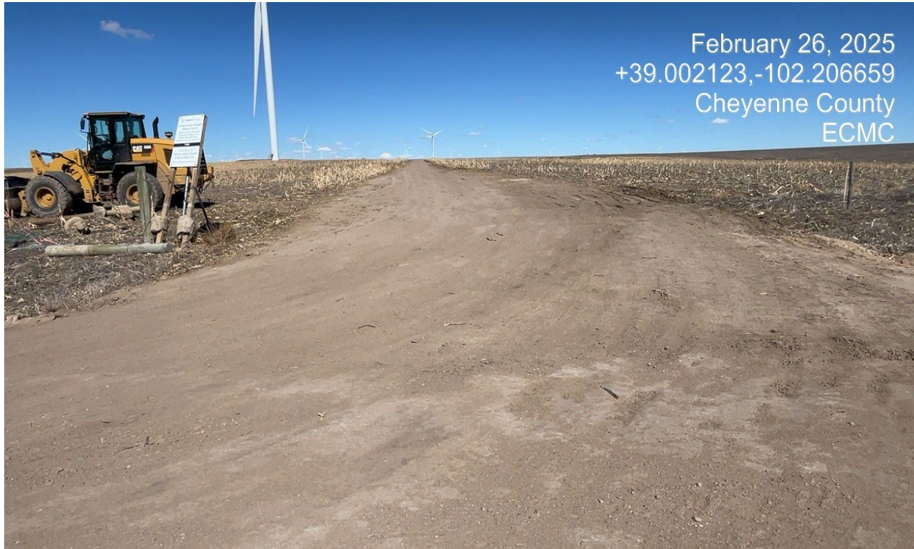
Photo 1. Facing north toward the access road.