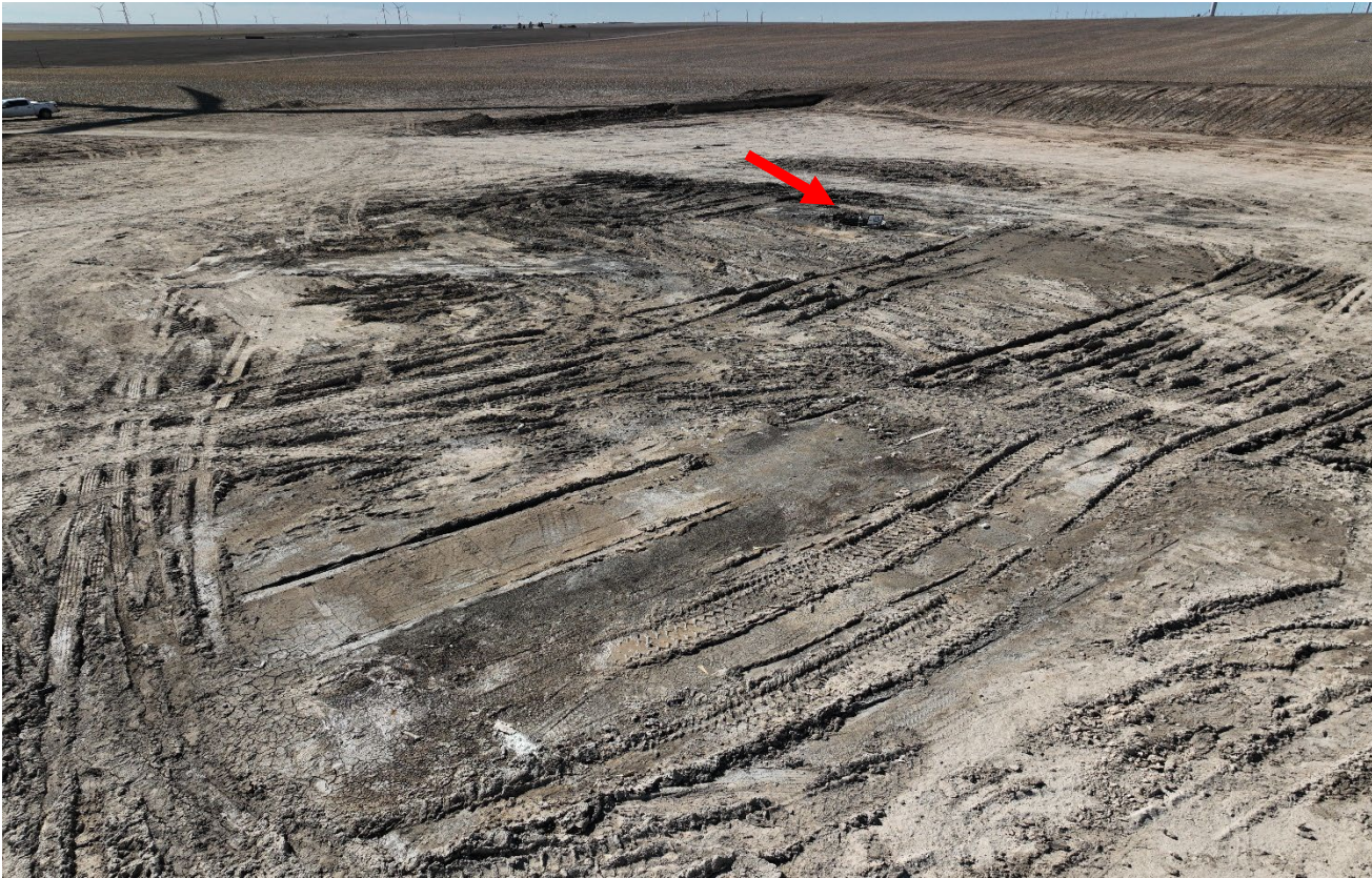
Photo 13. Drone aerial photo facing southwest. There is grey and blackened mud all around the wellhead. Drilling mud was not properly managed during the drilling process.