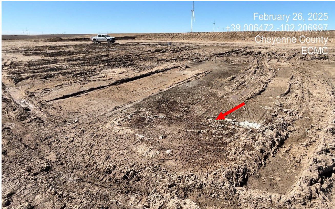
Photo 7. Facing southwest at the location. There are stained soils shown at red arrow..