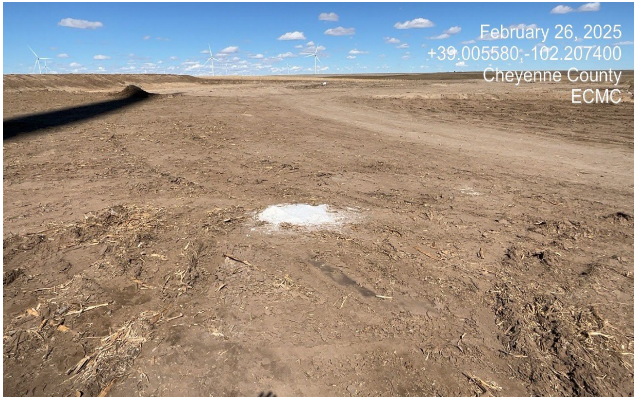
Photo 2. Facing north toward the location. There is a pile of a white substance spill on the ground that needs to be cleaned up. .