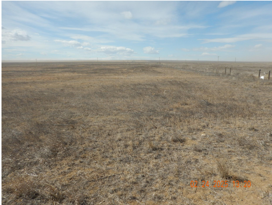
Photo 5. Photo taken from the northeast well location, facing West. Photo illustrates the Operator has performed final reclamation activities. Some establishment was observed throughout portions of the location.