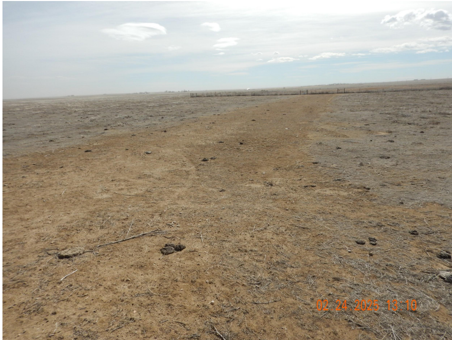
Photo 3. Photo taken from the well location entrance, facing South. Photo illustrates the well location access road. Operator has removed gravel and some establishment was observed throughout portions of the access road.

Note- well location is fenced in the background.