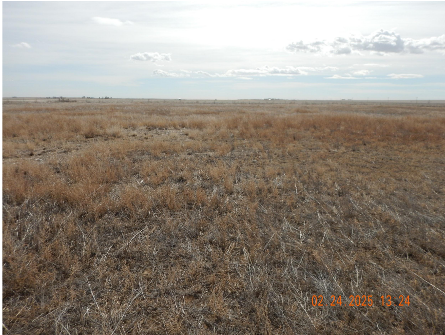
Photo 7. Photo taken from the central well location, facing South. See comments under Photo 5.