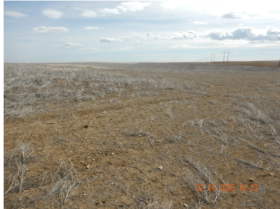
Photo 8. Photo taken from the central well location, facing East. See comments under Photo 5.