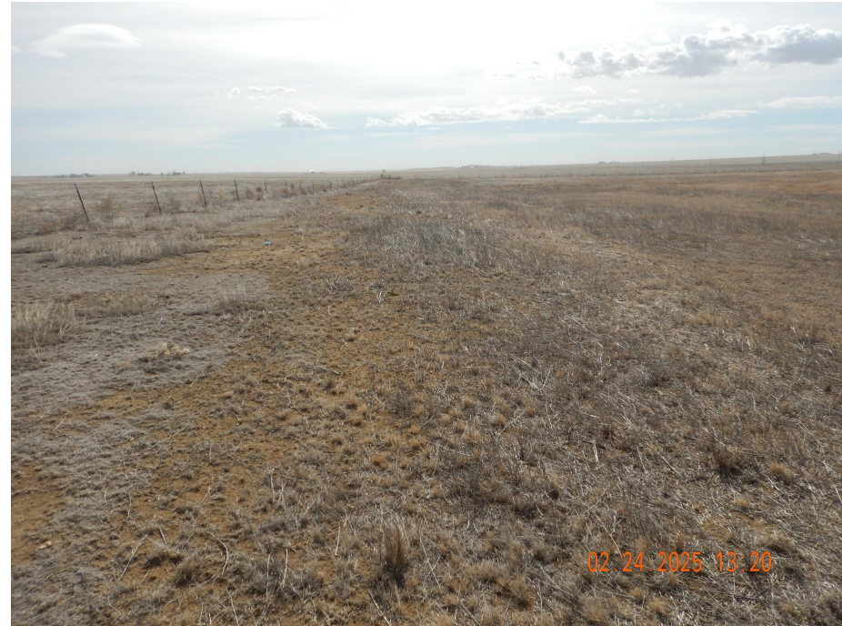
Photo 6. Photo taken from the northeast well location, facing South. See comments under Photo 5.