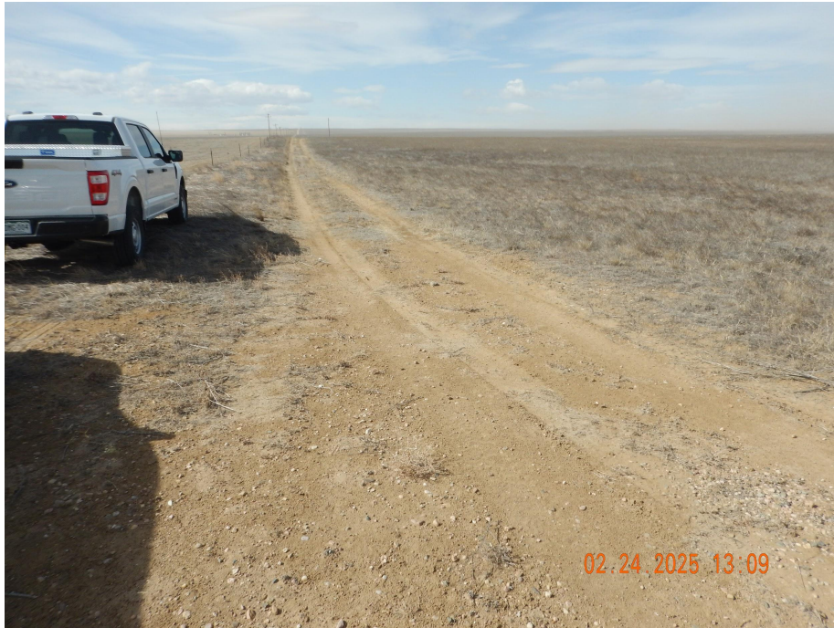
Photo 1. Photo taken from the well location entrance, facing West. Photo illustrates the two-track access road continues west implying that the access road was pre-existing to oil and gas activity.