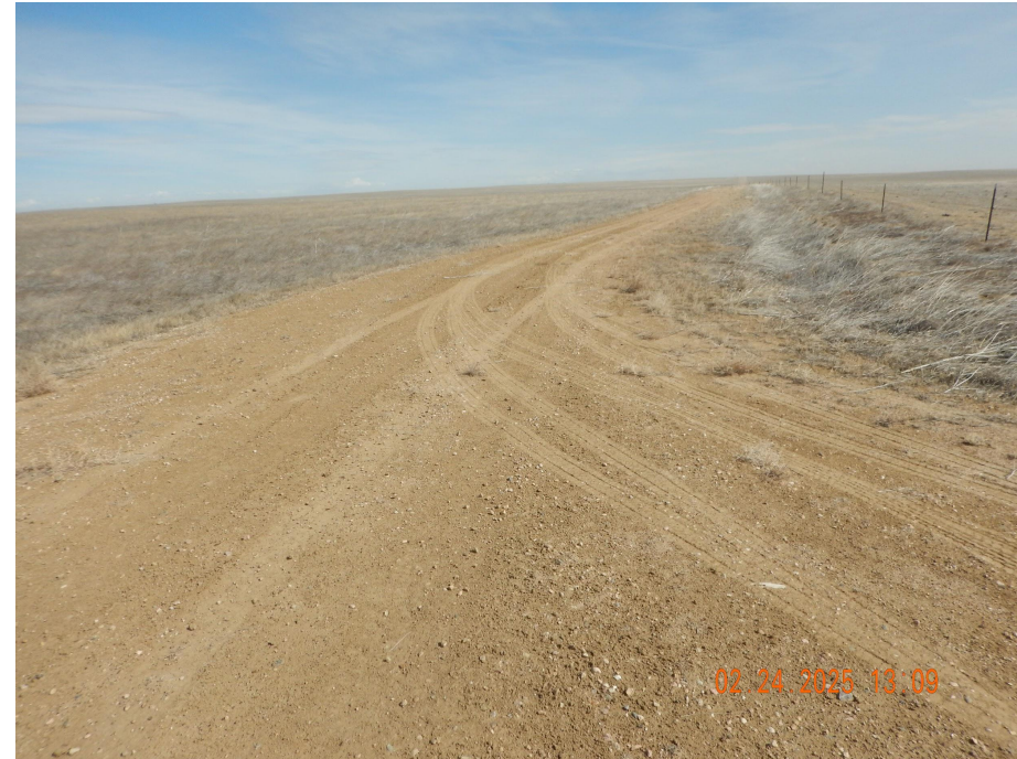
Photo 2. Photo taken from the well location entrance, facing East. Photo illustrates the main access road is stabilized with no erosion issues.