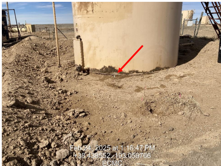
Photo 7 – Impacted soils in tank containment, Spill Id 486875, Impacted soils observed at tank base