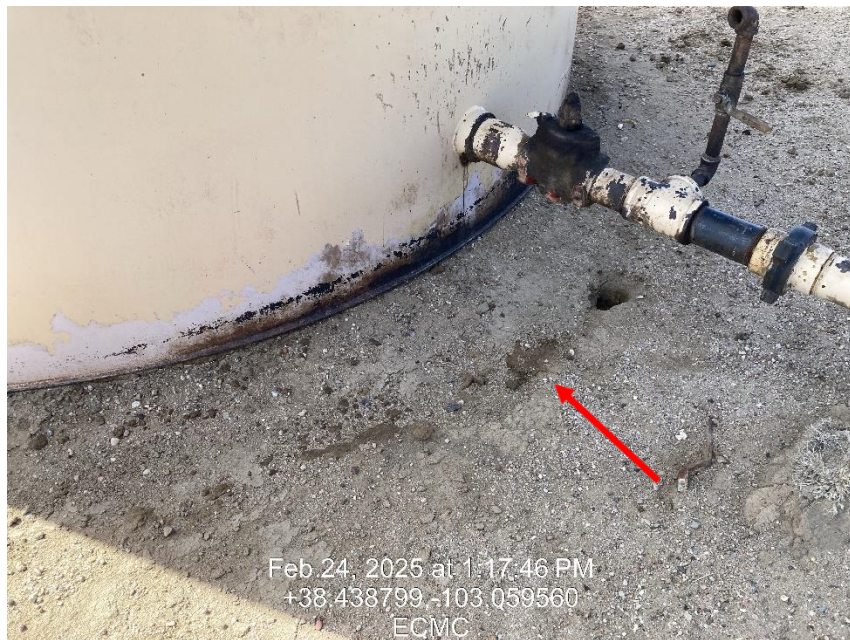
Photo 9 – Impacted soils observed on north side of tank, Spill Id 486875