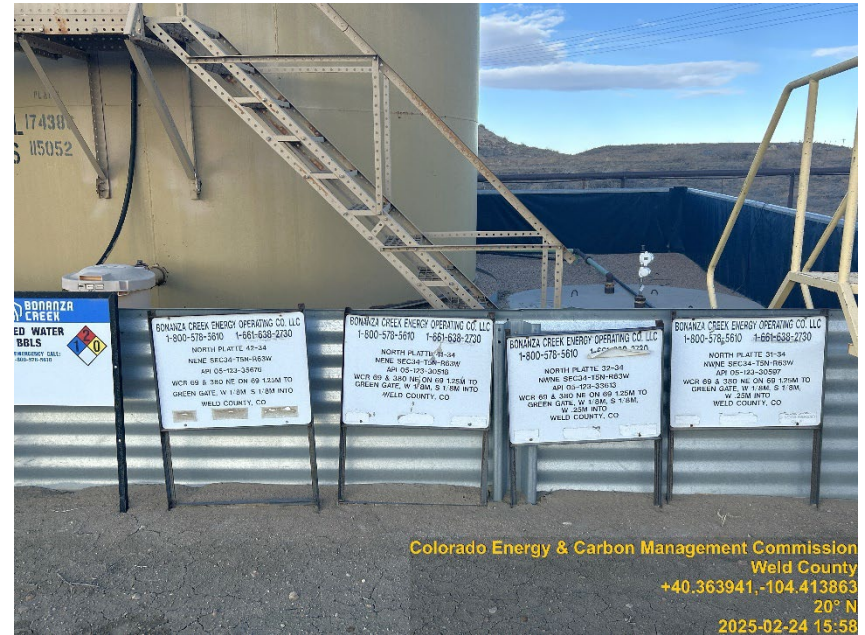
Photo #6 North Platte 41-34, 42-34 Battery site Inactive | Shut-down Facility / Battery signage