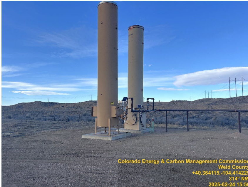
Photo #5 North Platte 41-34, 42-34 Battery site Inactive | Shut-down ECD(s)