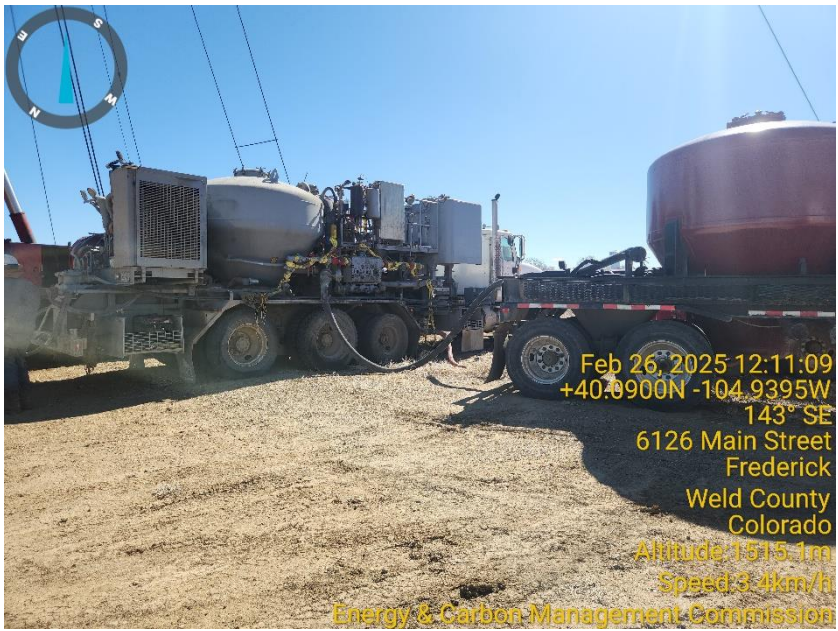
Photo 2 Cement pump.