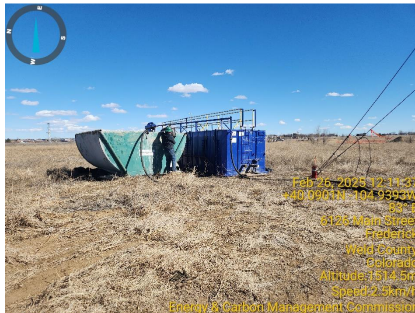
Photo 3 Wellsite