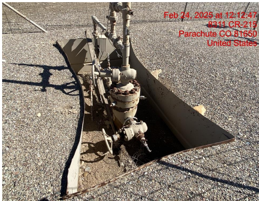
Open Wellhead Cellar – Photo #06819