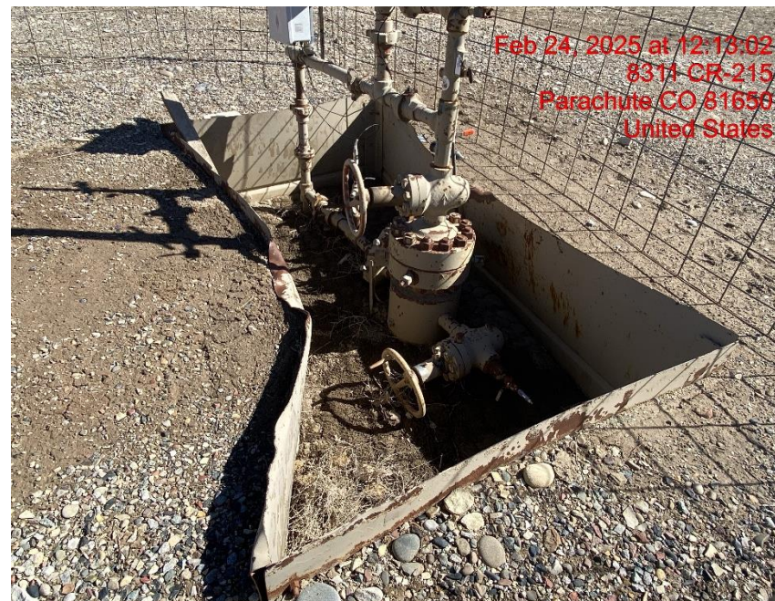
Open Wellhead Cellar – Photo #06820