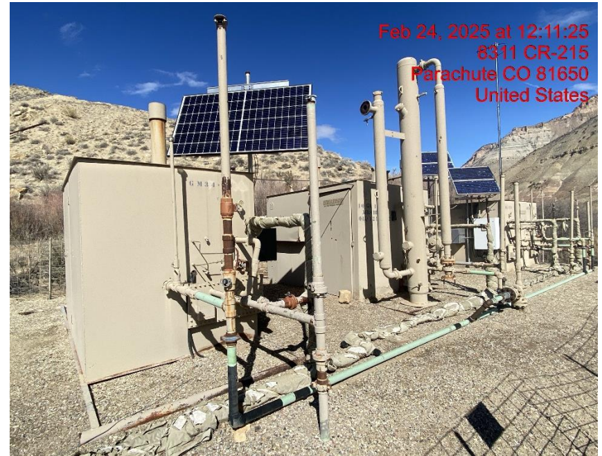
Location – Photo #06816