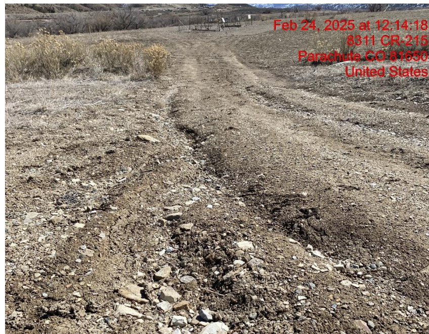
Rill Erosion on Access Road – Photo #06822