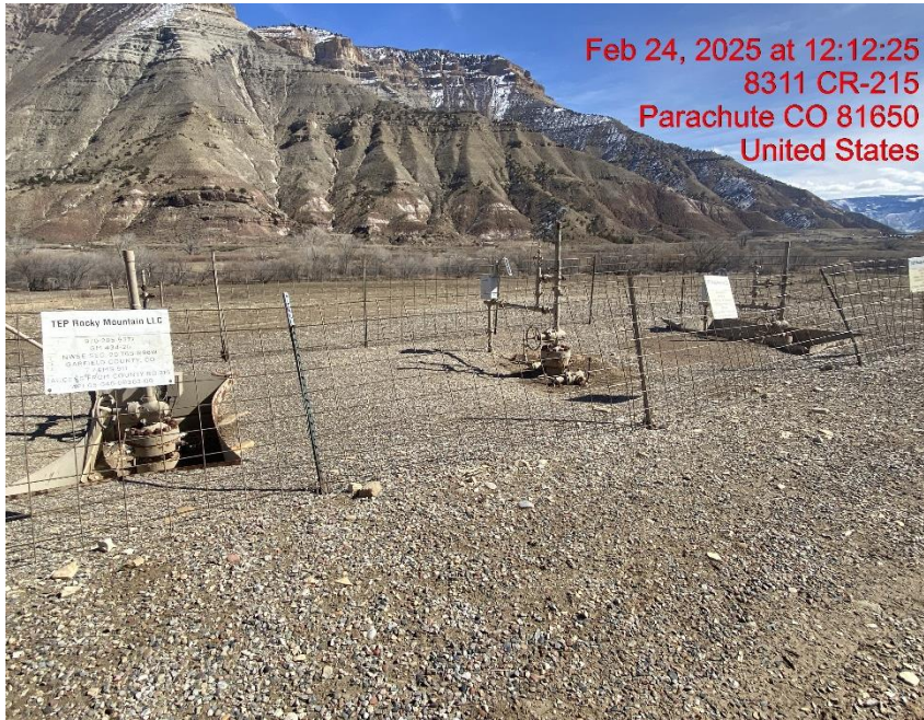
Location – Photo #06817