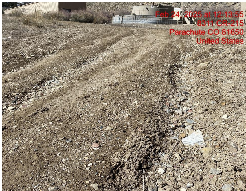
Rill Erosion on Access Road – Photo #06821