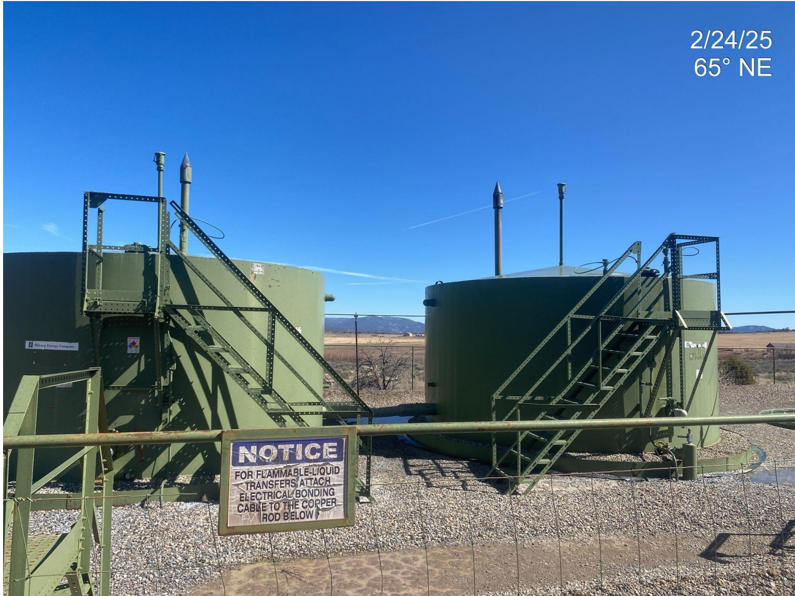
Photo 2. Capacity not displayed at produced water tank labels.