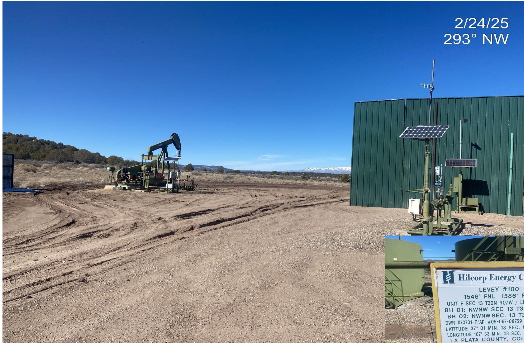
Photo 1. View of the well pad taken from the access point facing center.