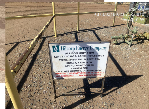
Photo 1. View of the well pad taken from the access point facing center.