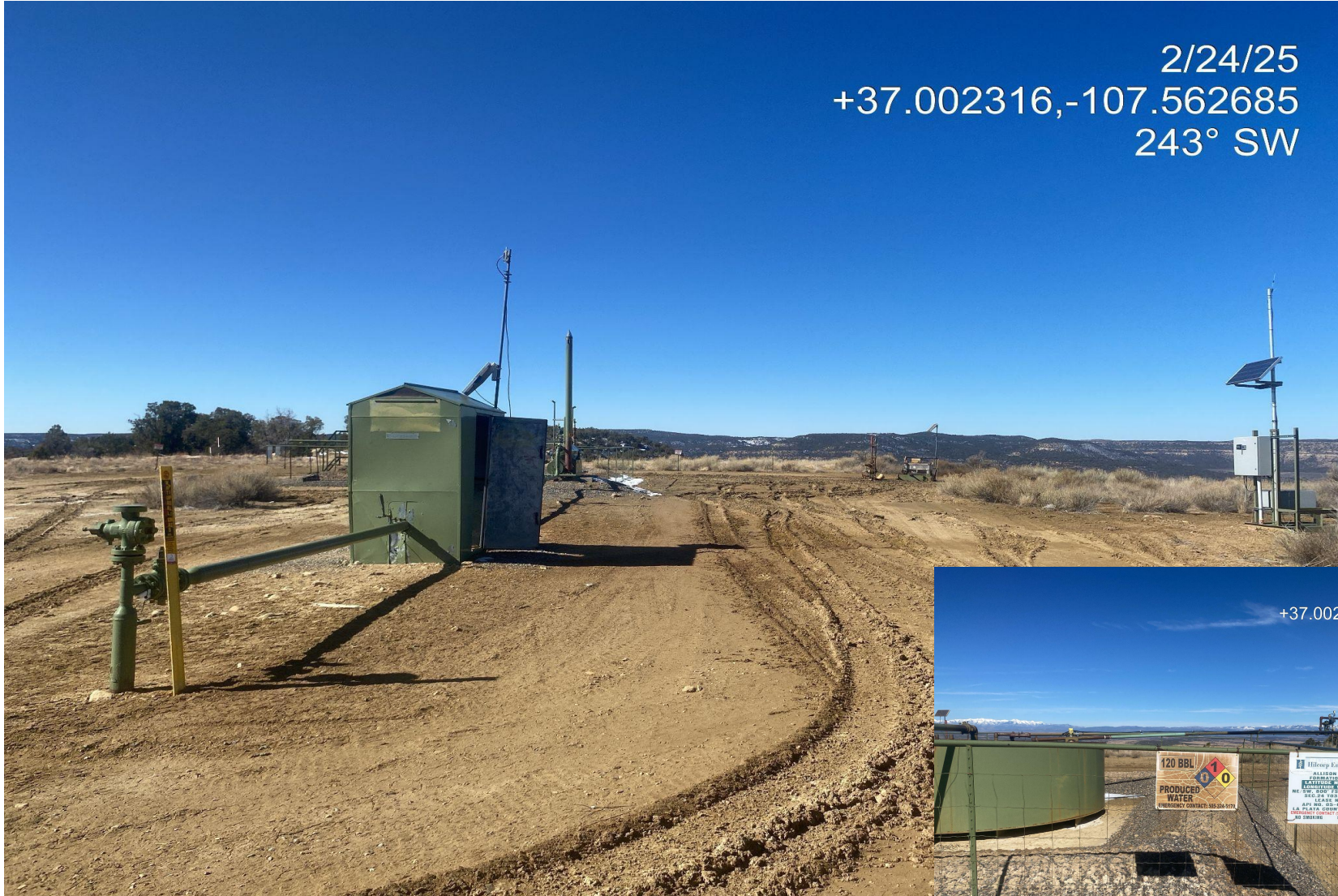
Photo 1. View of the well pad taken from the access point facing center.