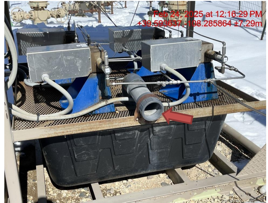
Photo # 5646 Open ended piping/wildlife hazard/available for entry by wildlife