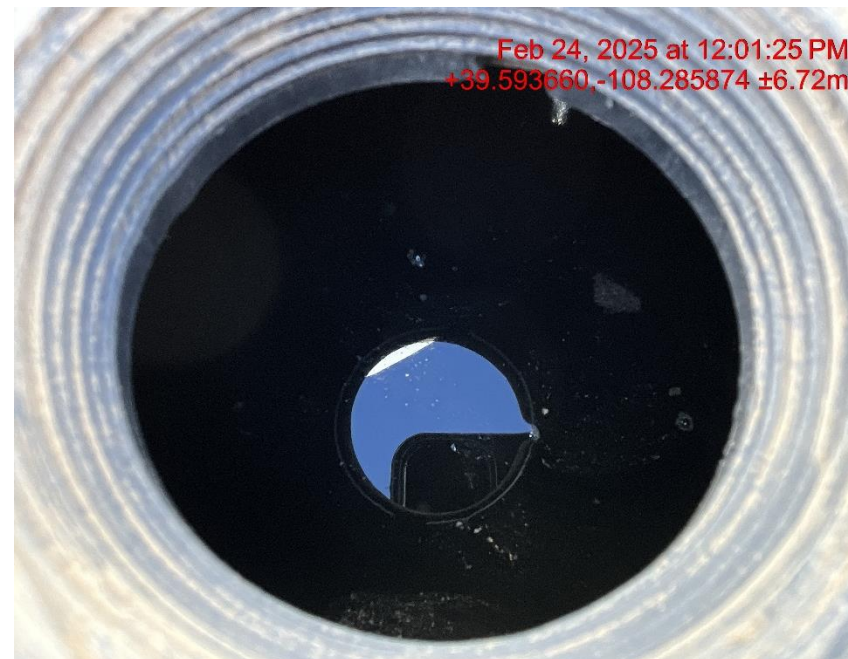
Photo # 5636 Failure to maintain chemical BMP's/chemical containments full of fluid & not sufficient to contain possible spill