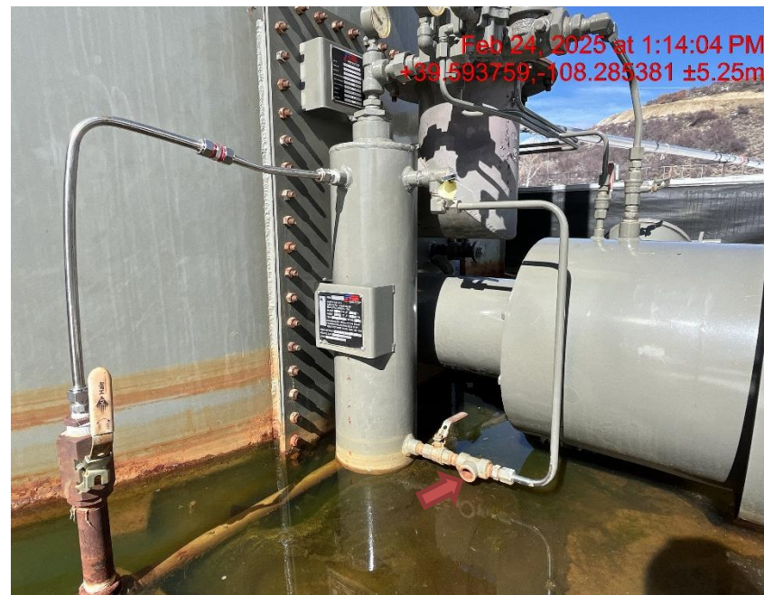
Photo # 5689 PRV vent lines on tank heaters do not comply with CECMC pressure safety device rules