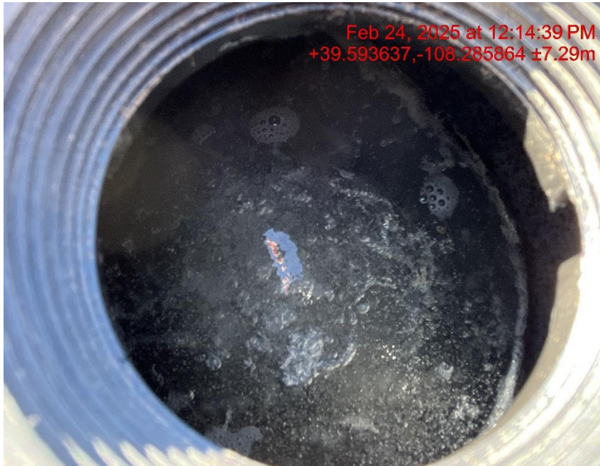
Photo # 5644 Failure to maintain chemical BMP's/chemical containments full of fluid & not sufficient to contain possible spill