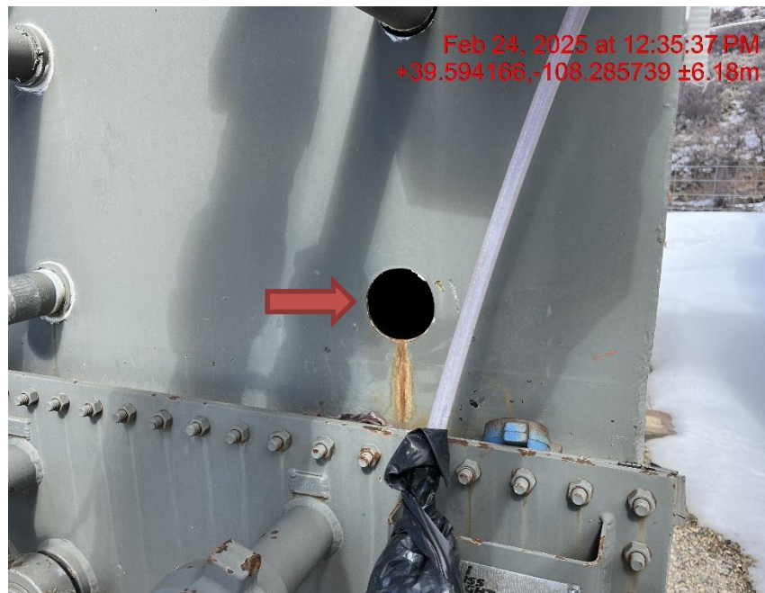
Photo # 5660 Hole in separator building/wildlife hazard/available for entry by wildlife