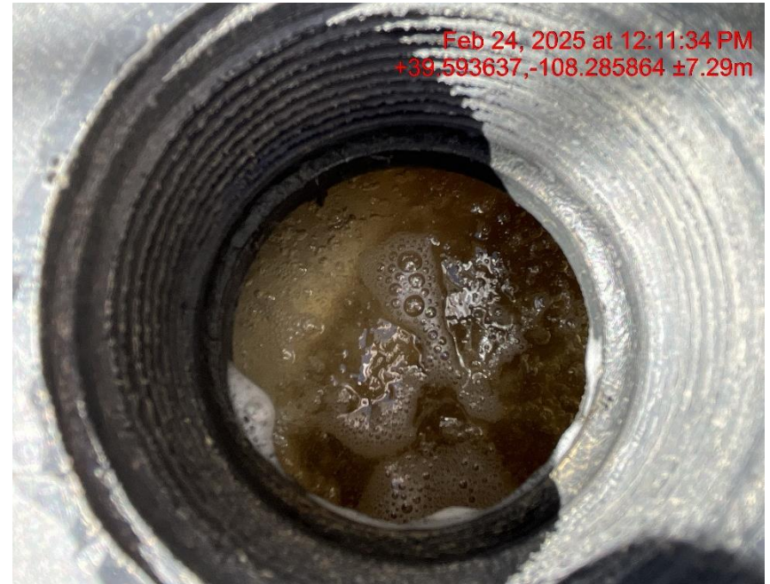
Photo # 5642 Failure to maintain chemical BMP's/chemical containments full of fluid & not sufficient to contain possible spill