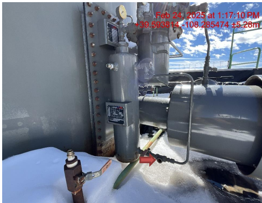
Photo # 5696 PRV vent lines on tank heaters do not comply with CECMC pressure safety device rules