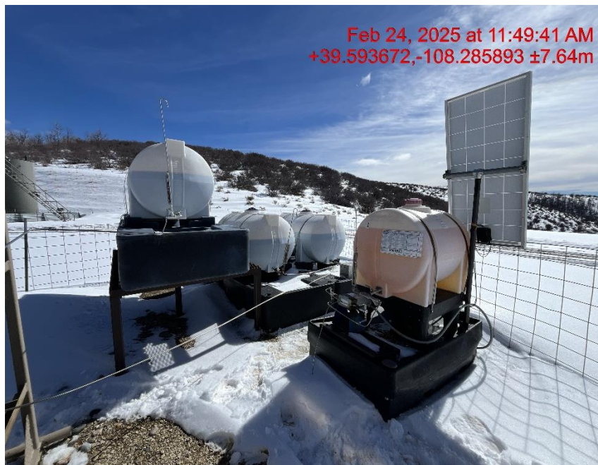
Photo # 5629 Failure to maintain chemical BMP's/chemical containments full of fluid & not sufficient to contain possible spill