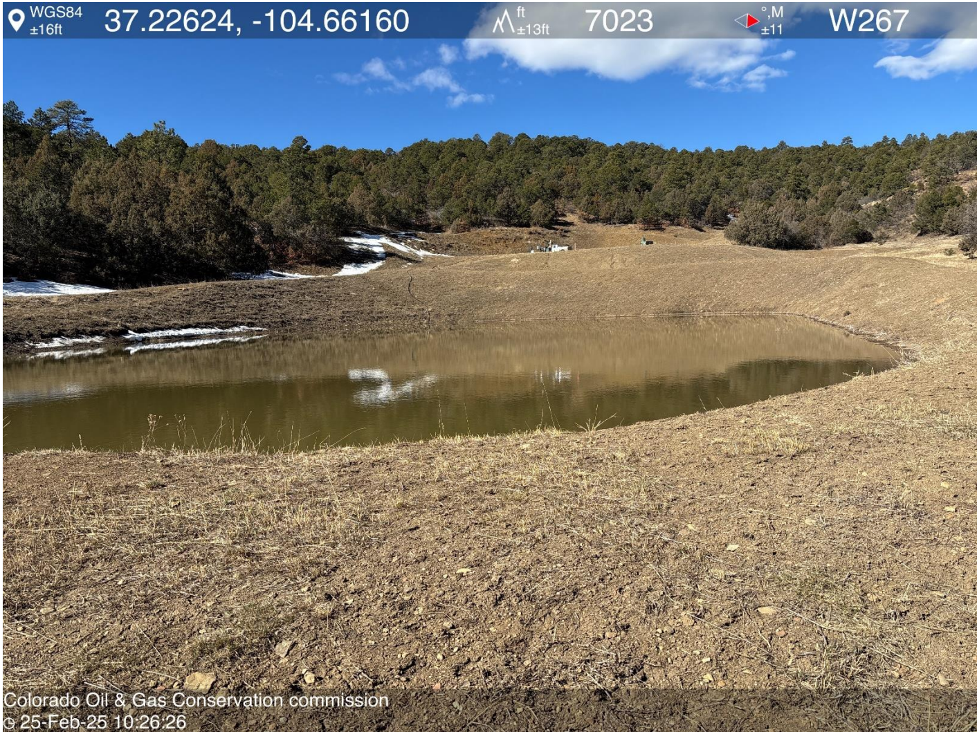
PHOTO 6: LESS THAN 2' FREEBOARD IN OFF SITE PRODUCED WATER POND AND THERE IS NO FREEBOARD MARKER. Install freeboard marker Lower fluid level so at least two feet of freeboard exists per Rule 909.c. DO TO ROAD CONTITIONS AND WELL IS NOT RUNNING IM EXTENDING CA TIME TO 48 HOURS. CA DATE 2/27/2025.