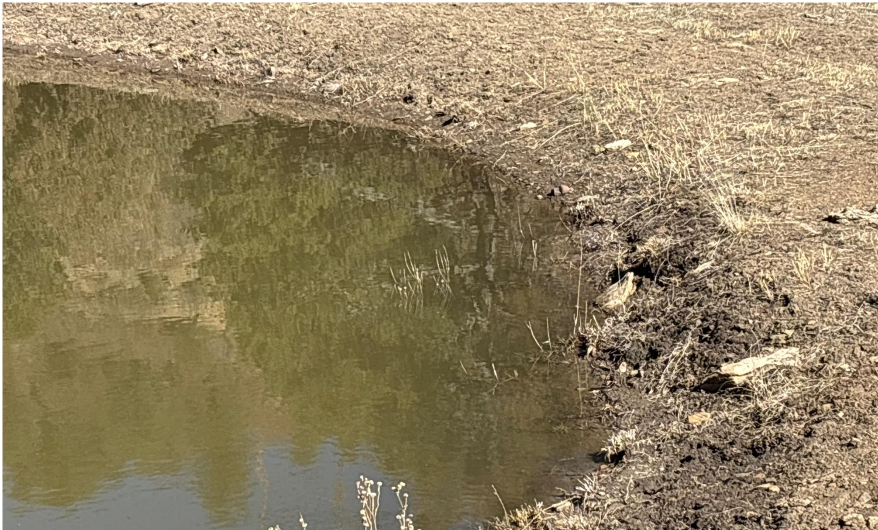
PHOTO 5: LESS THAN 2' FREEBOARD IN OFF SITE PRODUCED WATER POND AND THERE IS NO FREEBOARD MARKER. Install freeboard marker Lower fluid level so at least two feet of freeboard exists per Rule 909.c. DO TO ROAD CONTITIONS AND WELL IS NOT RUNNING IM EXTENDING CA TIME TO 48 HOURS. CA DATE 2/27/2025.