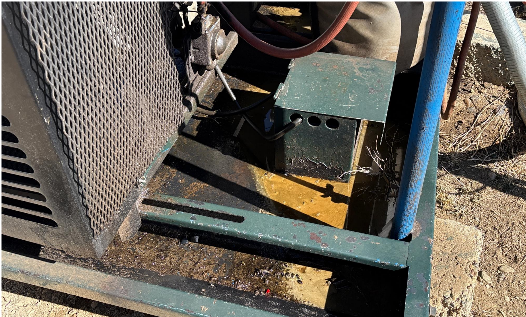
PHOTO 4: STANDING OILY WASTE INSIDE ENGINE SKID. DRAIN OILY WASTE REPAIR ALL LEAKS SOIL PER RULE 1002..(2).D & 1002.f.(2)B, Comply with general provisions of the oil and gas act for wildlife protection AND SB-181. 2/26/2025.