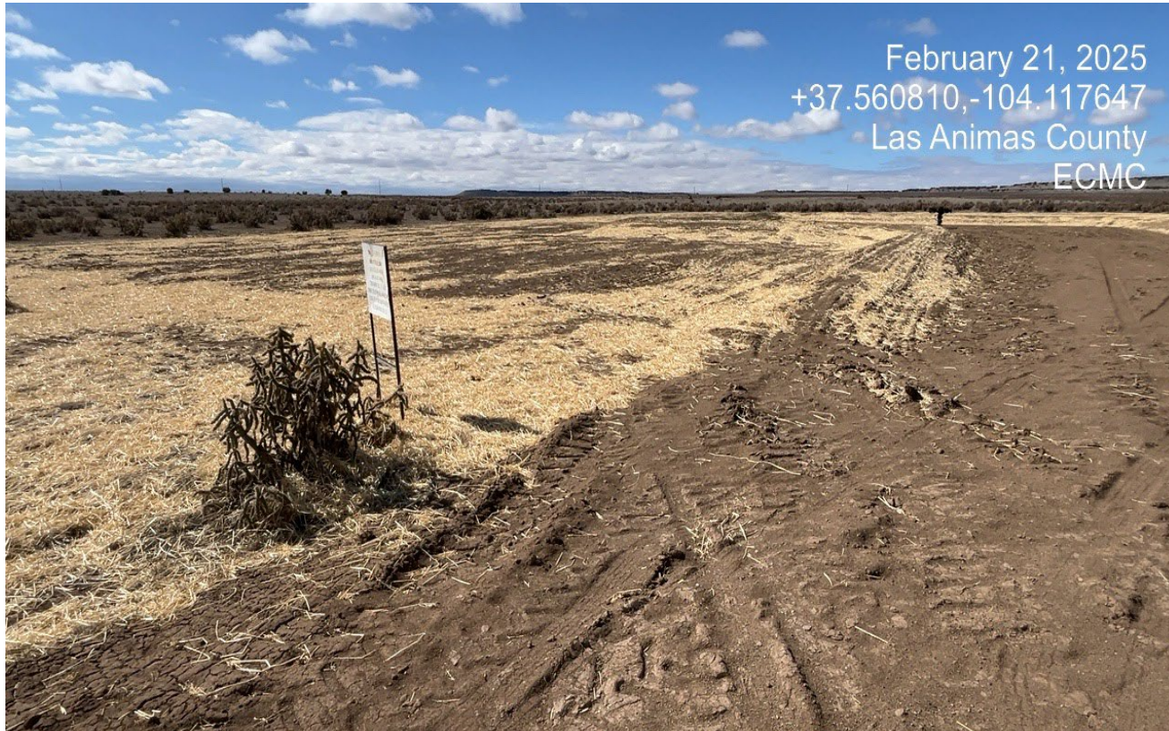
Photo 3. Facing southwest toward the location. The location has been reduced in size and reclaimed. The topsoil pile has been replaced.