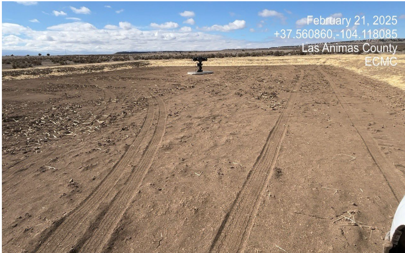
Photo 5. Facing west toward the wellsite. There is a topsoil berm around the perimeter of the pad. Stormwater drainage from the working pad surface will need to be considered.