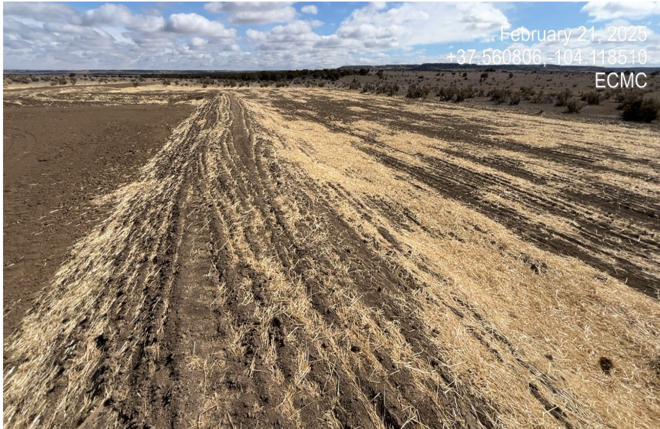
Photo 7. Facing east at the south side of the location.