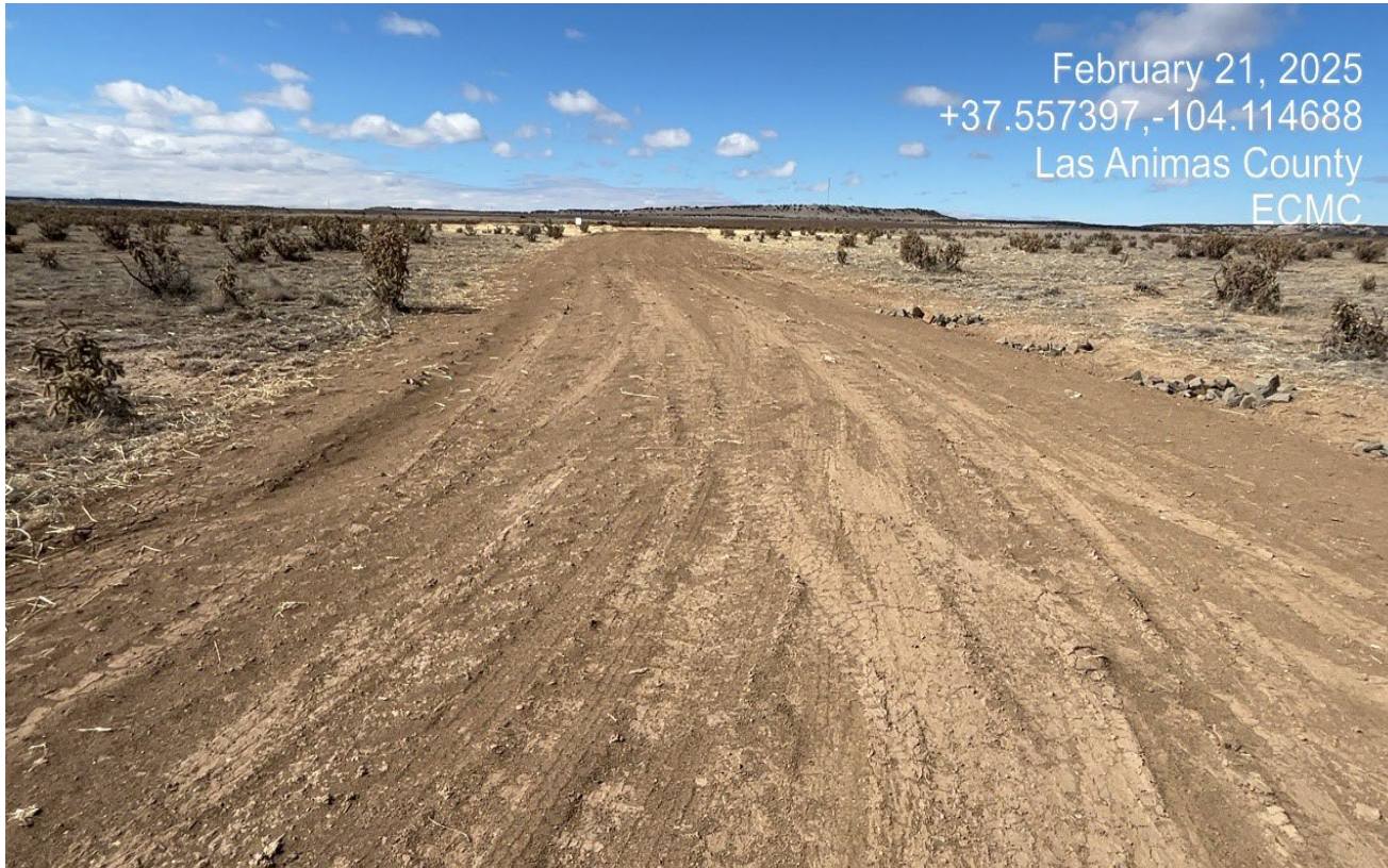
Photo 1. Facing west along the access road. The side of the access road needs to be seeded and stabilized.