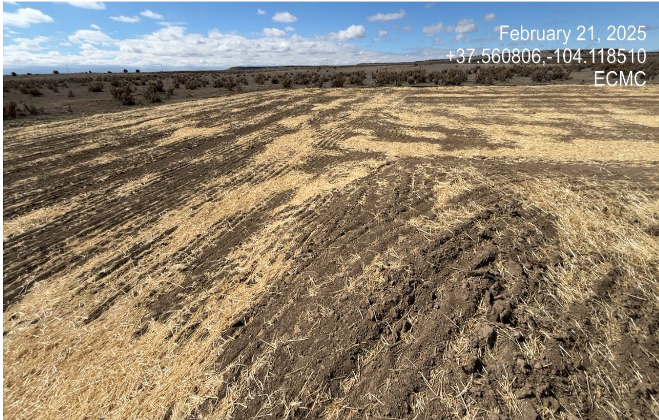
Photo 6. Facing toward the southwest side of the location. Some of the straw mulch has blown off the seeded soil.