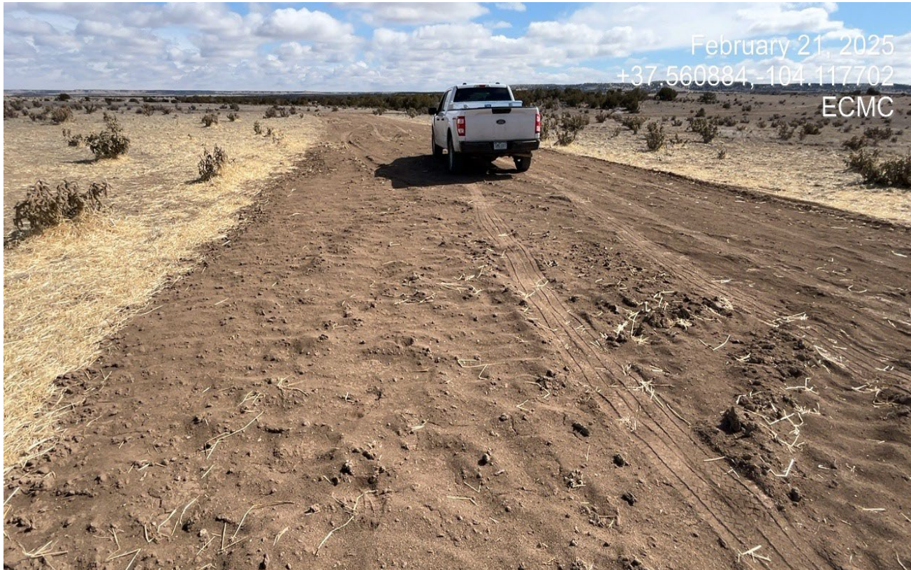
Photo 2. Standing at the east side of the location facing east toward the access road. There are loose soils along the road side that must be seeded and stabilized.